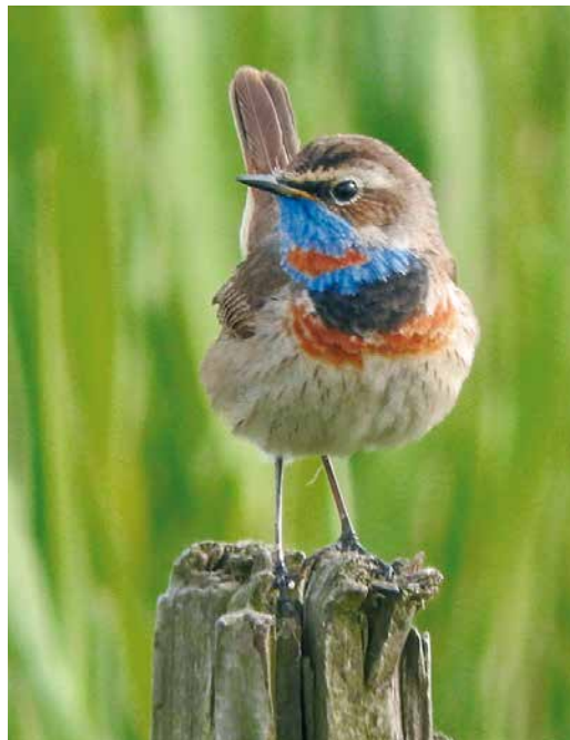
393 Orpheusspotvogel / Melodious Warbler Hippolais polyglotta , Oostkapelle, Zeeland, 15 juni 2019 394 Roodsterblauwborst / Red-spotted Bluethroat Luscinia svecica svecica , mannetje, Eempolders, Eemnes, Utrecht, 25 mei 2019 395 Kleine Vliegenvanger / Red-breasted Flycatcher Ficedula parva , adult mannetje, Hoge Veluwe, Gelderland, 23 juni 2019