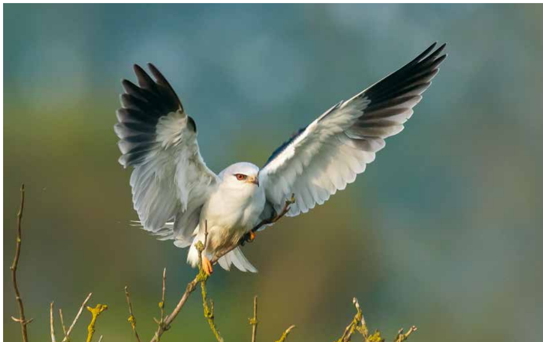
375 Grijsze Wouw / Black-winged Kite Elanus caeruleus , Terhole, Zeeland, 11 mei 2019 (Corstiaan Beeke)