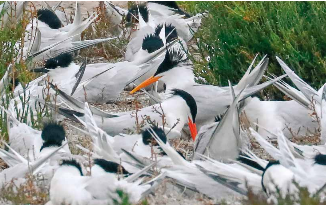
363 Elegant Terns / Sierlijke Sterns Sterna elegans , adults, with Sandwich Terns / Grote Sterns S. sandvicensis , Marjal dels Moros, Valencia, Spain, 25 May 2019 (Massimiliano Dettori)