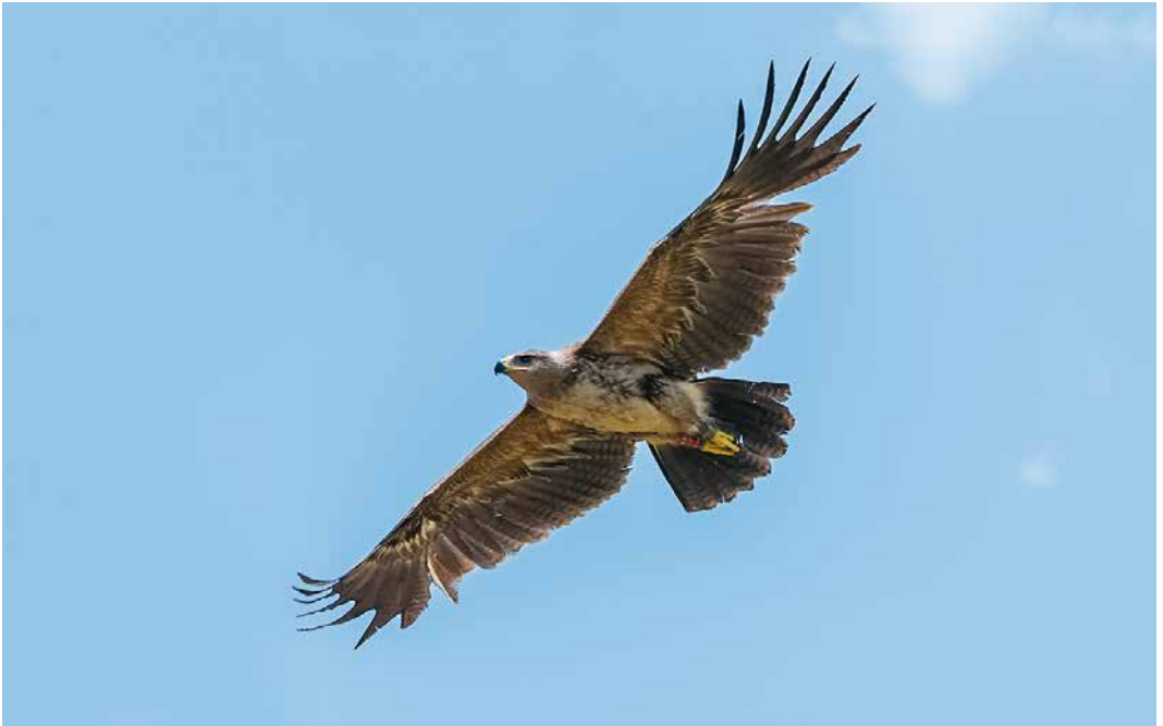
364 Hybrid Lesser Spotted x Greater Spotted Eagle / hybride Schreeuwarend x Bastaardarend Clanga pomarina x clanga, second calendar-year, Witkowo, Western Pomerania, Poland, 5 June 2019. Ringed as pul- lus at Kampinowska forest, Mazowsze, Poland, on 3 July 2018. 365 Cinereous Vulture / Monniksgier Aegypius monachus, second calendar-year, Hellendoorn, Overijssel, Netherlands, 25 May 2019 cf Dutch Birding 41: 198, 2019