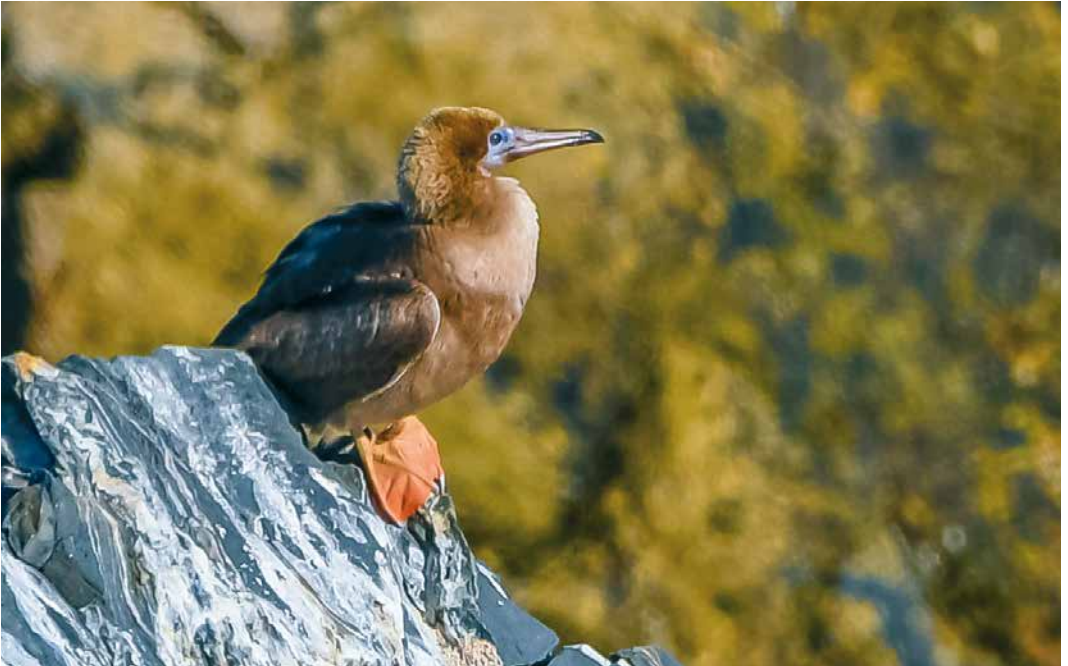
346 Red-footed Booby / Roodpootgent Sula sula , juvenile, Cape Sardão, Odemira, Portugal, 3 June 2019