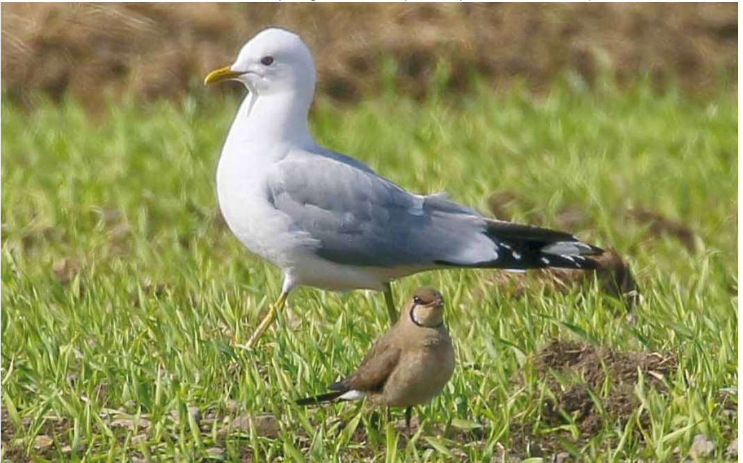
347 Oriental Pratincole / Oosterse Vorkstaartplevier Glareola maldivarum , with Common Gull / Stormmeeuw Larus canus , Hillesland, Karmøy, Rogaland, Norway, 27 May 2019 (Frank Steinkjellå)