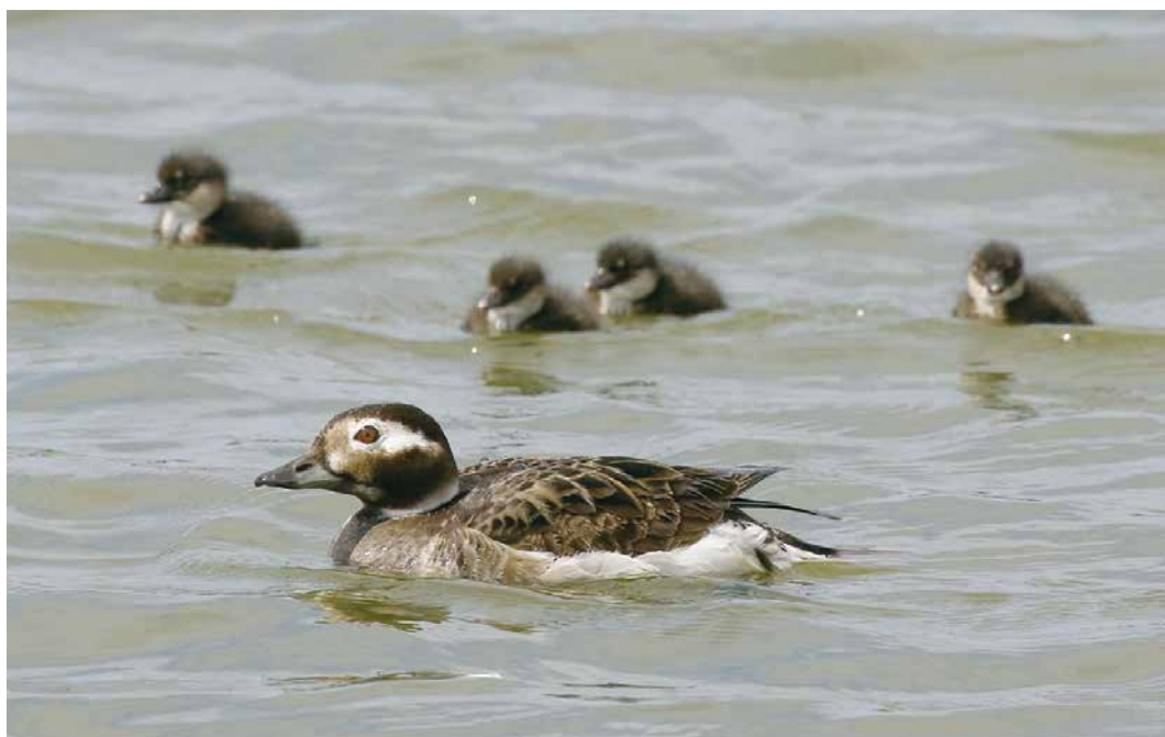
376 Ijseenden / Long-tailed Ducks Clangula hyemalis , vrouwtje met jongen, Marker Wadden, Flevoland, 27 juni 2019