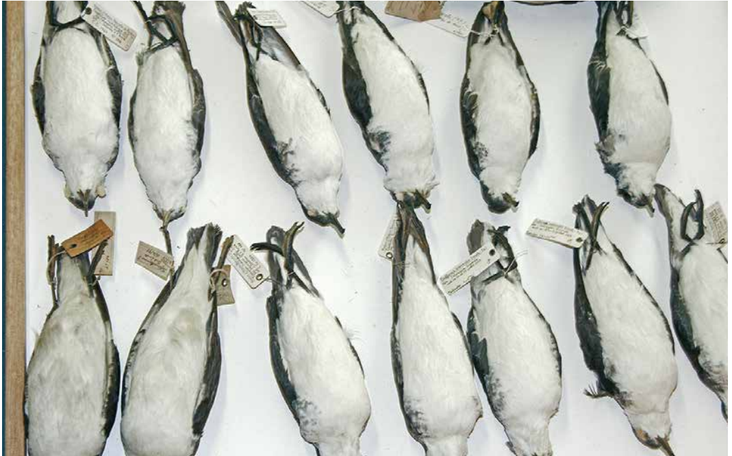
306 Barolo Shearwaters / Kleine Pijlstormvogels Puffinus baroli , Muséum National d'Histoire Naturelle, Paris, France, 12 September 2018 ( Rinse van der Vliet ) 307 Boyd's Shearwaters / Kaapverdise Kleine Pijlstormvogels Puffinus boydi , Muséum National d'Histoire Naturelle, Paris, France, 12 September 2018 ( Rinse van der Vliet ). Despite variation in undertail-covert coloration and pattern discussed in this article, there is fairly high degree of consistency as shown here in trays of museum specimens.