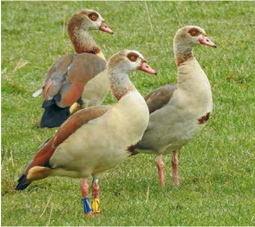
330 Egyptian Geese / Nijlganzen Alopochen aegyptiaca , Saltholme nature reserve, Billingham, Durham, England, 8 April 2018 ( Nicholas Forrest ). In front YXBV, second-calendar year male, hatched mid-May 2017 at Vondelpark, Amsterdam, Noord-Holland, Netherlands, colour-ringed as pullus on 21 July 2017.

female (plate 331). Breeding was confirmed on 1 April 2019 when AM took photographs of YXBV guarding a female breeding on a nest in a bowl in a fork of a large willow Salix (plate 332). The tree was located on a tiny island, and an undated photograph taken by the keeper of the park's café shows that the nest contained seven eggs. AM reported that breeding continued for another two weeks, but that the nest was abandoned on 20 April.