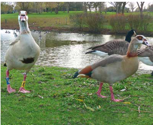
331 Egyptian Geese / Nijlganzen Alopochen aegyptiaca, with Canada Geese / Grote Canadese Ganzen Branta canadensis, Swanley Park, Swanley, Kent, England, 29 November 2018. Left YXBV, male, paired with unringed female, hatched mid-May 2017 at Vondelpark, Amsterdam, Noord-Holland, Netherlands, colour-ringed as pullus on 21 July 2017. 332 Egyptian Goose / Nijlgans Alopochen aegyptiaca, female breeding on nest, Swanley Park, Swanley, Kent, England, 1 April 2019. Partnered with male YXBV (cf plate 331).

Young were not observed and there was no clear cause of the failure of this breeding attempt (the pair was still present on 14 May).