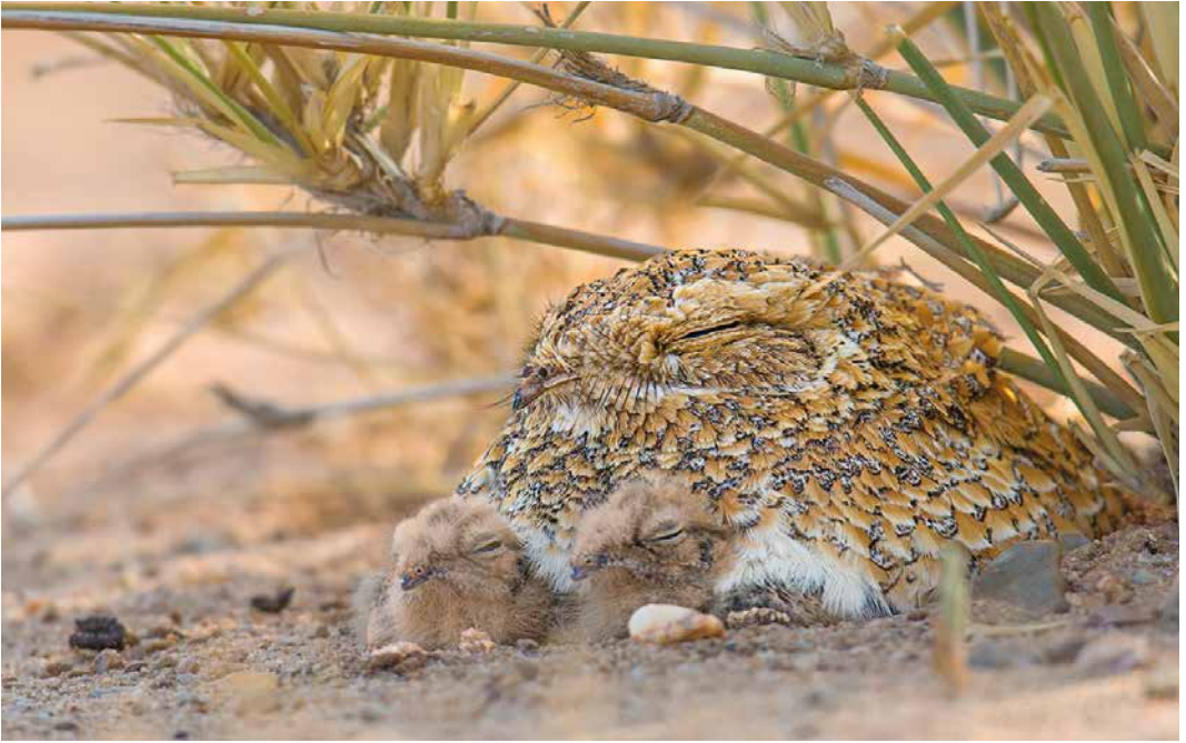
334-335 Golden Nightjars / Goudgele Nachtzwaluwen Caprimulgus eximius , female with two chicks, Oued Chiaf, c 55 km from Aousserd, Western Sahara, Morocco, 19 March 2019