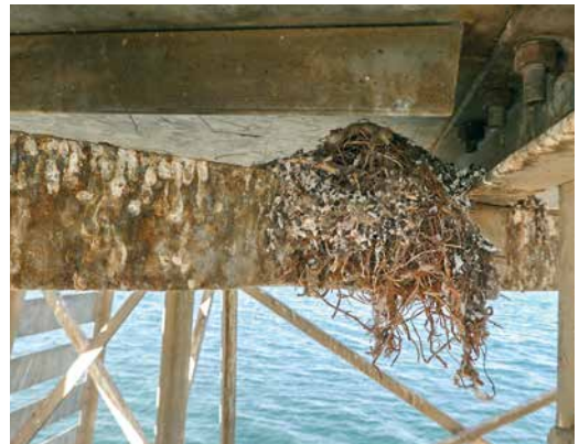
315 Rocky islet with breeding site of African Pied Wagtail Motacilla aguimp , lake Nasser, Egypt, 26 April 2016 ( Jens Hering ) 316 Rocky islet with breeding site of African Pied Wagtail Motacilla aguimp and House Sparrow Passer domesticus colony, lake Nasser, Egypt, 2 May 2016 ( Jens Hering ) 317 Flat rocky islet with breeding site of African Pied Wagtail Motacilla aguimp at edge of colony of Gull-billed Tern Gelochelidon nilotica , lake Nasser, Egypt, 29 April 2017 ( Jens Hering ) 318 Maritime aid with nest of African Pied Wagtail Motacilla aguimp from previous season and occupied breeding site of Yellow-billed Kite Milvus aegyptius , lake Nasser, Egypt, 6 January 2018 ( Jens Hering ) 319 Rock caves with one occupied and one empty nest of African Pied Wagtail Motacilla aguimp , lake Nasser, Egypt, 1 May 2016 ( Jens Hering ) 320 Nest of African Pied Wagtail Motacilla aguimp from previous breeding season on steel girder belonging to maritime aid, lake Nasser, Egypt, 6 January 2018 ( Jens Hering )