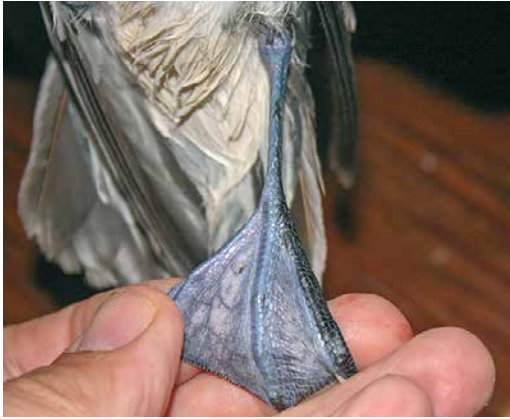
312 Barolo Shearwater / Kleine Pijlstormvogel Puffinus baroli , Selvagem Grande, Selvagens, 6 June 2010. Note colours and pattern.