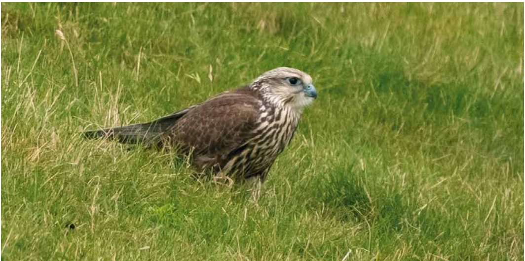
401 Sakervalk / Saker Falcon Falco cherrug , juveniel, Wieringen, Noord-Holland, 20 juli 2019 (Arnoud B van den Berg)

Op 27 juni zag Libbe Zijlstra vanuit zijn rijdende auto langs de provinciale weg tussen Workum en Parrega, Friesland, een afwijkende vogel tussen de Kieviten V. vanellus staan. Het bleek een Grijskopkievit V. cinereus , een broedvogel van Noordoost-China en Japan die 's winters regelmatig ver wegtrekt naar Zuidoost-Azië en in 2006-17 zelfs zes keer als dwaalgast Australië bereikte. Deze vogel trok anders dan de vorige drie nieuwe soorten wel direct heel veel vogelaars. Dat kwam omdat het mogelijk dezelfde was als de eerste voor Europa die twee maanden eerder in het zuiden van Noorwegen en Zweden verbleef en waarvan de foto's nog vers in het geheugen lagen. Hij liet zich ook op 28 juni nog bekijken maar vloog om 20:45 weg en was daarna niet meer te vinden. Of het echt om het-