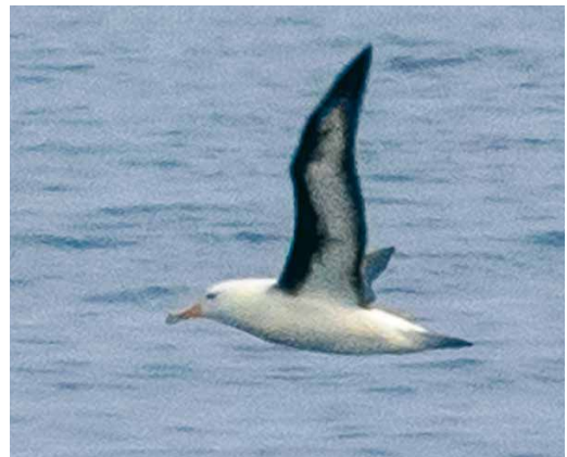
352 Crested Honey Buzzard / Aziatische Wespendiff Pernis ptilorhynchus , female, Masalli, Azerbaijan, 23 May 2019 353 Grey-headed Lapwing / Grijskopkievit Vanellus cinereus , Strandvik, Värmland, Sweden, 14 May 2019 354 Trindade Petrel / Arminjons Stormvogel Pterodroma arminjoniana , pale morph, c 3 km south of Pico, Azores, 26 May 2019 355 Black-browed Albatross / Wenkbrauwalbatros Thalassarche melanophris , immature, Garðskagi lighthouse, Iceland, 12 June 2019

high walls, supposedly attracting other individuals into the death trap by calling; 15% of the corpses had rings which revealed that most must have been subadults (Scott Birds 39: 132-135, 2019). A pale-morph Trindade Petrel Pterodroma arminjoniana was photographed c 3 km south of Pico, Azores, on 26 May. On Montaña Clara islet near Lanzarote, Canary Islands, a Cape Verde Shearwater Calonectris edwardsii was again trapped on 9 July (the first on this islet was trapped on 6 June 2010 and then the species was found here, eg, on 22 July 2016; Dutch Birding 32: 266, 2010, 38: 398, 2016); this time, however, the bird not only had a brood patch but also went into an inaccessible burrow when released. On Lundy, England, the breeding population of Manx Shearwater Puffinus puffinus increased from 297 pairs in 2001 to 5504 in 2017-18, in response to the eradication of rats from the island in the winters of 2002/03 and 2003/04 (Br Birds 112: 217-230, 2019).