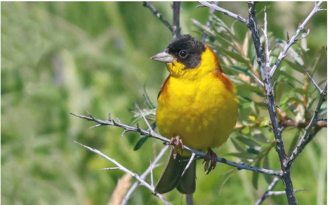
397 Zwartkopgors / Black-headed Bunting Emberiza melanocephala , mannetje, Nes, Ameland, Friesland, 9 juni 2019 (Andries Zijlstra)