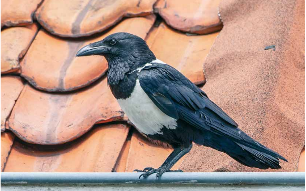
396 Schilddraaf / Pied Crow Corvus albus , adult, Leeuwarden, Friesland, 15 juli 2019 (Co van der Wardt)