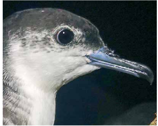
313 Boyd's Shearwater / Kaapverdische Kleine Pijlstormvogel Puffinus boydi , Ilhéus do Rombo, Cape Verde Islands, 9 November 2018 (Jacob González-Solís). Note well-defined two-toned bill.

ence and good views (additional biometrics in appendix 2). Wing and tail measurements on average are slightly shorter for baroli . The wing of baroli is short and broad and the wing-tip can appear clipped and the wing action looks stiff. The wing of boydi is short-medium in length, fairly broad and the wing-tip often appears slightly blunt. The wing action looks more flexible than baroli . In terms of Puffinus shearwaters, on average the tail of baroli is short, while the tail of boydi is on average somewhat longer. Bill measurements of the two species largely overlap.