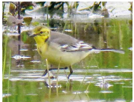
387 Kleine Klapekster / Lesser Grey Shrike Lanius minor , mannetje, Grijpskerk, Groningen, 18 juni 2019 (Kees Bode) 388 Balearische Roodkopklauwier / Balearic Woodchat Shrike Lanius senator badius , tweede-kalenderjaar, Praamweg, Oostvaardersplassen, Flevoland, 14 juni 2019 (Co van der Wardt) 389 Bonte Tapuit / Pied Wheatear Oenanthe pleschanka , mannetje, Noordoosthoek, Vlieland, Friesland, 16 juni 2019 (Durk Lautenbag) 390 Iberische Tjiftjaf / Iberian Chiffchaff Phylloscopus ibericus , Houten, Utrecht, 10 mei 2019 (Julian Bosch) 391 Withalsvliegenvanger / Collared Flycatcher Ficedula albicollis , vrouwtje, Julianadorp, Noord-Holland, 20 mei 2019 (Gerrit Welgraven) 392 Citroenkwikstaart / Citrine Wagtail Motacilla citreola , vrouwtje, Lentevreugd, Wassenaar, Zuid-Holland, 20 mei 2019 (Arjan Portengen)