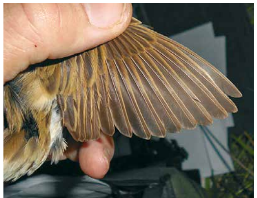
337 Common Grasshopper Warbler / Sprinkhaanzanger Locustella naevia naevia , male, Turku, Finland, 14 June 2016 (Jari Korhonen) 338-339 Common Grasshopper Warbler / Sprinkhaanzanger Locustella naevia naevia , male, Kaarina, Finland, 2 July 2016 (Jari Korhonen) 340 Common Grasshopper Warbler / Sprinkhaanzanger Locustella naevia naevia , male, Salo, Finland, 30 July 2016 (Jari Korhonen) 341 Common Grasshopper Warbler / Sprinkhaanzanger Locustella naevia naevia , yellow morph male, Turku, Finland, 26 May 2016 (Jari Korhonen) 342 Common Grasshopper Warbler / Sprinkhaanzanger Locustella naevia naevia , Raisio, Finland, 4 June 2016 (Jari Korhonen). Note slight emargination on p4.