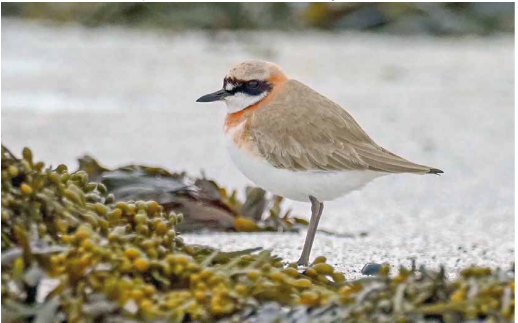
357 Greater Sand Plover / Woestijnplover Anarhynchus leschenaultii , adult, Slettnes, Finnmark, Norway, 16 May 2019 (Markku Saarinen) cf Dutch Birding 41: 194, 2019