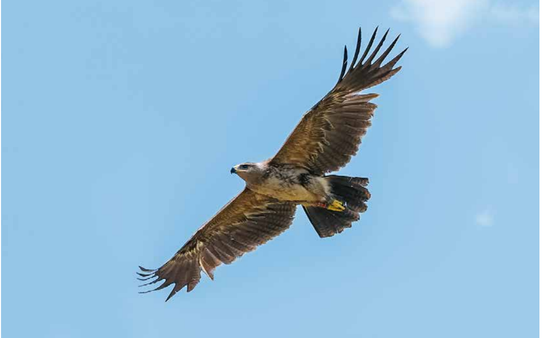
364 Hybrid Lesser Spotted x Greater Spotted Eagle / hybride Schreeuwarend x Bastaardarend Clanga pomarina x clanga, second calendar-year, Witkowo, Western Pomerania, Poland, 5 June 2019. Ringed as pul- lus at Kampinowska forest, Mazowsze, Poland, on 3 July 2018. 365 Cinereous Vulture / Monniksgier Aegypius monachus, second calendar-year, Hellendoorn, Overijssel, Netherlands, 25 May 2019 cf Dutch Birding 41: 198, 2019