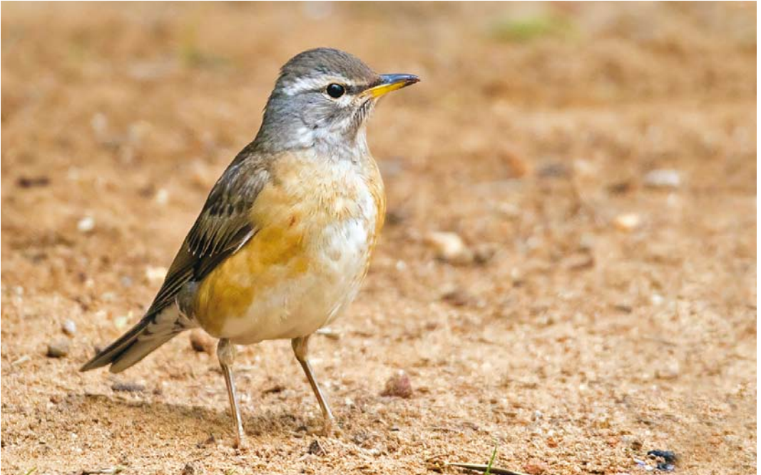
164 Eyebrowed Thrush / Vale Lijster Turdus obscurus , first-winter male, Cádiz, Andalusia, Spain, 24 February 2018