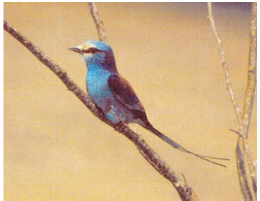
131 Abyssinian Roller / Sahelscharrelaar Coracias abyssinicus , Abu Simbel, Egypt, 29 September 1995 (Axel Halley) 132 Abyssinian Roller / Sahelscharrelaar Coracias abyssinicus , adult, Abu Simbel, Egypt, 4 May 1997 (Seppo Haavisto) 133 Abyssinian Roller / Sahelscharrelaar Coracias abyssinicus , adult, Baie de l'Etoile, Nouadhibou, Mauritania, 16 December 2007 (Guy Jarry) 134 Abyssinian Roller / Sahelscharrelaar Coracias abyssinicus , adult, Sidi Kaouki, Chiadma, Morocco, 29 March 2005 (Ulrich Berger)

Sidi Kaouki, near Essaouira, on 29 March 2005 (Bergier et al 2011; plate 134). It is the northernmost record ever.