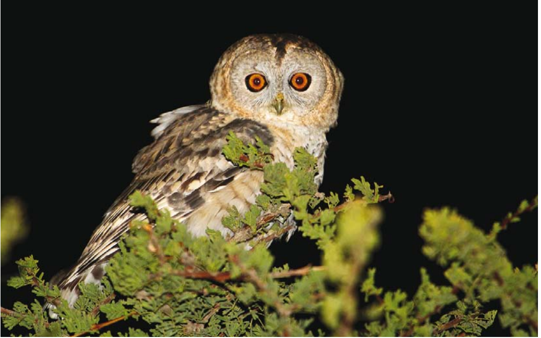
110 Desert Owl / Palestijnse Bosuil Strix hadorami , Wadi el Gemal, Egypt, 10 February 2017 (Mohamed I Habib). Roosting in acacia.

chick pellets only contain parts of voles and scorpions that often protrude through the surface. Adult pellets consist mainly of vole remains with some invertebrate and bird material (table 2).