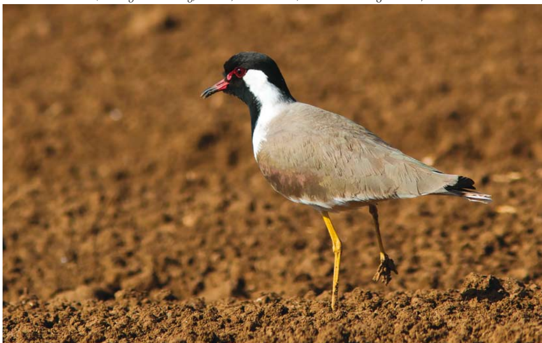
139 Red-wattled Lapwing / Indische Kievit Vanellus indicus , Kfar Blum, Hula valley, Israel, 15 November 2017 cf Dutch Birding 39: 398, 2017