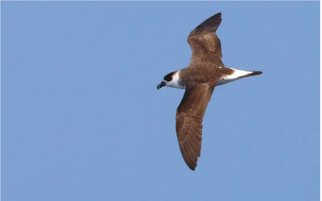
112 Black-capped Petrel / Zwartkapstormvogel Pterodroma hasitata , off Hatteras, USA, 21 May 2008 (Chris Sloan)