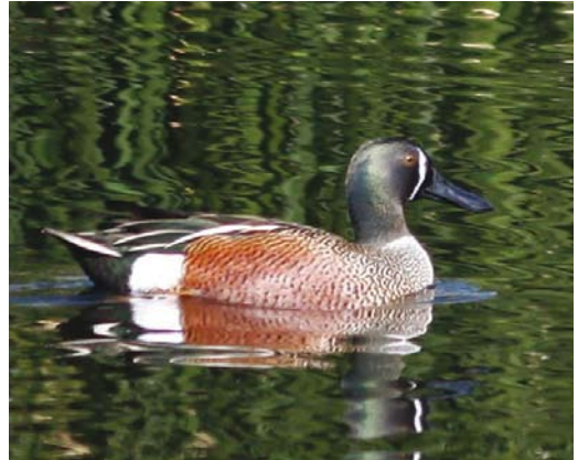
98 Hybrid Northern Shoveler x Blue-winged Teal / hybride Slobeend x Blauwvleugeltaling Anas clypeata x discors , male, Schwabhausen gravel pits, Gotha, Thüringen, Germany, 25 March 2014 (Mario Hofmann). Individual showing rather bold markings on breast and flank. Still, breast markings forming marbled pattern rather than scalloped pattern of Australasian Shoveler A. rhynchosotis . Note dark eye, cream-white ground colour to breast, fairly slender spatulate bill and well-defined white facial crescent. 99 Hybrid Northern Shoveler x Blue-winged Teal / hybride Slobeend x Blauwvleugeltaling Anas clypeata x discors , male, Sweetwater Wetlands, Tucson, Arizona, USA, 22 February 2012 (Andrew Core)

grey head with only very slight green iridescence in some light conditions. The facial crescent is pure white and thin but well defined and extends (almost) onto the chin. Northern Shoveler showing this crescent in the early stages of moult back to breeding plumage do often look more untidy with the crescent less clearly defined and also with some dark spotting. Also, the scaling on flank and breast appears more irregular than in Australasian. In late moult, very few Northern show a thin white crescent while already having a white breast and dark unmarked reddish flank. An important character to distinguish this species from the hybrids discussed above are the bold dark spots and scaling on the breast and at least the upper flank (cf Madge & Burn 1988). In most cases, the lower flank in Australasian is distinctly spotted. The white patch at the rear flank is generally similar to Northern but in some individuals a few dark markings occur in the white patch. Moreover, Australasian has a fairly straight transition between the culmen and forehead, giving a remarkably heavy-headed appearance. The legs are slightly more yellowish orange than in Northern, which has deeper orange legs. Scapulars and tertials are similar to those of Northern.