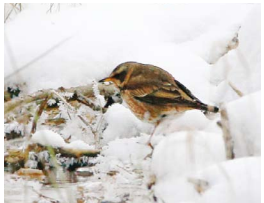
154 Long-toed Stint / Taigastrandloper Calidris subminuta , Eilat, Israel, 25 February 2018 ( Anton Libermann ) 155 Northern Harrier / Amerikaanse Blauwe Kiekendief Circus hudsonius , second-winter male, Murtoosa, Aveiro, Portugal, 5 February 2018 ( Carlos André ) 156 Mesopotamian Crow / Mesopotamische Kraai Corvus capellanus , adult, Sulaibiya, Kuwait, 17 February 2018 ( Mike Pope ) 157 Oriental White-eye / Indische Brilvogel Zosterops palpebrosa , adult, Mahawat Island, Filim, Al Wusta, Oman, 25 January 2018 ( Zbigniew Kajzer ) 158 Oriental Skylark / Kleine Veldleeuwerik Alauda gulgula , Milleyha, Hatay, Turkey, 11 March 2018 ( Ali Atahan ) 159 Naumann's Thrush / Naumanns Lijster Turdus naumanni , first-winter, Savka, Peipsiääre, Estonia, 15 February 2018 ( Andrus Salu )