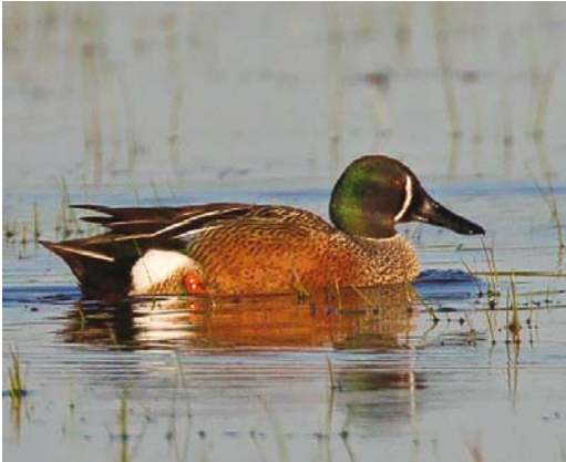
100 Hybrid Northern Shoveler x Blue-winged Teal / hybride Slobeend x Blauwvleugeltaling Anas clypeata x discors , male, Montezuma National Wildlife Refuge, New York, USA, 9 May 2011. Individual showing rather dense patterning on breast and thin, pale neck-ring. Note also orange leg.

January 2018), there are 39 records of this hybrid type (compared with 17 of Northern Shoveler x Cinnamon Teal and well over 300 of Cinnamon x Blue-winged Teal); many of these have been photographically documented. Five of the North American Northern Shoveler x Blue-winged Teal records are from August-November and 28 are from March-May.