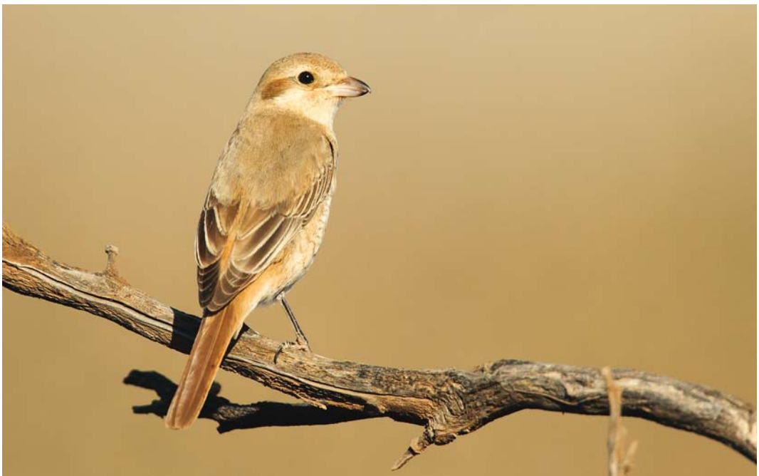
136 Daurian Shrike / Daurische Klauwier Lanius isabellinus , first-winter, Montaña de Taco, Buenavista del Norte, Tenerife, Canary Islands, 22 November 2017 (Benearo Rodríguez)

Based on the photographs, the Tenerife bird concerned a first-year Daurian Shrike (cf Kiat & Perlman 2016). The general appearance was nearly uniform pale sandy-brown, almost lacking contrast between the grey-brown mantle and buff-white underparts (colder grey-brown upperparts and whiter underparts in phoenicuroides ). The supercilium was not distinctive and uniformly buff-white (whiter and more contrasting in phoe-