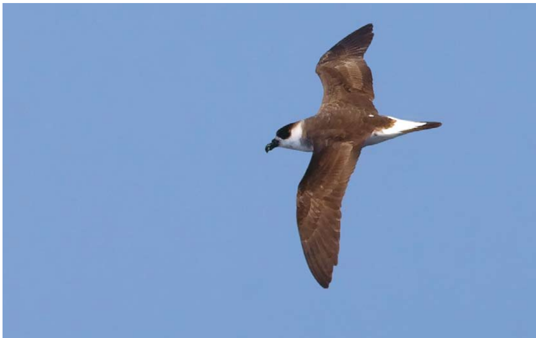
112 Black-capped Petrel / Zwartkapstormvogel Pterodroma hasitata , off Hatteras, USA, 21 May 2008