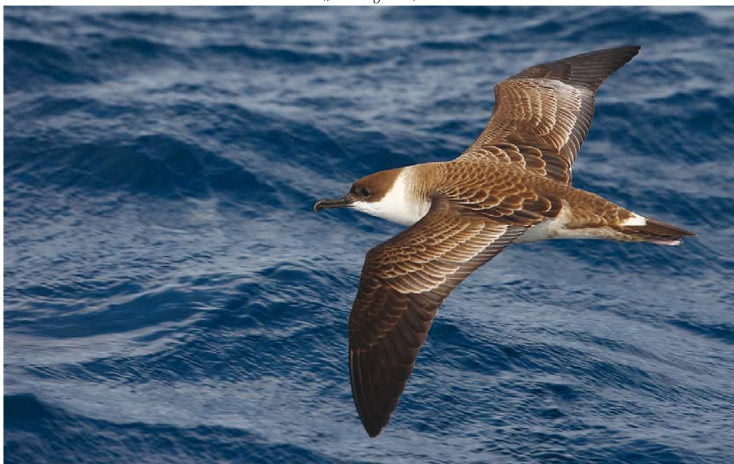
113 Great Shearwater / Grote Pijlstormvogel Puffinus gravis , Malpica, A Coruña, Spain, 29 August 2011