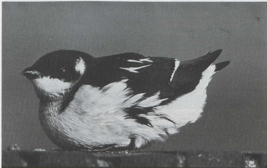
13. Little Auk/Kleine Alk Alle alle, IJmuiden (Noord-Holland), January 1981