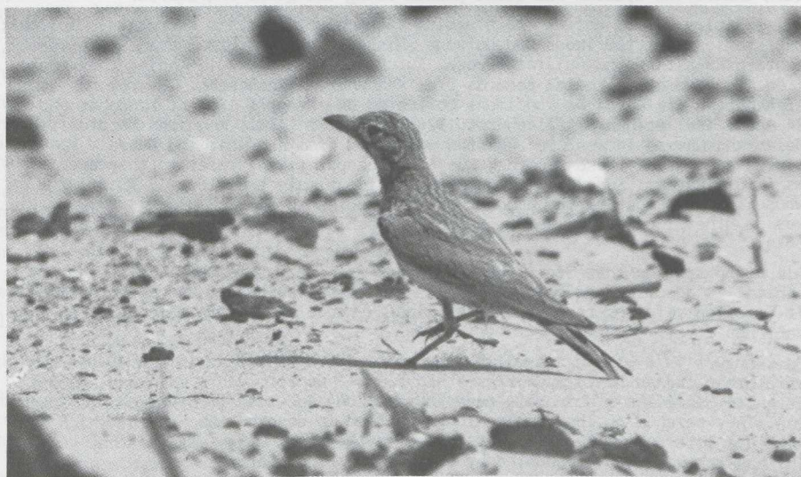
7. Dunn's Lark/Dunns Leeuwerik Eremalauda dunni, Ma'agan Micka'el (Israel), April 1980