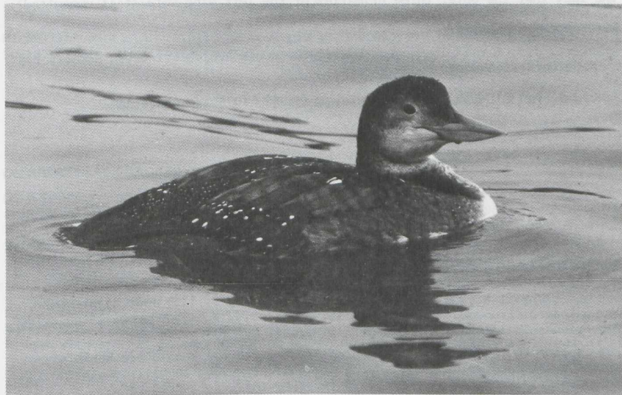
3. White-billed Diver/Geelsnavelduiker Gavia adamsii , adult, moulting into summer plumage, Hartlepool (Cleveland), England, February 1981 (Graham Catley)