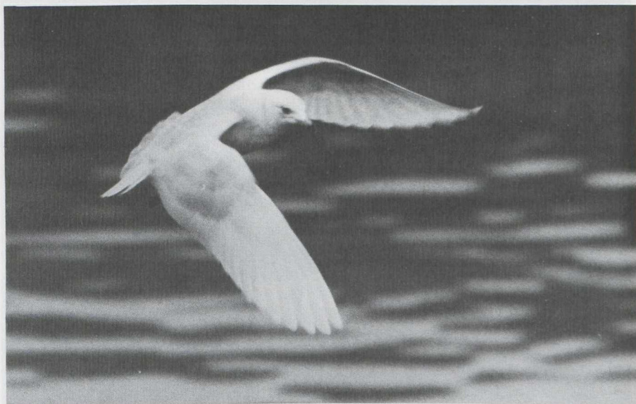
4. Iceland Gull/Kleine Burgemeester Larus glaucooides , second-winter bird, IJmuiden (Noord-Holland), February 1981

Size and build. Size about that of Herring Gull L. argentatus . Head not smaller than that of Herring Gull and with distinctly circular outline; forehead more steep than in Common Gull L. canus ; highest point of crown behind eye. Neck comparatively short and, especially lowerneck, relatively thick (both in flight and at rest). Wing, especially innerwing, comparatively broad and with rounded tip (p9 and p10 differed only slightly in length); projection of 'hanging' wings beyond tail (not further than in Herring Gull) when standing; secondaries little 'raised' (as in Herring Gull) when swimming and primaries almost horizontally and not crossed; angle between undertail and water more acute than in Herring Gull. Tail length corresponded almost to width of innerwing; innertail normally depressed when flying (giving spread tail wedge-shaped and sometimes even diamond-shaped appearance). Eye position approximately as in Herring Gull. Bill slender and length (measured along lower ridge of lower mandible) about two-fifth of that of head; proximal half of culmen straight and distal half evenly downcurved; gonys weakly developed; tip not pointed (as in Common Gull) and not hooked (as in Glaucous Gull L. hyperboreus ). Leg, both tibia (proximally feathered) and tarsus, comparatively short and thin.