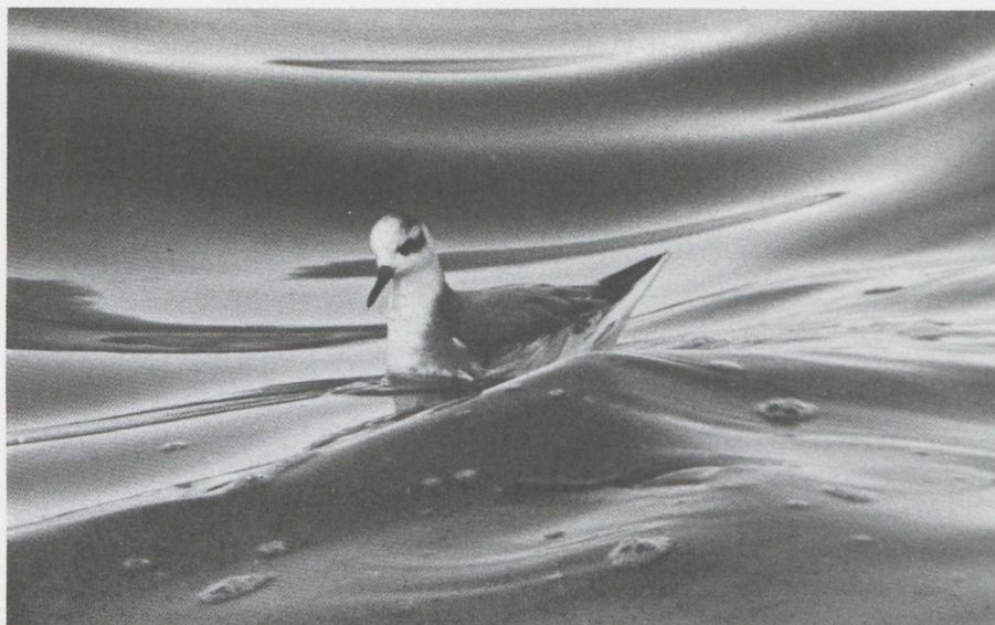
11-12. Grey Phalarope/Rosse Franjepoot Phalaropus fulicarius , IJmuiden (Noord-Holland), January 1981 ( Jan Mulder ); Iceland Gull/Kleine Burgemeester Larus glaucoides , second-winter bird, IJmuiden, January 1981 ( Hans Schouten )