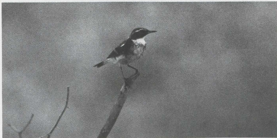
8. Stoliczka's Whinchat/Stoliczka's Paapje Saxicola macrorhyncha , adult male, Rajasthan, India, August 1978

Description of male. Fairly large slim Saxicola chat with long bill and tail. Crown, nape and back dark brown with lighter feather edges; side of head and ear-coverts blackish-brown, sharply demarcated from white chin; supercilium white, narrow and long (from base of bill to end of ear-coverts). Chin, throat and upperbreast strikingly white, rest of underparts light with greyish cast on lowerbreast, belly and flank. Wing-coverts and remiges blackish-brown with well-defined shoulder patch and light primary coverts. Tail white with dark central rectrices, pattern not unlike that of wheatear Oenanthe . Bill conspicuously long and black; legs black.