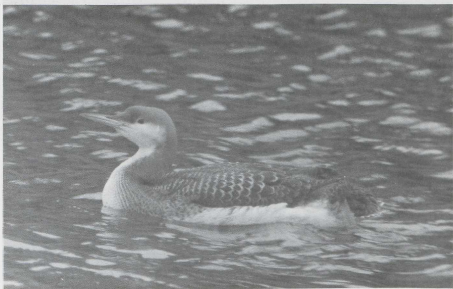
9-10. Black-throated Diver/Parelduiker Gavia arctica , first-winter, Medemblik (Noord-Holland), January 1981 (René Pop); Golden Eagle/Steenarend Aquila chrysaetos , Zuidelijk Flevoland (Zuidelijke IJsselmeerpolders), March 1981 (René Pop)