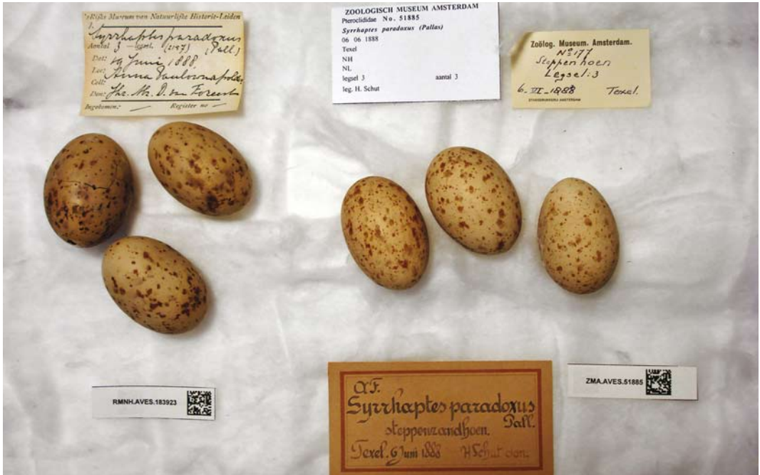
107 Legsels van Steppehoer / Pallas's Sandgrouse Syrrhaptes paradoxus (verzameld op Texel, Noord-Holland, op 6 juni 1888 (rechts) en te Anna-Paulownapolder, Noord-Holland, op 19 juni 1888), Naturalis Biodiversity Center, Leiden, Zuid-Holland, 13 november 2013