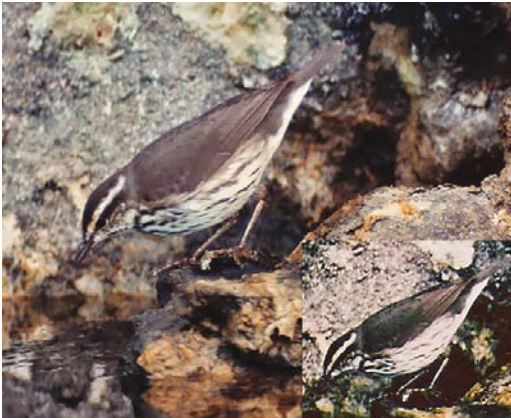
FIGURE 1 Northern Waterthrush / Noordse Waterlijster Parkesia noveboracensis , Tazacorte, La Palma, Santa Cruz de Tenerife, Canary Islands, November 1991 ( Martin Semisch ). Note how new scan (main image) reveals finer eyebrow, better-defined streaking on underparts and dirtier legs compared with old scan (inset). FIGURE 2 Northern Waterthrush / Noordse Waterlijster Parkesia noveboracensis , Tazacorte, La Palma, Santa Cruz de Tenerife, Canary Islands, November 1991 ( Martin Semisch ). Compared with completely clean throat in old scan (right), streaks are more obvious in new scan (left), as well as on breast and underparts. 143 Northern Waterthrush / Noordse Waterlijster Parkesia noveboracensis , Tazacorte, La Palma, Santa Cruz de Tenerife, Canary Islands, November 1991 ( Martin Semisch ). Note rounded head and short thin bill, diagnostic of Northern Waterthrush. 144 Northern Waterthrush / Noordse Waterlijster Parkesia noveboracensis , Tazacorte, La Palma, Santa Cruz de Tenerife, Canary Islands, November 1991 ( Martin Semisch ). This new scan shows how sharp streaking on underparts is, extending towards throat as well.

This is without doubt one of the most misleading features in the old scans, where the supercilium looked more like that of motacilla : very long, broadening from behind the eye towards a square-shaped abrupt end at the nape. The recent examination of the new scans revealed a finer super-