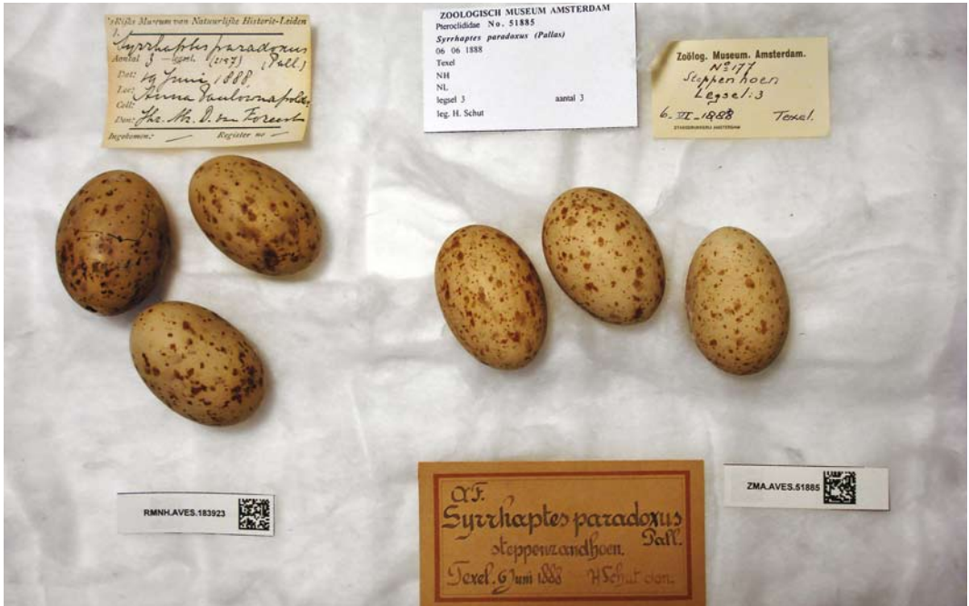
107 Legsels van Steppenhoer / Pallas's Sandgrouse Syrrhaptes paradoxus (verzameld op Texel, Noord-Holland, op 6 juni 1888 (rechts) en te Anna-Paulownapolder, Noord-Holland, op 19 juni 1888), Naturalis Biodiversity Center, Leiden, Zuid-Holland, 13 november 2013