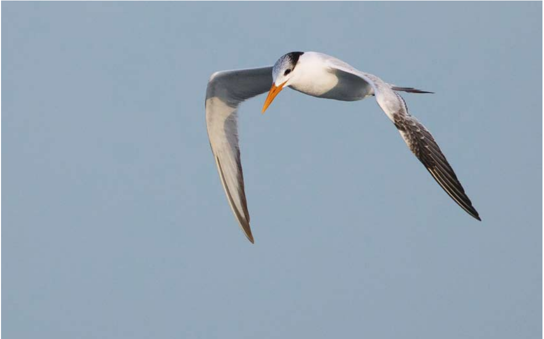
172 American Royal Tern / Amerikaanse Koningsstern Sterna maxima maxima , first-winter, Miellette, Guernsey, Channel Islands, 5 February 2017