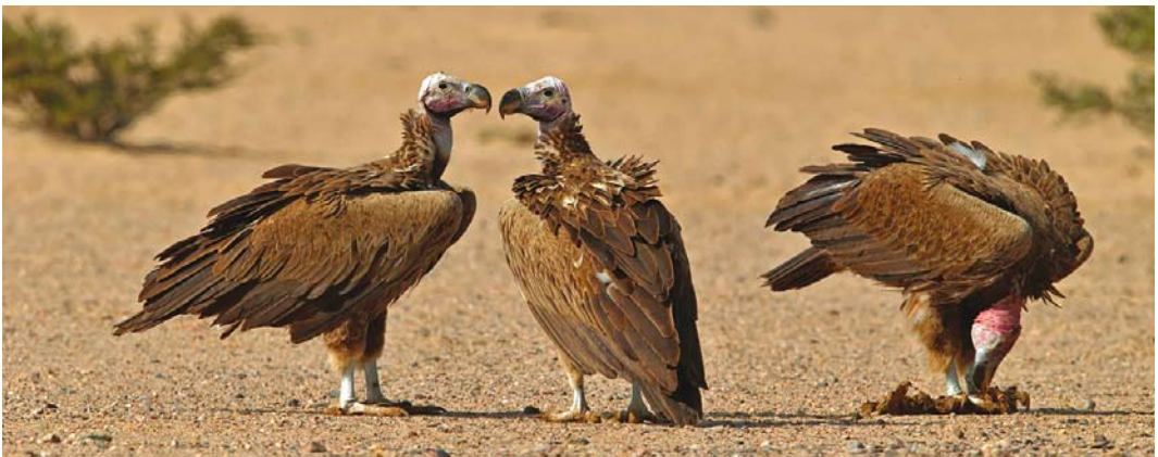
181 Brown-necked Raven / Bruinnekraaf Corvus ruficollis , Pantelleria, Italy, 2 March 2017 182 Brown-necked Raven / Bruinnekraaf Corvus ruficollis , Teguiše, Lanzarote, Canary Islands, 5 February 2017 183 Lappet-faced Vultures / Oorgieren Torgos tracheliotos , Bir Shalatayn, Egypt, 14 February 2017

Hungary, a total of 1555 individuals was estimated to be present at nine sites situated in six national parks (Aquila 121: 37-63, 2014). In Central Asia, remnant populations were small and isolated in the beginning of the 21st century, the species being rare or almost extinct in former Soviet republics and provinces in Russia, except for Saratov (but 'population requires continued monitoring' here after a decline from 3000 to 900 individuals in 1998-2013) and perhaps Samara ('rare') (Aquila 121: 107-132, 2014).