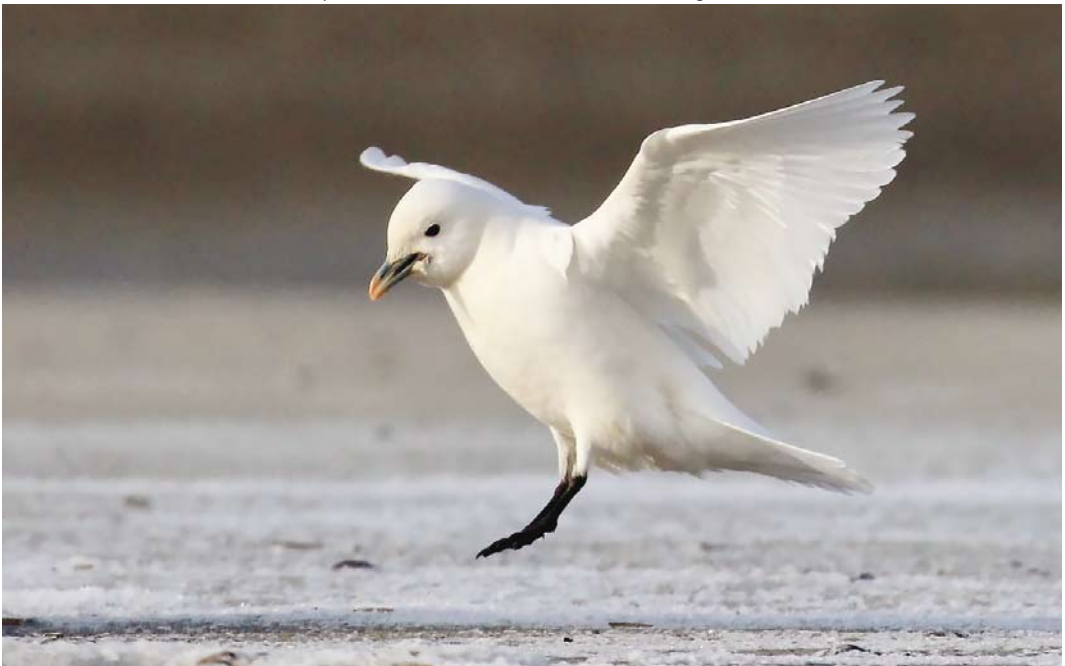
173 Ivory Gull / Ivoormeeuw Pagophila eburnea , adult, Sankt Peter-Ording, Schleswig-Holstein, Germany, 17 January 2017 cf Dutch Birding 39: 50, 2017