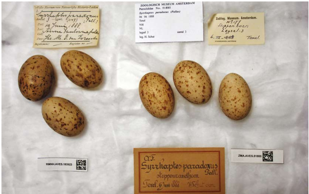
107 Legsels van Steppehoer / Pallas's Sandgrouse Syrnhaptes paradoxus (verzameld op Texel, Noord-Holland, op 6 juni 1888 (rechts) en te Anna-Paulownapolder, Noord-Holland, op 19 juni 1888), Naturalis Biodiversity Center, Leiden, Zuid-Holland, 13 november 2013