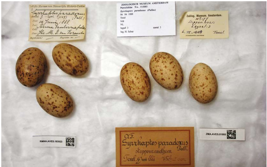
107 Legsels van Steppenhoen / Pallas's Sandgrouse Syrrhaptes paradoxus (verzameld op Texel, Noord-Holland, op 6 juni 1888 (rechts) en te Anna-Paulownapolder, Noord-Holland, op 19 juni 1888), Naturalis Biodiversity Center, Leiden, Zuid-Holland, 13 november 2013