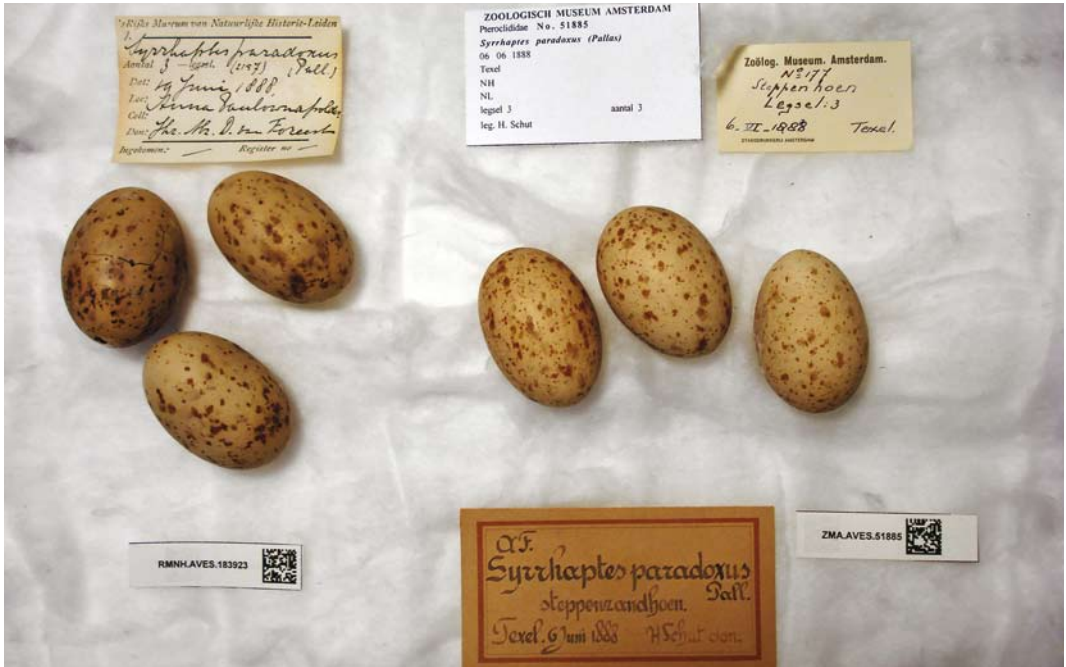
107 Legsels van Steppenhoen / Pallas's Sandgrouse Syrrhaptes paradoxus (verzameld op Texel, Noord-Holland, op 6 juni 1888 (rechts) en te Anna-Paulownapolder, Noord-Holland, op 19 juni 1888), Naturalis Biodiversity Center, Leiden, Zuid-Holland, 13 november 2013