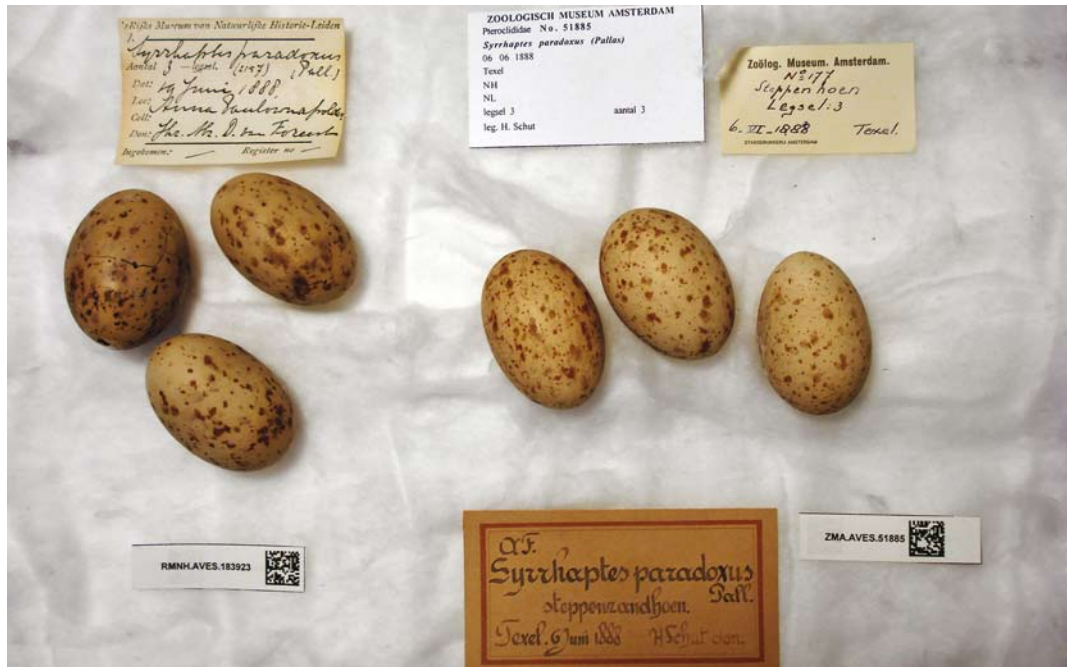
107 Legsels van Steppenhoer / Pallas's Sandgrouse Syrnhaptes paradoxus (verzameld op Texel, Noord-Holland, op 6 juni 1888 (rechts) en te Anna-Paulownapolder, Noord-Holland, op 19 juni 1888), Naturalis Biodiversity Center, Leiden, Zuid-Holland, 13 november 2013