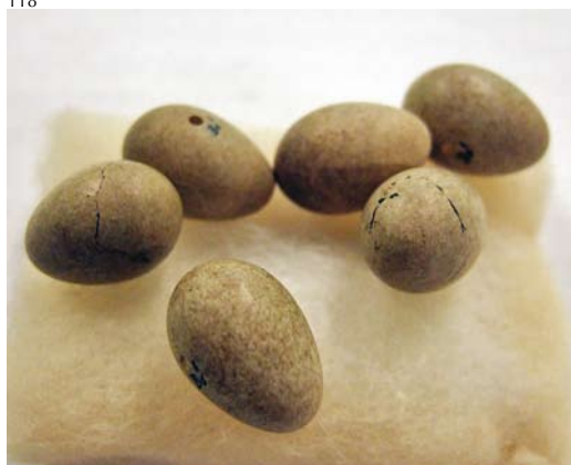
Friesland, zes eieren (T G de Vries; plaat 118). CDNA-beoordeelsort tot 1992.

Graszanger / Zitting Cisticola Cisticola juncidis 1976 3 oktober, Dijkgat, Wieringermeer, Hollands Kroon , Noord-Holland, twee eieren die achterbleven nadat de drie jongen waren uitgevlogen; nest verzameld (L Zijlstra).