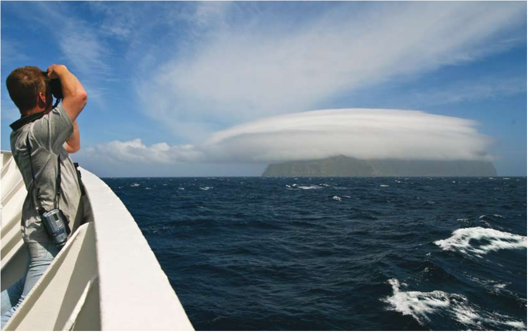
163 Inaccessible Island, South Atlantic Ocean, 27 March 2006