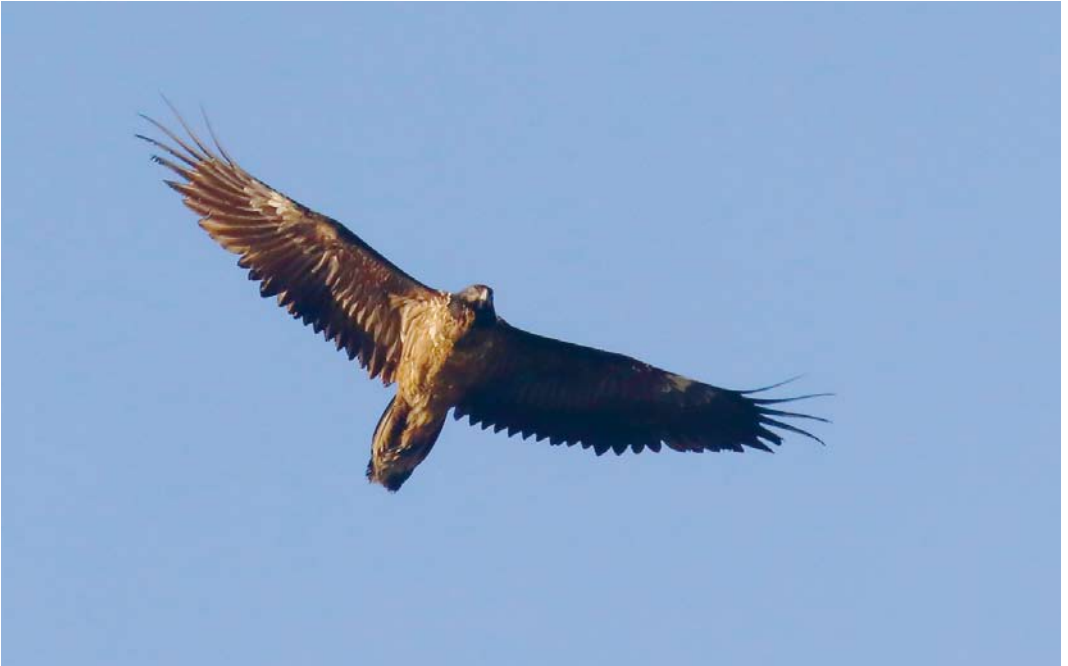
176 Bearded Vulture / Lammergeier Gypaetus barbatus , second calendar-year, Delft, Zuid-Holland, Netherlands, 12 March 2017 ( Wietze Janse )