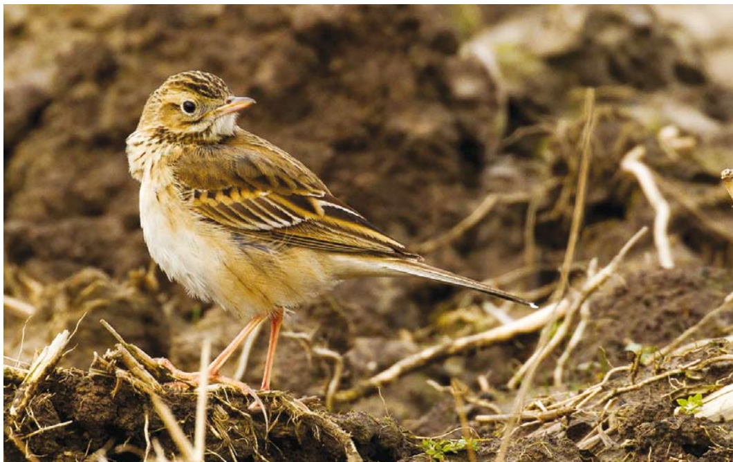
213 Grote Pieper / Richard's Pipt Anthus richardi , eerste-winter, Grijskerke, Zeeland, 31 januari 2017 (Marcel Klootwijk)