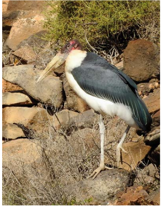
184 Long-billed Dowitcher / Grote Grijsze Snip Limnodromus scolopaceus , Narimanabad, Kizil Agach, Azerbaijan, 31 January 2017 185 Marabou Stork / Afrikaanse Maraboe Leptoptilos crumenifer , Puerto del Rosario, Fuerteventura, Canary Islands, 24 January 2017 cf Dutch Birding 39: 44, 2017 186 Sora / Sorral Porzana carolina , Silves, Algarve, Portugal, 26 January 2017