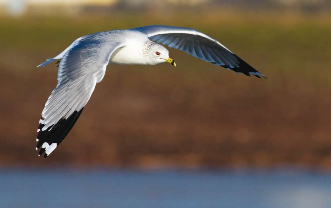
210 Vermoedelijke Ringsnavelmeeuw / presumed Ring-billed Gull Larus delawarensis , adult, Wijchen, Gelderland, 26 januari 2017 211 Bruine Klauwier / Brown Shrike Lanius cristatus , eerste-winter, Den Helder, Noord-Holland, 24 februari 2017 212 Taigaboomkruiper / Eurasian Treecreeper Certhia familiaris , Noordwijk, Zuid-Holland, 12 februari 2017