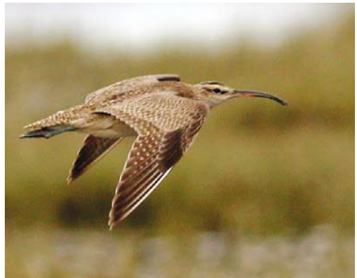
191 Allen's Gallinule / Afrikaans Purperhoen Porphyrio alleni , Barragem de Poilão, Santiago, Cape Verde Islands, 13 February 2017 ( Mads Elley ) 192 Sooty Tern / Bonte Stern Onychoprion fuscatus , adult, off Raso, Cape Verde Islands, 8 March 2017 ( Ernst Albegger ) 193 Stilt Sandpiper / Steltstrandloper Calidris himantopus , Riu Tuareg lagoon, Boavista, Cape Verde Islands, 4 March 2017 ( Ernst Albegger ) 194 Hudsonian Whimbrel / Amerikaanse Regenwulp Numenius hudsonicus , Santoña, Cantabria, Spain, 29 January 2017 ( Haritz Sarasa )

from 29 January to 8 March. The one on Papa Westray and Eday, Orkney, Scotland, stayed until at least 11 February.