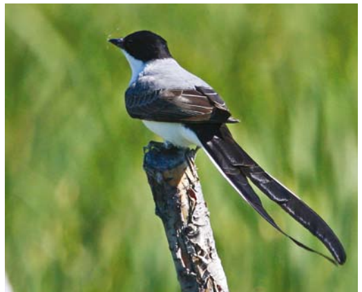
139 Fork-tailed Flycatcher /Vorkstaartkoningstiran Tyrannus savana , Chubut province, Argentina, 18 November 2008 (César Sánchez). Although contrast between mantle and wing in this individual does not appear to be as strong as that in plate 140, note that mantle is clearly ashy-grey, not 'black or very dark grey' as described and drawn by observer (cf figure 1). 140 Fork-tailed Flycatcher /Vorkstaartkoningstiran Tyrannus savana , Misiones province, Argentina, 18 November 2008 (Miguel Rouco). Note contrast between grey mantle and black wing. 141 Fork-tailed Flycatcher /Vorkstaartkoningstiran Tyrannus savana , Chubut province, Argentina, 13 November 2008 (Miguel Rouco). Note contrast between grey mantle and black wing, with grey mantle directly bordering black cap.

these conditions, the observer did not perceive some of the typical plumage features of the species. In fact, the described features could even be considered as incompatible with it. One of these features was the colour of the wing and back, described as 'black', later specified as 'black or very dark grey' (cf figure 1). Although Fork-tailed Flycatcher could be described as having dark grey upperparts under very poor light conditions or at great distance, the ash-grey colour of the mantle and scapulars, contrasting with the dull black or dark brown wing-feathers and wing-coverts, should have been clearly perceptible in the prevailing conditions. Even in the nominate subspecies T s savana , being the darkest