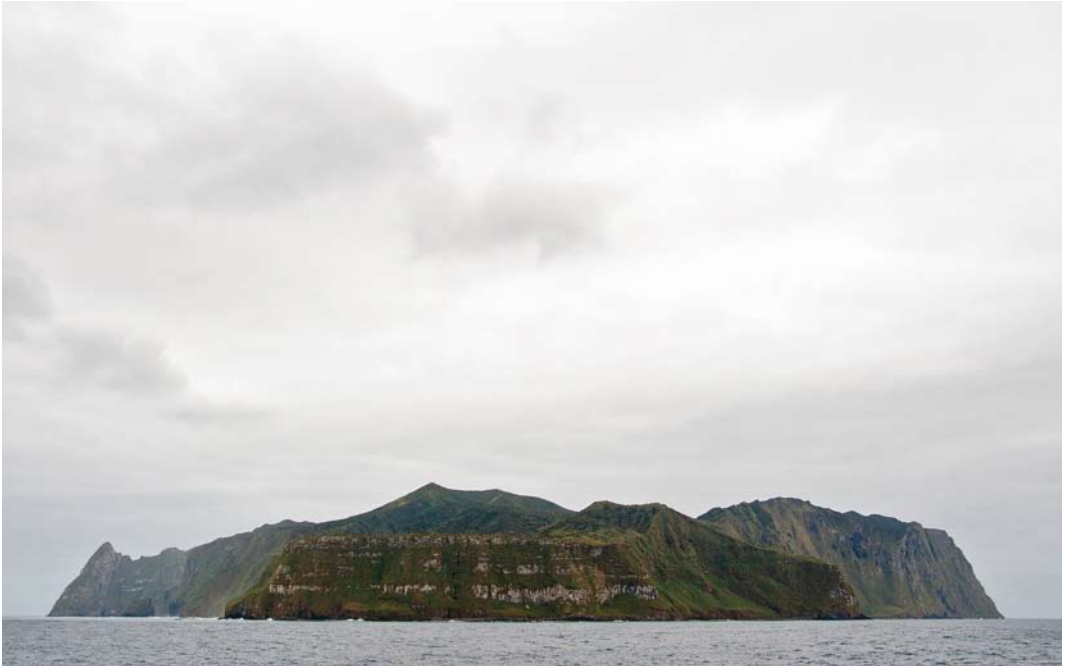
165 Inaccessible Island, South Atlantic Ocean, 13 April 2011 ( Garry Bakker )