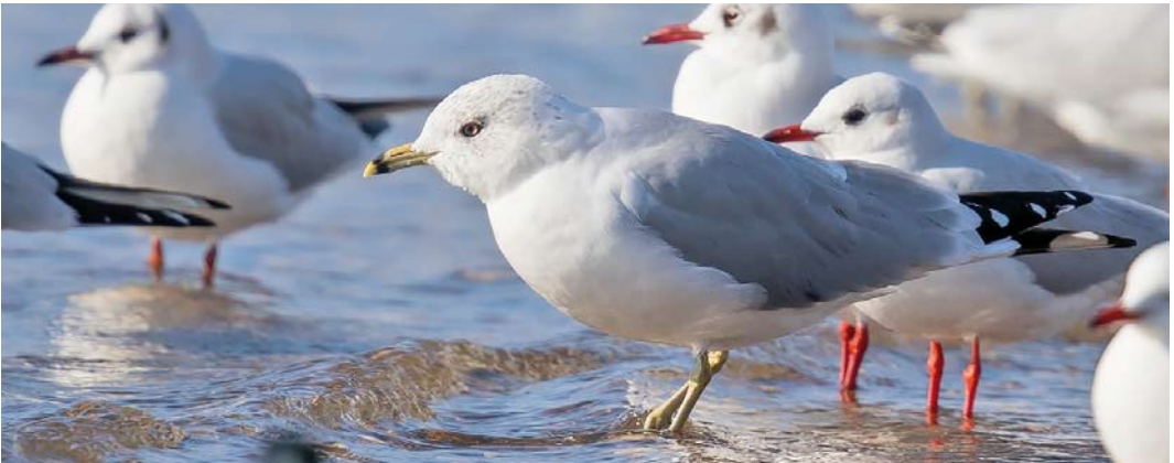
178 Black Heron / Zwarte Reiger Egretta ardesiaca , Tarrafal, São Nicolau, Cape Verde Islands, 10 March 2017 ( Daniel López-Velasco ) 179 Snow Goose / Sneeuwgans Anser caerulescens , Sete Cidades, São Miguel, Azores, 20 December 2016 ( Gerbrand Michielsen ) cf Dutch Birding 39: 43, 2017 180 Ring-billed Gull / Ringsnavelmeeuw Larus delawarensis , adult, with Black-headed Gulls / Kokmeeuwen Chroicocephalus ridibundus , Hitdorf, Nordrhein-Westfalen, Germany, 13 February 2017 ( Norbert Uhlhaas )

(the species' typical weight is 55-70 g); it concerned the first record of this genus in the Southern Hemisphere outside South America (Bull Br Ornithol Club 136: 214-215, 2016).