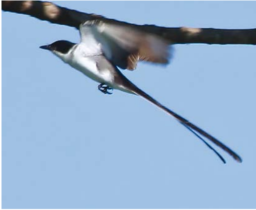
142 Fork-tailed Flycatcher / Vorkstaartkoningstiran Tyrannus savana , Misiones province, Argentina, 18 November 2008 (Miguel Rouco). Note position in flight, with tail in same plane as body, not permanently dropped down as described by observer.