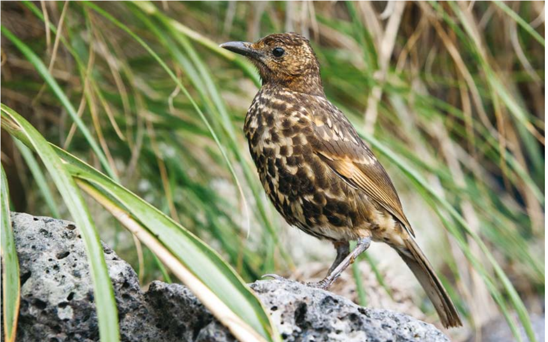
170 Tristan Thrush / Tristanlijster Turdus eremita gordoni , Inaccessible Island, South Atlantic Ocean, 13 April 2011 (Garry Bakker)