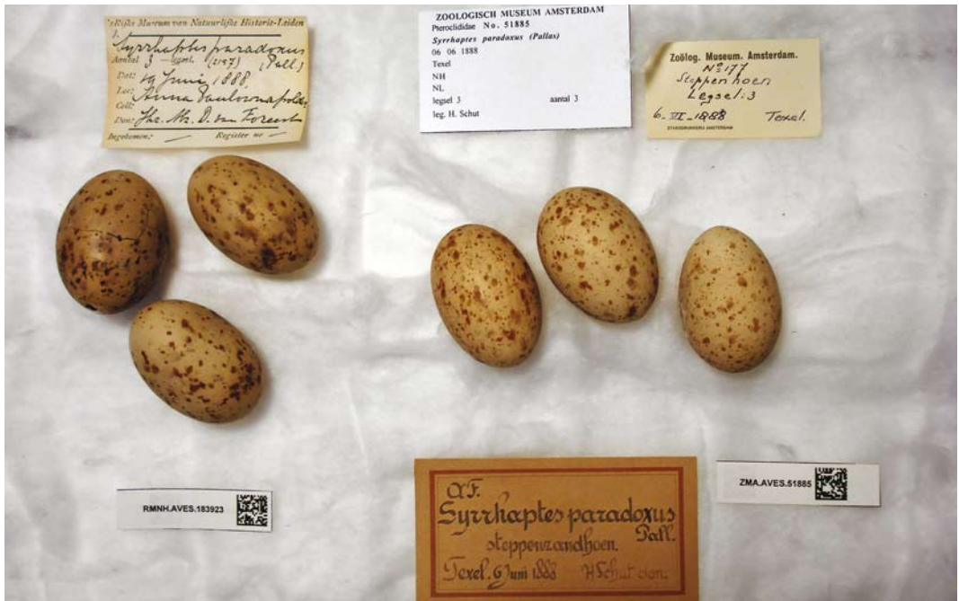
107 Legsels van Steppehoer / Pallas's Sandgrouse Syrrhaptes paradoxus (verzameld op Texel, Noord-Holland, op 6 juni 1888 (rechts) en te Anna-Paulownapolder, Noord-Holland, op 19 juni 1888), Naturalis Biodiversity Center, Leiden, Zuid-Holland, 13 november 2013