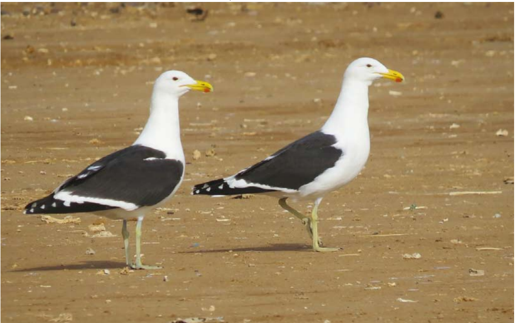
175 Cape Gulls / Afrikaanse Kelpmeeuwen Larus dominicanus vetula , adult, Akhfennir, Western Sahara, Morocco, 25 February 2017 (Robert Swann)