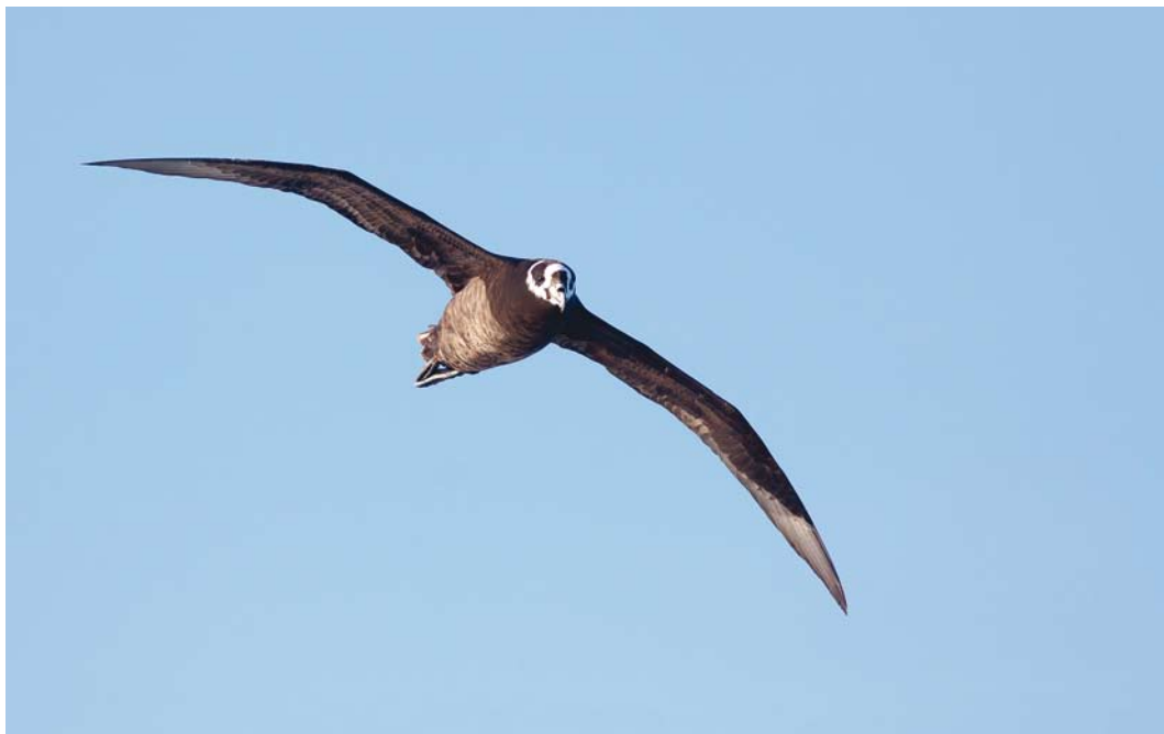
169 Spectacled Petrel / Brilstormvogel Procellaria conspicillata , off Tristan da Cunha, South Atlantic Ocean, 12 April 2011

and tail are poorly developed, preventing it to migrate. The legs and bill are dark grey, the eyes are red in adult birds and placed a bit to the front of the head adding to an 'evil' facial expression. Juveniles show a brown iris combined with a brown crown and brown upperparts. Sexes are alike, although males tend to be slightly larger, heavier, longer winged and longer billed than females (Ryan et al 1989, Fraser et al 1992) and there are minor differences in colour of the cheek and ear-coverts as well (Fraser et al 1992).