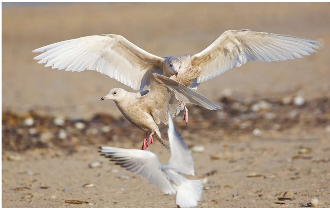
206 Grote Burgemeester / Glaucous Gull Larus hyperboreus , eerste-winter (boven), en Kleine Burgemeester / Iceland Gull L. glaucooides , eerste-winter (midden), met Kokmeeuw / Black-headed Gull Chroicocephalus ridibundus , Kijkduin, Den Haag, Zuid-Holland, 22 januari 2017 207 Grote Burgemeester / Glaucous Gull Larus hyperboreus , adult, met Buizerd / Common Buzzard Buteo buteo , Paezemerlannen, Lauwersmeer, Friesland, 17 januari 2017