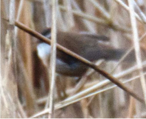
222 Zwartkoprietzanger / Moustached Warbler Acrocephalus melanopogon , Brabantse Biesbosch, Noord-Brabant, 21 maart 2017 (Ad van Benten)