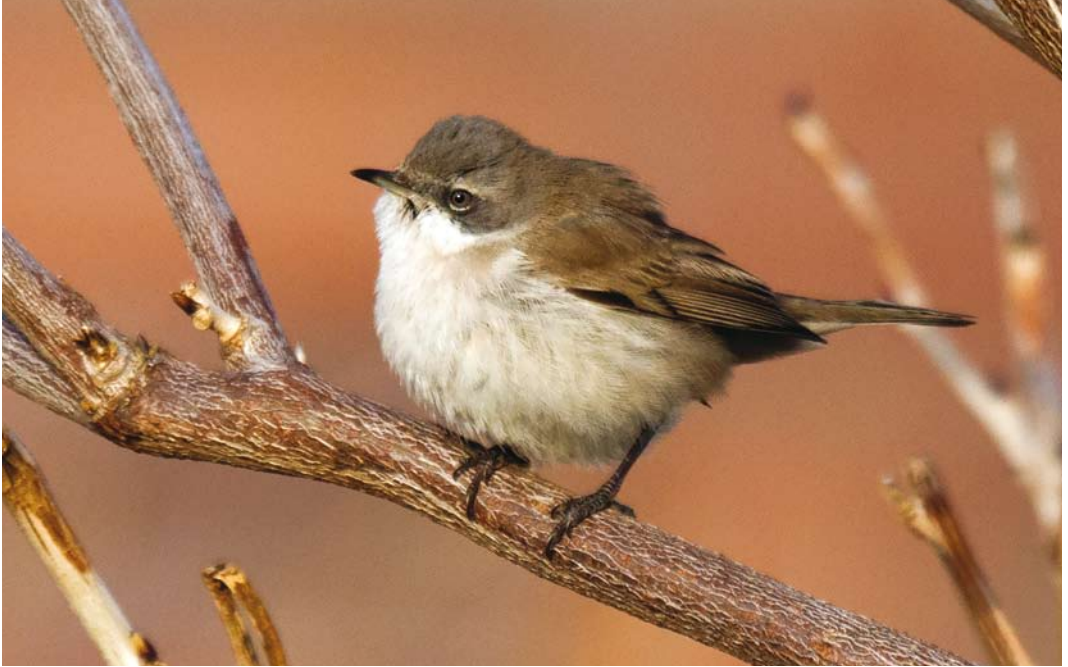
215 Vermoedelijke Siberische Braamsluiper / presumed Siberian Lesser Whitethroat Sylvia althaea blythi , Breda, Noord-Brabant, 20 januari 2017 (Arnaud B van den Berg)