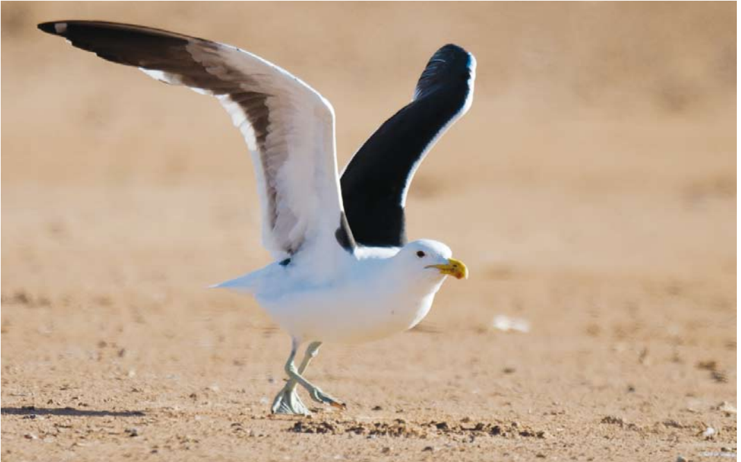
174 Cape Gull / Afrikaanse Kelpmeeuw Larus dominicanus vetula , adult, Akhfennir, Western Sahara, Morocco, 17 March 2017