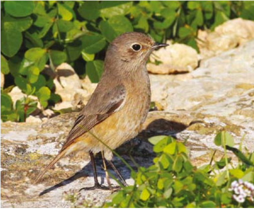
204 Moussier's Redstart / Diadeemroodstaart Phoenicurus moussieri , female, Sanap, Gozo, Malta, 2 January 2017

the Blyth's Pipit Anthus godlewskii at Brabantse Biesbosch, Noord-Brabant, from 8 January remained into late March. At Cape Kormakitis, the third for Cyprus was seen on 20 January. Others stayed at Cuxhaven, Niedersachsen, Germany, from 28 January to 18 February, and at Caneten-Roussillon, Pyrénées-Orientales, France, on 13-16 February. An Olive-backed Pipit A hodgsoni wintered at Ta' Qali, Malta, from 13 December 2016 into February. In the Azores, an American Buff-bellied Pipit A rubescens rubescens was seen on Terceira on 27 February.