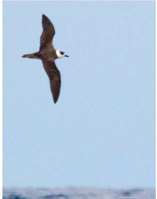
155-156 Vanuatu Petrel / Vanuatustormvogel Pterodroma occulta , at sea between Vanua Lava and Ureparapara, Banks Islands, Vanuatu, 26 April 2014 ( Pierre M A van der Wielen ) 157 Vanuatu Petrels / Vanuatustormvogels Pterodroma occulta , at sea between Vanua Lava and Ureparapara, Banks Islands, Vanuatu, 26 April 2014 ( Pierre M A van der Wielen )