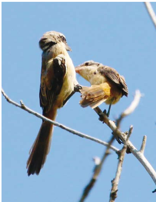
147 Long-tailed Shrikes / Langstaartklauwieren Lanius schach erythronotus , adult with juvenile, Victory Park, Atyrau, Kazakhstan, 6 August 2016