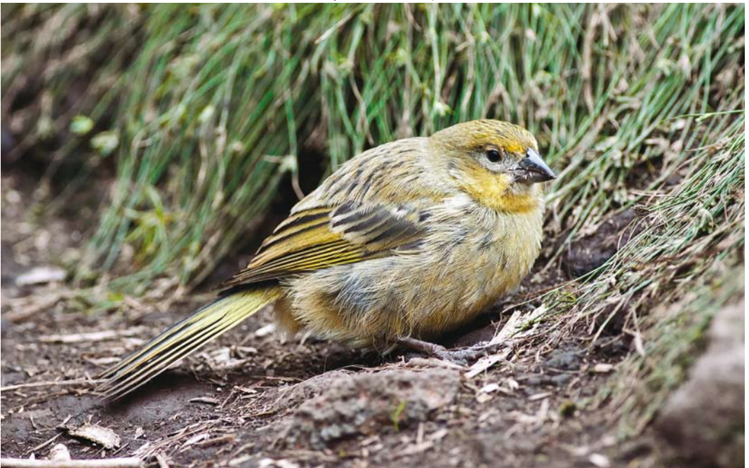
171 Inaccessible Island Finch / Inaccessiblegors Nesospiza acunhae dunnei , Inaccessible Island, South Atlantic Ocean, 13 April 2011