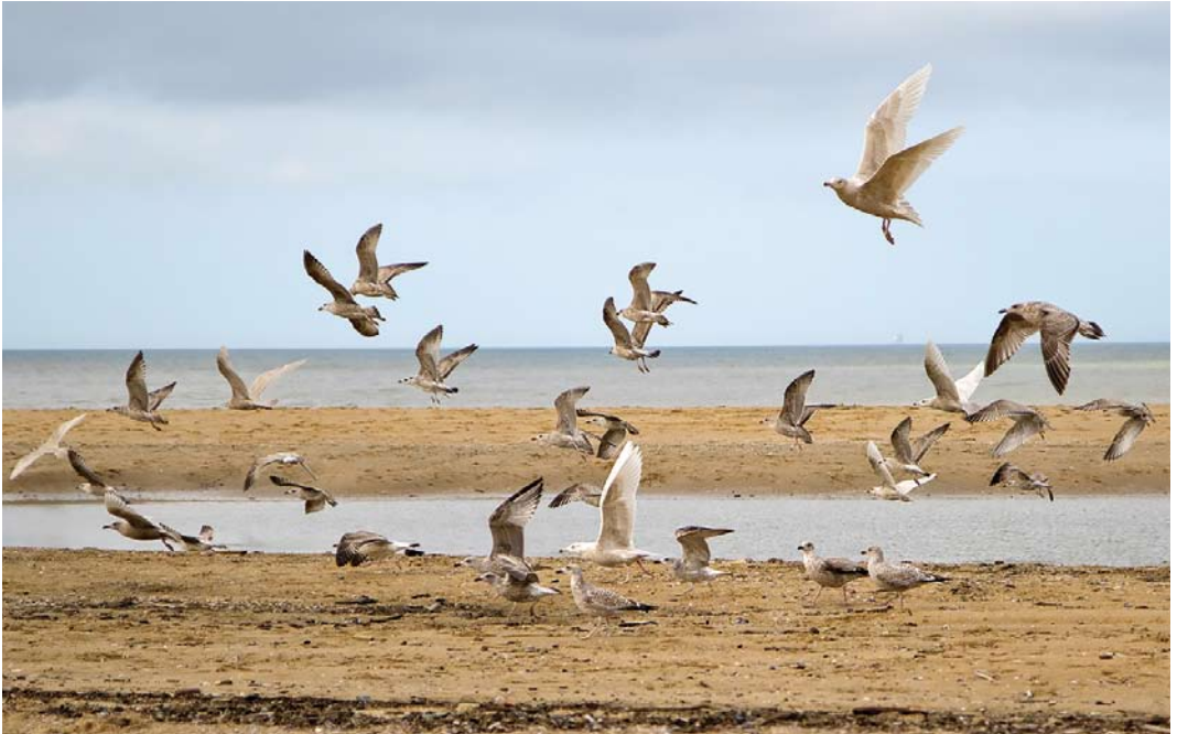
208 Grote Burgemeesters / Glaucous Gulls Larus hyperboreus , eerste-winter, en Kleine Burgemeesters / Iceland Gulls L. glaucoides , eerste-winter, met Zilvermeeuwen / European Herring Gulls L. argentatus , Meijendel, Wassenaar, Zuid-Holland, 3 februari 2017 209 Grote Burgemeesters / Glaucous Gulls Larus hyperboreus , eerste-winter, en Kleine Burgemeesters / Iceland Gulls L. glaucoides , eerste-winter, met Zilvermeeuwen / European Herring Gulls L. argentatus , Noorderstrand, Scheveningen, Zuid-Holland, 3 februari 2017