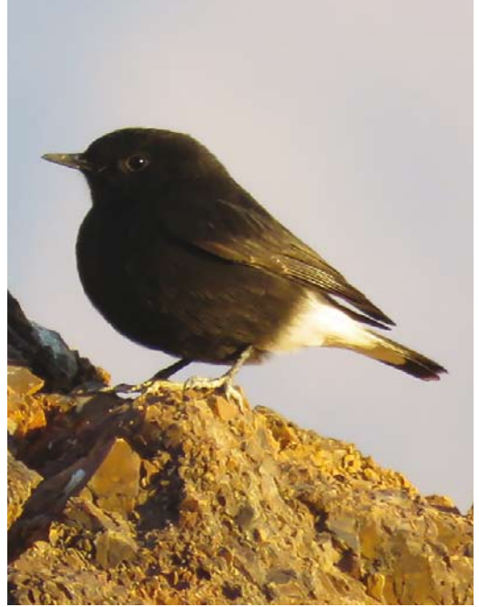
199 Olive-backed Pipit / Siberische Boompieper Anthus hodgsoni , Ta' Qali, Malta, 31 January 2017 ( Natalino Fenech ) 200 Basalt Wheatear / Basalttapuit Oenanthe lugens warriae , Beer-Ora, Israel, 17 January 2017 ( Itai Shanni ) 201 Pale-legged Leaf Warbler / Oessoerifitis Phylloscopus tenellipes , St Agnes, Scilly, England, 21 October 2016 ( Laurence Pitcher )