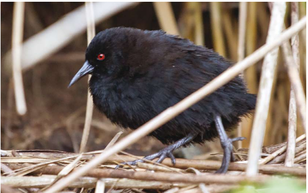
166 Inaccessible Island Rail / Inaccessibleral Atlantisia rogersi , Inaccessible Island, South Atlantic Ocean, 13 April 2011