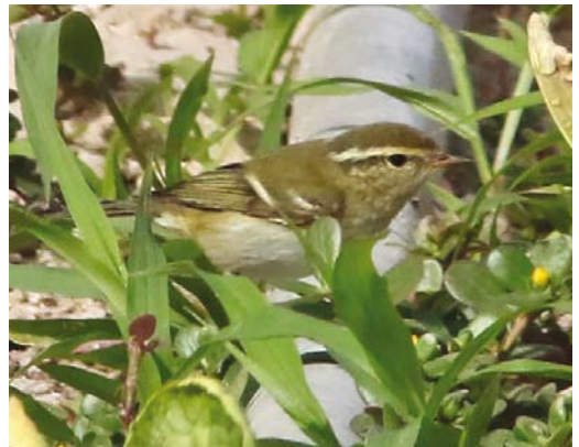
149 Olive-backed Pipits / Siberische Boompiepers Anthus hodgsoni , Zraïib El Jadida, Nouadhibou, Mauritania, 13 November 2016 (Rob S A van Bemmelen) 150 Yellow-browed Warbler / Bladkoning Phylloscopus inornatus , Zraïib El Jadida, Nouadhibou, Mauritania, 13 November 2016 (Rob S A van Bemmelen) 151 Yellow-browed Warbler / Bladkoning Phylloscopus inornatus , Cansado, Mauritania, 13 November 2016 (Rob S A van Bemmelen)

in Morocco, nine of which since 2005 (Fareh et al 2016). At least four records come from Algeria, all in years (1985 and 2016) with numerous records in Europe (Isenmann & Moali 2000, Ławicki & van den Berg 2016). There is also one record in Libya and several in Egypt (Goodman & Meininger 1989, Isenmann et al 2016). South of Mauritania, we could trace only two published records of Yellow-browed Warbler: singles in The Gambia (Barlow 2007) and Senegal (Cruse 2004) but none of Olive-backed Pipit. In recent years, both species have also been recorded in the Canary Islands, and Yellow-browed Warbler is likely a regular winterer there – in small but increasing numbers (de Juana 2008, García-del-Rey & García Vargas 2013). Taking as references Isenmann et al (2010), online bird sighting databases (www.observado.org and www.e-bird.org), as well as the species