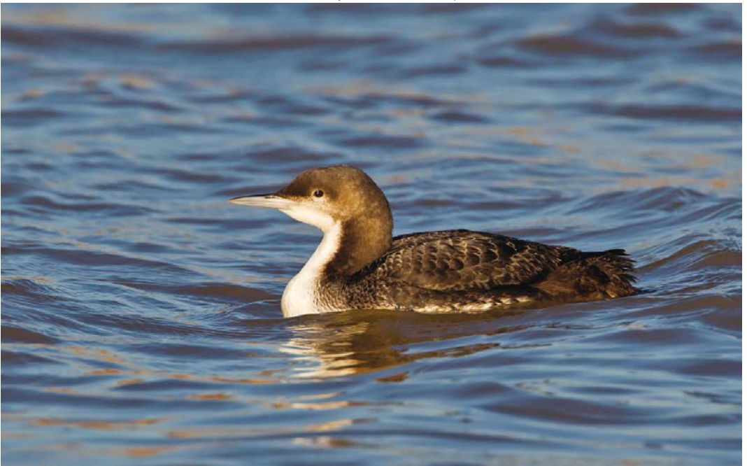
177 Pacific Loon / Pacifische Parelduiker Gavia pacifica , first-winter, Druridge Bay, Northumberland, England, 23 January 2017 ( Alan Curry )