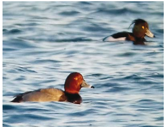
187 Blue-winged Teal / Blauwvleugeltaling Anas discors , male, with Gadwalls / Krakeenden A strepera and Eurasian Coot / Meerkoet Fulica atra , Boisdorfer See, Kerpen, Nordrhein-Westfalen, Germany, 14 February 2017 188 Baikal Teal / Siberische Taling Anas formosa , male (right), with Eurasian Wigeon / Smient A penelope , Noordwijk, Zuid-Holland, Netherlands, 14 februari 2017 189 Pale-bellied Brent Goose / Witbuikrotgans Branta hrota , adult, Tenerife, Canary Islands, 3 March 2017 190 Redhead / Amerikaanse Tafeleend Aythya americana , male, with Tufted Duck A fuligula , male, Plobsheim, Bas-Rhin, France, 26 February 2017

ties are poorly correlated in these taxa ( http://tinyurl.com/hg8rxet ).