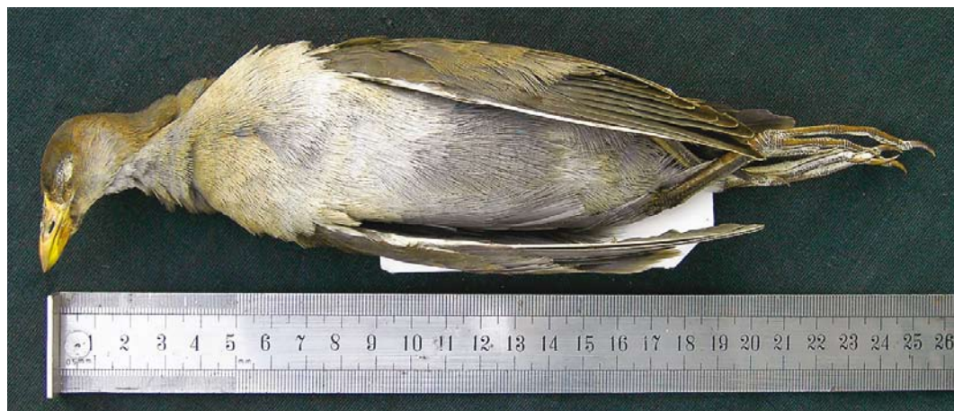
134 Lesser Moorhen / Afrikaans Waterhoen Paragallinula angulata , first-year (collected off Laxe, A Coruña, Spain, on 5 February 2000), Wildlife Recovery Center, Oleiros, A Coruña, 19 November 2006

Before making the record public, I tried to get more information about the circumstances under which the bird had been collected. The specimen had no further information on the original label than 'collected. Laxe, February 5, 2000'. I requested more information from the center and received the answer that the bird had been captured by a fisherman three nautical miles offshore from the port of Laxe, A Coruña, and had been given to the staff of the Red Cross in the harbour, who subsequently contacted the recovery centre of Oleiros.