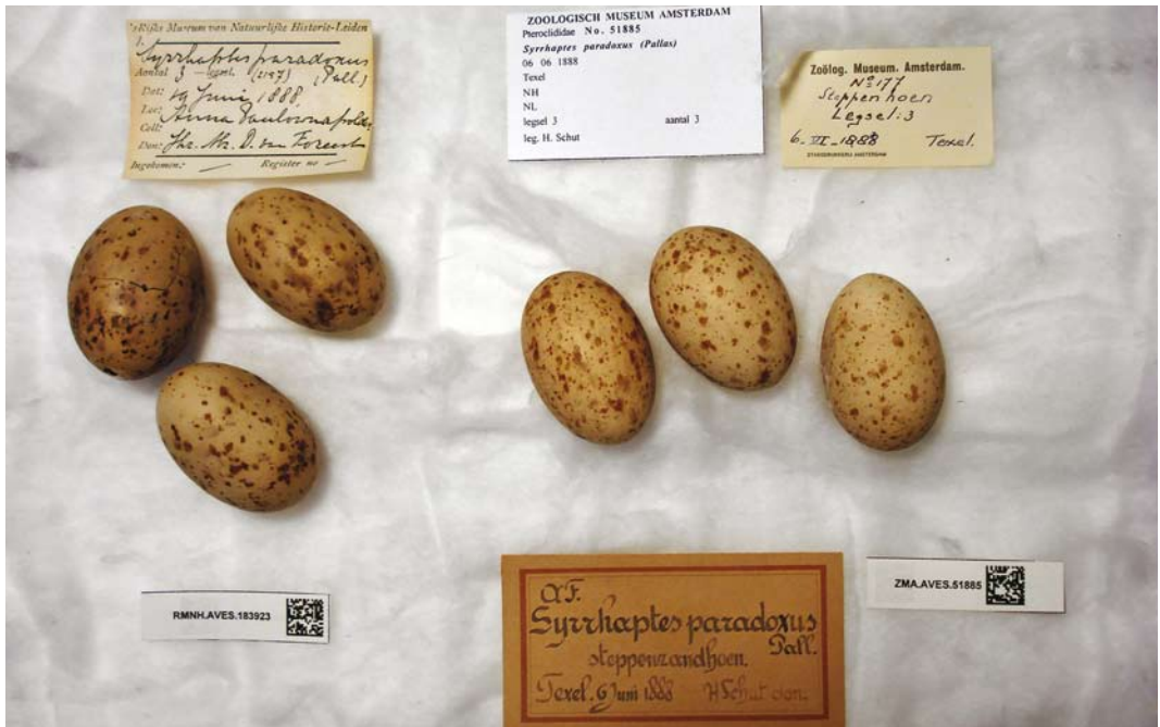
107 Legsels van Steppehoer / Pallas's Sandgrouse Syrhaptus paradoxus (verzameld op Texel, Noord-Holland, op 6 juni 1888 (rechts) en te Anna-Paulownapolder, Noord-Holland, op 19 juni 1888), Naturalis Biodiversity Center, Leiden, Zuid-Holland, 13 november 2013