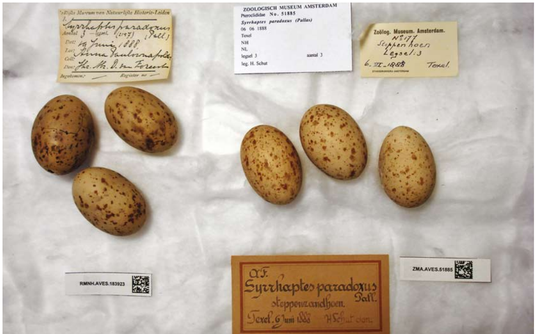
107 Legsels van Steppenhoer / Pallas's Sandgrouse Syrnhaptes paradoxus (verzameld op Texel, Noord-Holland, op 6 juni 1888 (rechts) en te Anna-Paulownapolder, Noord-Holland, op 19 juni 1888), Naturalis Biodiversity Center, Leiden, Zuid-Holland, 13 november 2013