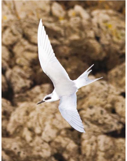
58 American Herring Gull / Amerikaanse Zilvermeeuw Larus smithsonianus , third-winter, Portimão, Algarve, Portugal, 4 December 2016 59 Forster's Tern / Forsters Stern Sterna forsteri , adult, Playa de Santa Cruz, Oleiros, A Coruña, Spain, 3 December 2016 60 Ring-billed Gull / Ringsnavelmeeuw Larus delawarensis , adult (front), with Mew Gull / Stormmeeuw L. canus , Aktau, Mangystau, Kazakhstan, 3 December 2016