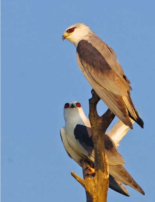
4 Black-winged Kites / Griize Wouwen Elanus caeruleus vociferus , pair, Hula valley, Israel, 27 November 2011 (Thomas Krumenacker)