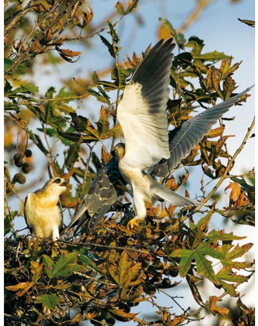
5 Black-winged Kites / Griize Wouwen Elanus caeruleus vociferus , adult with juveniles on nest, Hula valley, Israel, 24 November 2011

have been documented in Baghdad and Diyala provinces in central and eastern Iraq (Ararat et al 2011) and it is apparently expanding its range. The subspecific identity of the Iraqi records is unclear but all are assumed to have been vociferus .