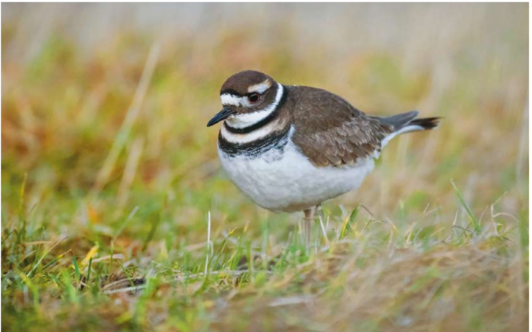
64 Killdeer / Killdeerplevier Charadrius vociferus , first-winter, Bjørøya, Nord-Trøndelag, Norway, 24 December 2016