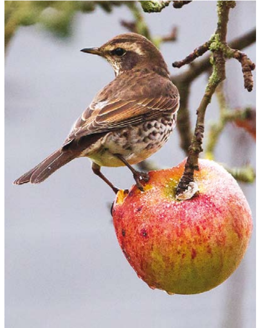
73 Presumed Asian House Martin / vermoedelijke Aziatische Huiszwaluw Delichon dasypus , Ma'agan Michael, Israel, 16 December 2016 ( Barak Granit ) 74 Dusky Thrush / Bruine Lijster Turdus eunomus , first-winter female, Beeley, Derbyshire, England, 6 December 2016 ( Alan Curry ) 75 Vinous-throated Parrotbill / Bruinkopdiksnavelmees Sinosuthora webbiana , Swartbroek, Limburg, Netherlands, 30 December 2016 ( Arnoud B van den Berg ). Bird of small feral population in this area.