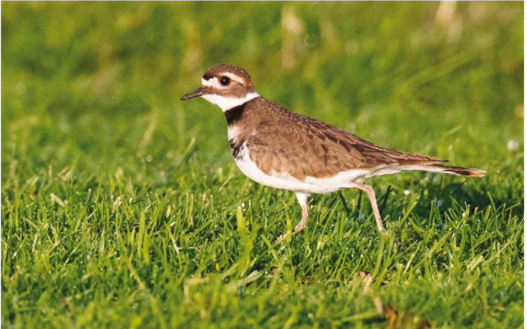
63 Killdeer / Killdeerplevier Charadrius vociferus , first-winter, Sandwick, Mainland, Shetland, Scotland, 13 December 2016