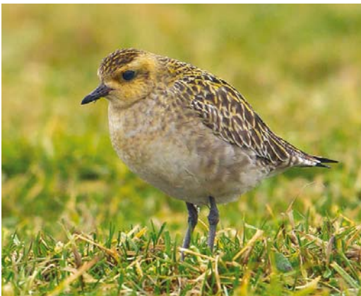
101 Aziatische Goudplevier / Pacific Golden Plover Pluvialis fulva , adult winter, Goedereede, Zuid-Holland, 1 januari 2017 (Kris De Rouck)