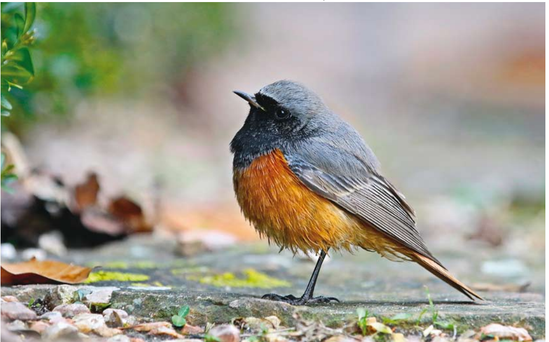
77 Eastern Black Redstart / Oosterse Zwarte Roodstaart Phoenicurus ochruros phoenicuroides , first-winter male, Barendrecht, Zuid-Holland, Netherlands, 14 January 2017