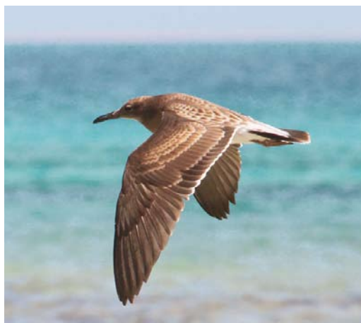
18 White-eyed Gulls / Witoogmeeuwen Larus leucophthalmus , off Hurghada, Egypt, 12 August 2014 (Mohamed I Habib). Adult guarding two fledglings. 19 White-eyed Gull / Witoogmeeuw Larus leucophthalmus , juvenile, Hurghada, Egypt, 25 September 2014 (Mohamed I Habib) 20 White-eyed Gull / Witoogmeeuw Larus leucophthalmus , first-summer, Hurghada, Egypt, 8 June 2014 (Mohamed I Habib) 21 White-eyed Gull / Witoogmeeuw Larus leucophthalmus , juvenile, Hurghada, Egypt, 12 October 2015 (Mohamed I Habib)

hotels and private villas and the main sewage ponds are used for drinking (see above). In 1998, the Red Sea Governor banned the burning of rubbish in open fires, enabling the gulls to take advantage of the garbage dump. The species increased rapidly and its main breeding colony moved from the northern islands to Umm Gawish in front of Hurghada city. This island is relatively undisturbed because it is not important to the diving business. It mainly offers protection from wind and landing space for the daily boats and safari boats. Where habitats are not disturbed, most bird numbers remain relatively stable over long periods. Breeding numbers may fluctuate from year to year but within narrow limits. The low number of nests (1450) on Umm Gawish in 2015 may have been due to the unusually high temperatures reaching 52°C on one day in late May.