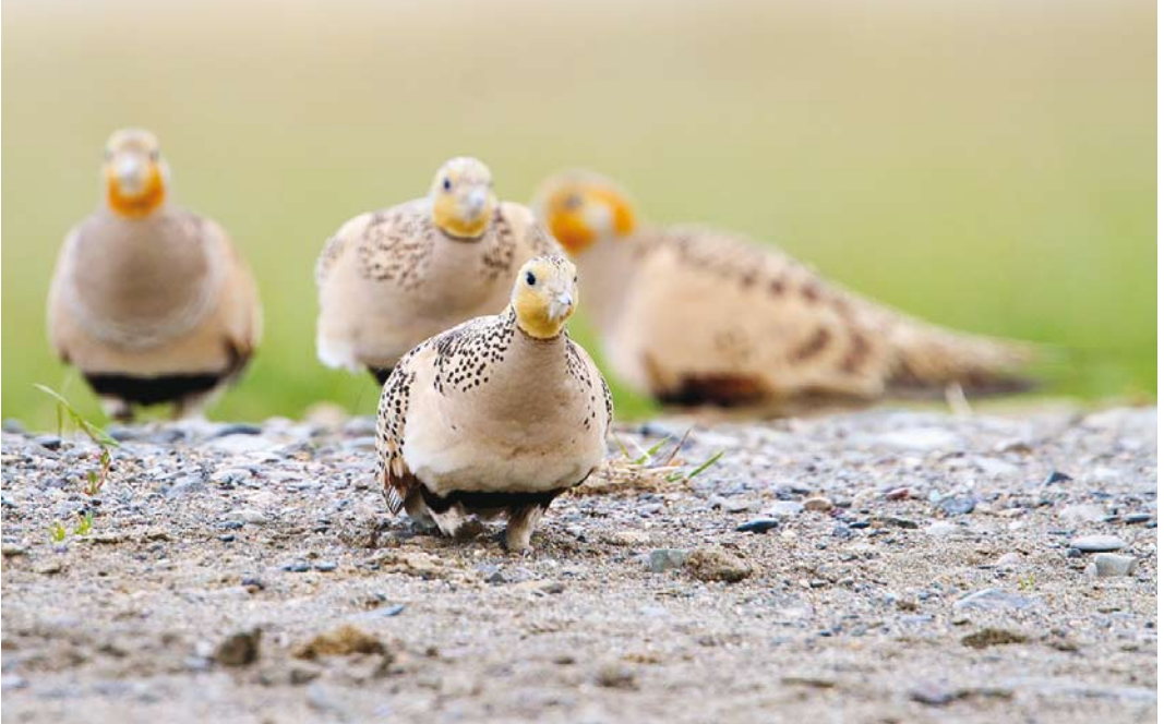
52 Pallas's Sandgrouse / Steppehoenders Syrrhaptes paradoxus , males (left and right) and females (centre), between Zaysan lake and Tarbagatai mountains, East Kazakhstan, Kazakhstan, 25 May 2014

June 1990; in Nord-Trøndelag, Norway, in July–November 1990; at Kuusamo, Finland, in June 1992; and at Askola, Lappeenranta, Finland, in July–August 2010 (Slack 2009; cf Dutch Birding 32: 336, 2010).