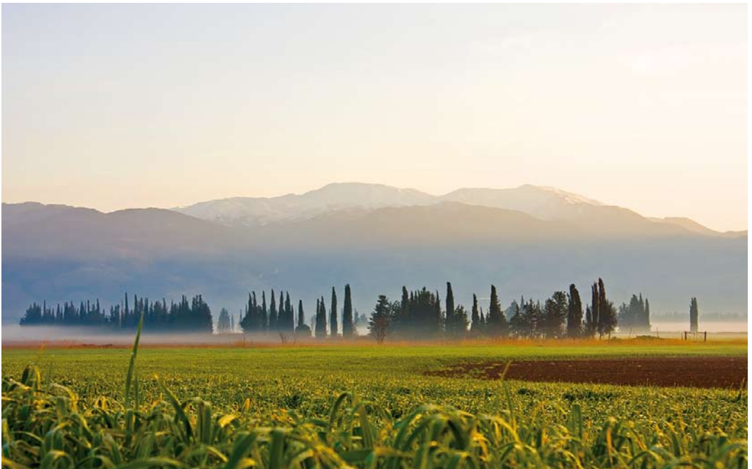
3 Breeding habitat of Black-winged Kite Elanus caeruleus , Hula valley, Israel, 17 February 2008 (Thomas Krumenacker)