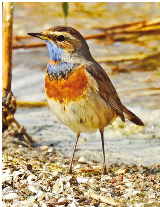
299 Roodstuitzwaluw / Red-rumped Swallow Cecropis daurica , De Cocksdoop, Texel, Noord-Holland, 25 april 2017 ( Julian Bosch ) 300 Mogelijke Roodsterblauwborst / possible Red-spotted Bluethroat Luscinia svecica svecica , Vijfhoek, Diemen, Noord-Holland, 4 april 2017 ( Pieter Doorn ) 301 Mogelijke Balkankwikstaart / possible Black-headed Wagtail Motacilla feldegg , tweede-kalenderjaar mannetje, Zeeburg, Texel, Noord-Holland, 19 april 2017 ( Jos van den Berg/birdingtexel.com )