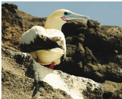
235 Red-footed Booby / Roodpootgent Sula sula , adult, Raso, Cape Verde Islands, 14 March 2013 (Martin Gottschling)