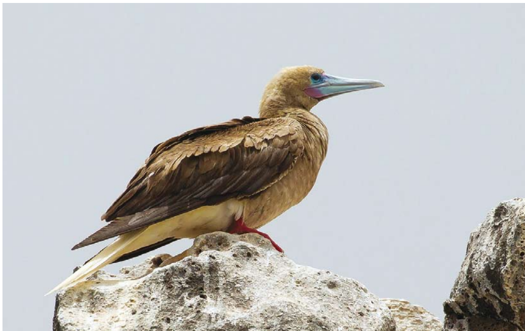
270 Red-footed Booby / Roodpootgent Sula sula , adult, Raso, Cape Verde Islands, 2 April 2017 (Kris De Rouck)