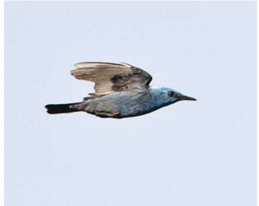
258 Blauwe Rotslijster / Blue Rock Thrush Monticola solitarius , eerste-zomer mannetje, Industrierterrein, Vlieland, Friesland, 26 april 2017

lippensis wordt gekenmerkt door de rode onderdelen bij een adult mannetje; vrouwtjes en onvolwassen vogels zijn donkerder dan vogels in West-Azië en Europa en vertonen vaak wat rossige tekening op de onderdelen. M s pandoo uit Centraal-Azië lijkt meer op de westelijke ondersoorten. M s madoci komt alleen voor in Maleisië en Indonesië en is duidelijk kleiner met een kortere staart dan de andere ondersoorten (Clement et al 2000). Zuccon & Ericson (2010) gaven op basis van fylogenetisch onderzoek aan dat de groep van drie oostelijke ondersoorten beter als aparte soort kan worden beschouwd (Aziatische Blauwe Rotslijster M philippensis ).