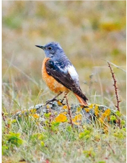
289 Blue Rock Thrush / Blauwe Rotslijster Monticola solitarius , male, Beachy Head, Sussex, England, 6 April 2017 290 Common Rock Thrush / Rode Rotslijster Monticola saxatilis , first-summer male, Den Helder, Noord-Holland, Netherlands, 3 May 2017 291 Hermit Thrush / Heremietlijster Catharus guttatus , Noss, Shetland, Scotland, 19 April 2017