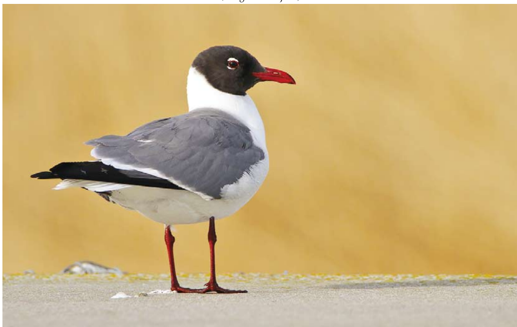
271 Laughing Gull / Lachmeeuw Larus atricilla , adult, Nowa Pasłęka, Warmińsko-Mazurskie, Poland, 26 April 2017 (Zbigniew Kajzer)