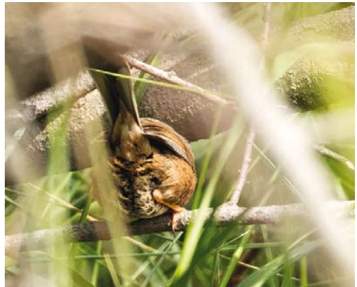
259-262 Tristram's Warbler / Atlasgrasmus Sylvia deserticola , male, Montpellier, Hérault, France, 7 May 2016 (Damien Gailly)