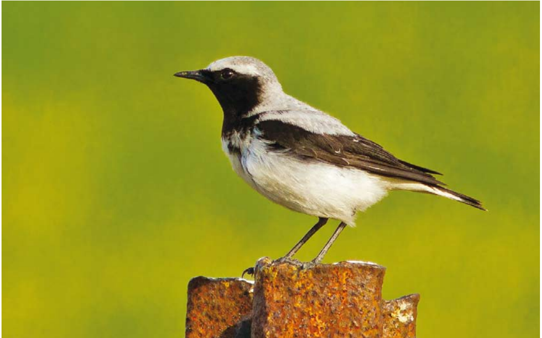
304 Seebohms Tapuit / Seebohm's Wheatear Oenanthe seebohmi , mannetje, Solleveld, Zuid-Holland, 22 mei 2017

hem vanaf het uitkijkpunt – zij het heel kort en op flink afstand. De mensen in het terrein konden hem daarna niet meer terugvinden en daarmee leken de kansen voor de toegesnelde vogelaars verspeeld. Het verhaal kreeg weer een wending toen Jacco Duindam en Danny Laponder hem rond 20:20 c 600 m naar het noorden terugvonden, foeragerend bij het hek tussen vakantiepark Ockenburgh en Solleveld. Ondernemende vogelaars vonden een weg door het vakantiepark en zagen de vogel rond dat tijdstip vanaf een openbaar toegankelijk punt. Hier was hij tot c 22:00 vrijwel continu in beeld, tot opluchting van al uren aanwezige vogelaars en velen die pas na het terugvinden waren gaan reizen. Uiteindelijk werd hij door c 150 vogelaars gezien. Vrijwel alle toegesnelde vogelaars hielden zich aan de regels maar helaas werden ook enkelen op de bon geslingerd omdat ze afgesloten terrein betraden. De volgende dag was de tapuit gevlogen.