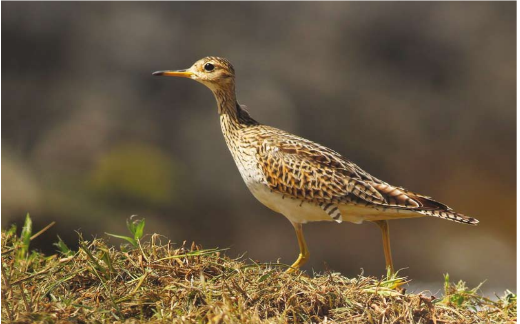
268 Upland Sandpiper / Bartrams Ruiters Bartramia longicauda , Mosteiros, São Miguel, Azores, 3 May 2017 (Gerbrand Michielsen)