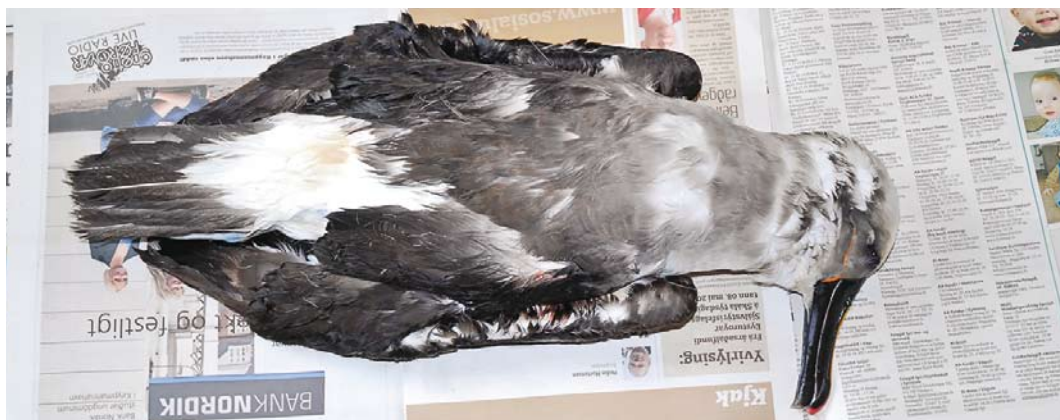
228 Atlantic Yellow-nosed Albatross / Geelneusalabartos Thalassarche chlororhynchos , immature female (caught on board of ship at sea c 204 km north-west off Faeroes on 22 July 2012), 7 August 2012

off Trøndelag (Olsen 2014; Dutch Birding 32: 204, plate 264, 2010)