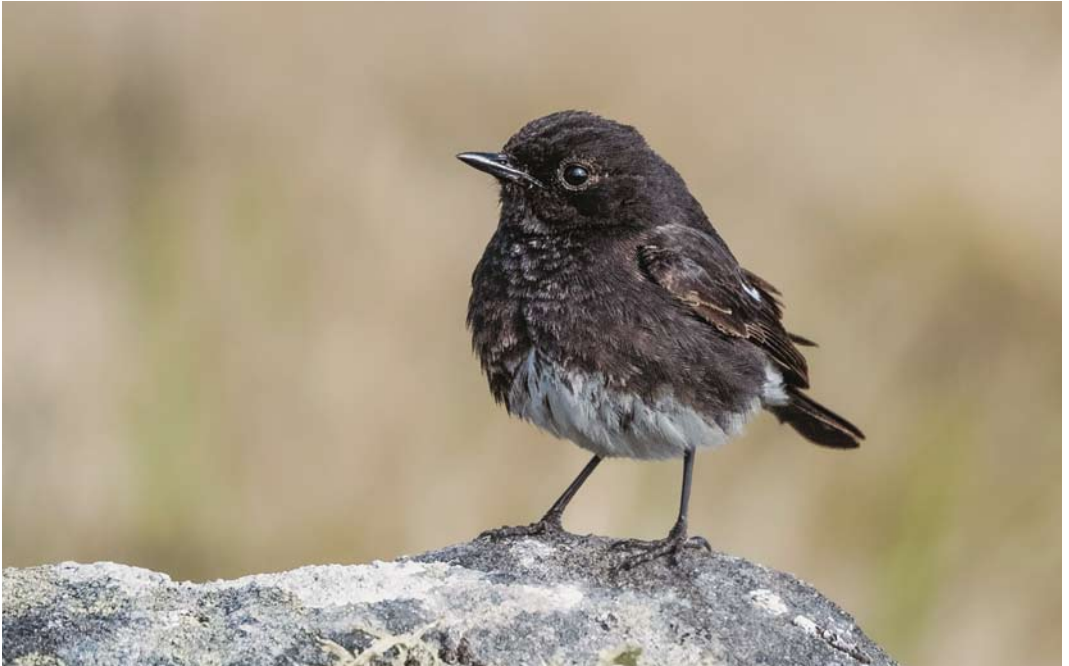
263 Pied Bush Chat / Zwarte Roodborsttapuit Saxicola caprata , first-summer male, Utö, Korppoo, Finland, 19 May 2017