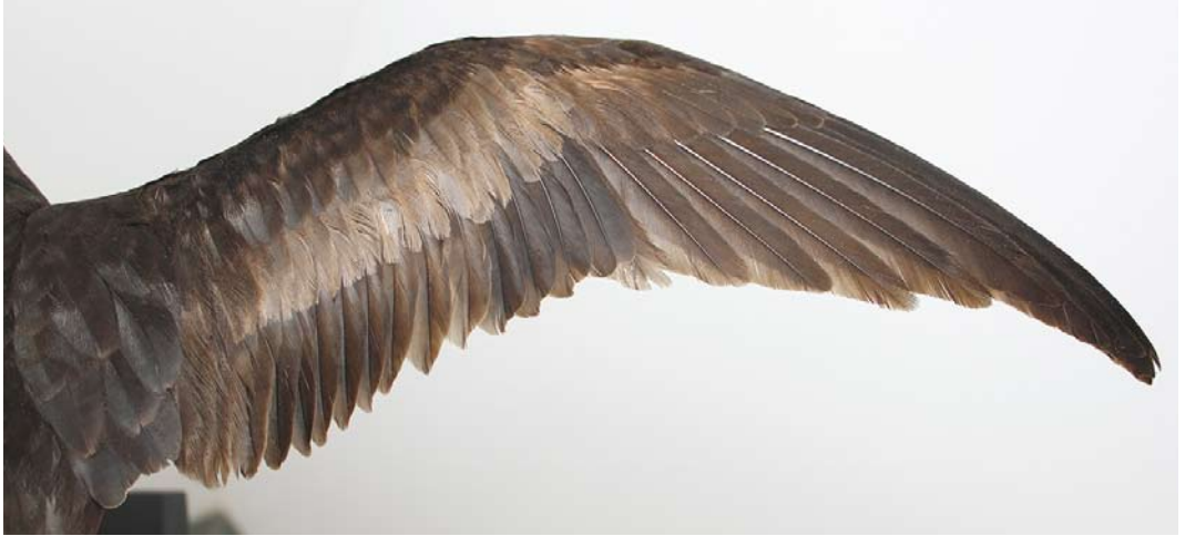
255 Bulwer's Petrel / Bulwers Stormvogel Bulweria bulwerii (picked up alive at Kressbachsee, Baden-Württemberg, Germany, on 20 July 2015), Staatliches Museum für Naturkunde, Stuttgart, Baden-Württemberg, Germany, 16 October 2016. Stretched upperwing.

ties committee of Morocco (table 2). The spatial distribution of the records (figure 1) shows that the German bird is the first for Central Europe and the first inland in the Western Palearctic.