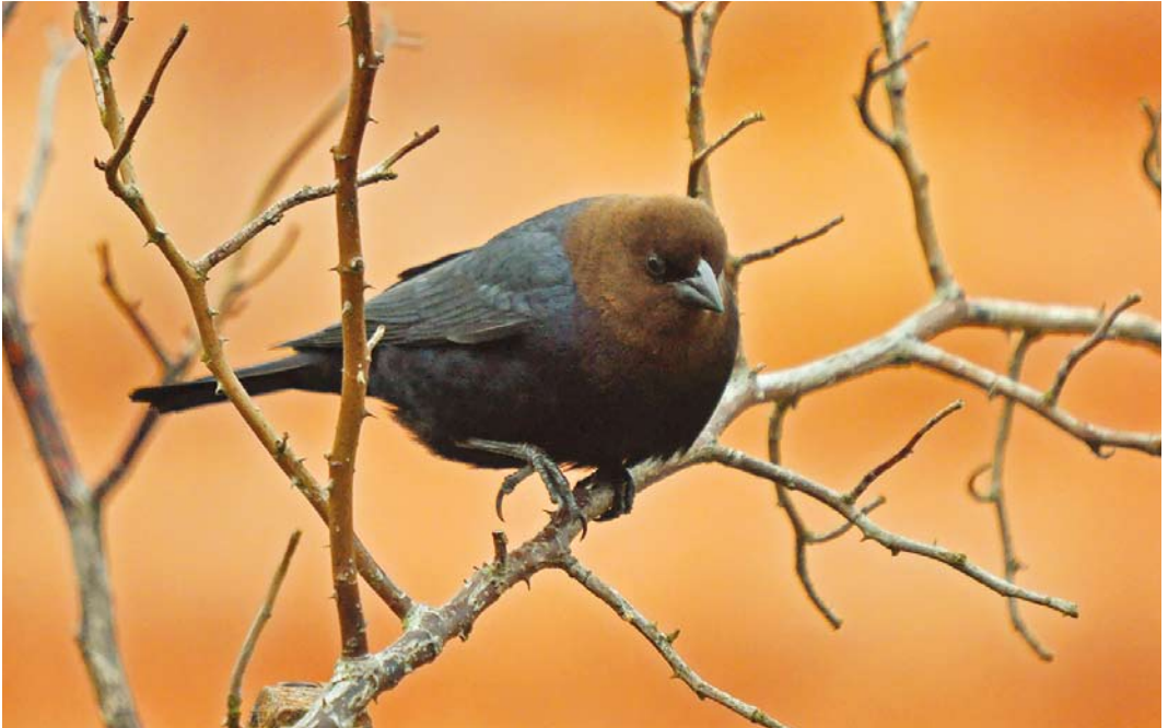
245 Brown-headed Cowbird / Bruinkopkoevogel Molothrus ater , male, Ouzouër-sur-Trézée, Loiret, France, 4 May 2010