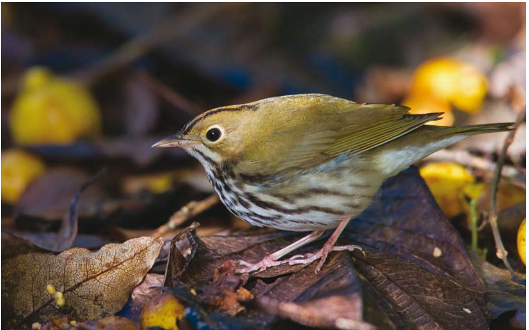
246 Ovenbird / Ovenvogel Seiurus aurocapilla , Ponta da Fajã, Flores, Azores, 23 October 2011