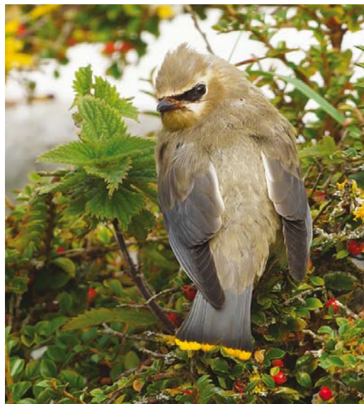
240 Cedar Waxwing / Cederpestvogel Bombycilla cedrorum , juvenile, Vaul, Tiree, Argyll & Bute, Scotland, 28 September 2013

Grey Catbird / Katvogel Dumetella carolinensis