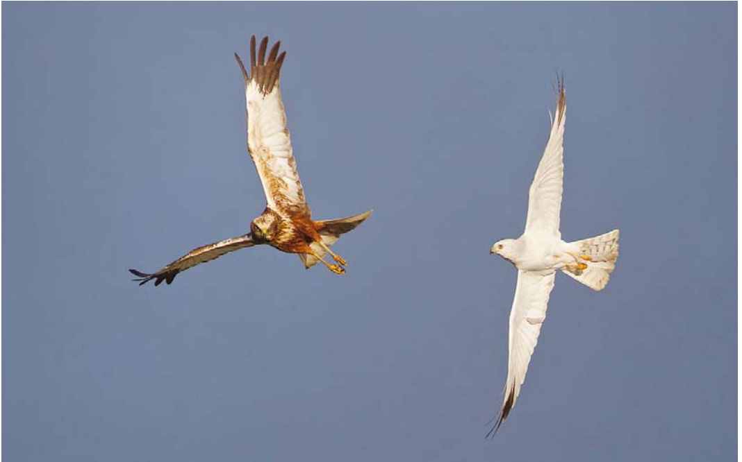
292 Steppekiekendief / Pallid Harrier Circus macrourus , adult mannetje (rechts), met Bruine Kiekendief / Marsh Harrier C. aeruginosus , mannetje, 't Weegje, Waddinxveen, Zuid-Holland, 27 april 2017 (Martin van der Schalk)