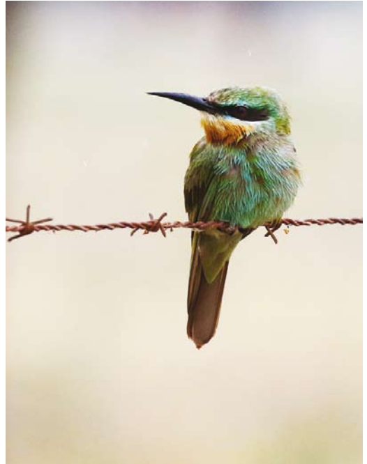
286 Great Spotted Cuckoo / Kuifkoekeek Clamator glandarius , adult, Gura Dobrogei, Constanța, Romania, 8 May 2017 287 Blue-cheeked Bee-eater / Groene Bijeneter Merops persicus , Moheda Alta, Badajoz, Extremadura, Spain, 28 April 2017 288 Dark-eyed Junco / Grijze Junco Junco hyemalis , male, Skomer, Pembrokeshire, Wales, 8 May 2017