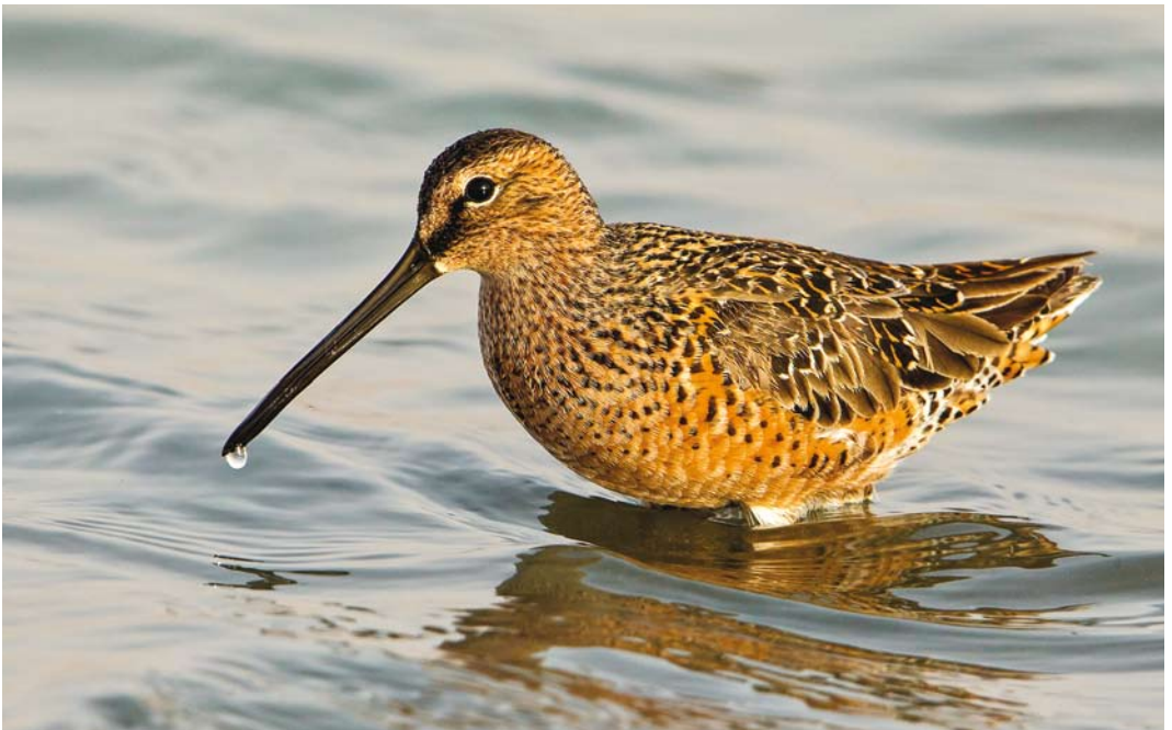
269 Long-billed Dowitcher / Grote Grijze Snip Limnodromus scolopaceus , K20, Eilat, Israel, 26 April 2017