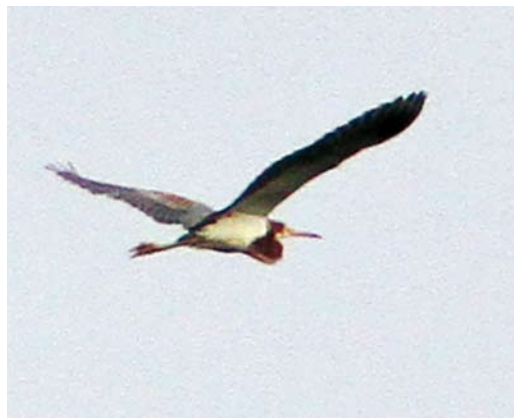
234 Tricolored Heron / Witbuikreiger Egretta tricolor , juvenile, Cabo da Praia, Terceira, Azores, 20 October 2012 (Dominic Mitchell)

Mitchell (2017) suggests that the record from the Canary Islands concerned the same individual as a bird in the Azores in October 2007.