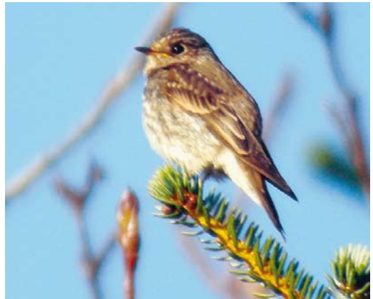
236 Yellow-throated Vireo / Geelkeelvireo Vireo flavifrons , Corvo, Azores, 11 October 2008 (Dominic Mitchell) 237 Eastern Crowned Warbler / Kroonboszanger Phylloscopus coronatus , Ingooigem, West-Vlaanderen, Belgium, 24 October 2016 (Miguel Demeulemeester) 238 Thick-billed Warbler / Diksnavelrietzanger Arundinax aedon , Geosetter, Mainland, Shetland, Scotland, 5 October 2013 (Stuart Piner) 239 Dark-sided Flycatcher / Roetvliegenvanger Muscicapa sibirica , first-winter, Höfn, Austur-Skaftafellssýsla, Iceland, 5 October 2012 (Brynjúlfur Brynjólfsson)

two juveniles (van den Berg & Haas 2013d, Isenmann et al 2016)