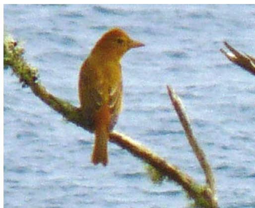
241 Stejneger's Stonechat / Stejnegers Roodborsttapuit Saxicola stejnegeri , first-winter male, Orivesi, Pappilanniemi, Finland, 7 November 2013 ( Jani Vastamäki ) 242 Variable Wheatear / Picatatapuit Oenanthe picata , Liyah Reserve, Jahra, Kuwait, 24 March 2014 ( Abdulrahman Al-Sirhan ) 243 Summer Tanager / Zomertangare Piranga rubra , Ribeira da Lapa, Corvo, Azores, 14 October 2010 ( Hugues Dufourny )

2#9-11 October 2015, Ottenby, Öland (Magnus Hellström in litt)