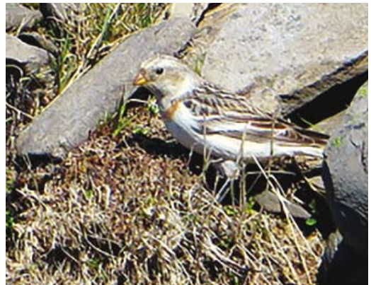
277 Common Rock Thrush / Rode Rotslijster Monticola saxatilis , adult male, St Martin's, Scilly, England, 15 April 2017 ( Brian Harrison ) 278 Black-throated Thrush / Zwartkeellijster Turdus atrogularis , adult male, Wadi Lahami, Egypt, 25 April 2017 ( Mattias Nilsson ) 279 White-crowned Wheatear / Witkruintapuit Oenanthe leucopyga , first-summer, Campo Gallo, Viterbo, Italy, 26 March 2017 ( Angelo Meschini ) 280 Blue-naped Mousebird / Blauwnekmuisvogel Urocolius macrourus , Choum, Adrar, Mauritania, 19 April 2017 ( Claes Wikström/bigyearwp.com ) 281 Little Bunting / Dwerggors Emberiza pusilla , adult, Drăușeni, Brașov, Romania, 27 March 2017 ( József Szabó ) 282 Snow Bunting / Sneeuwgors Plectrophenax nivalis , female, Pico do Areiro, Madeira, 3 April 2017 ( Han Buckx )