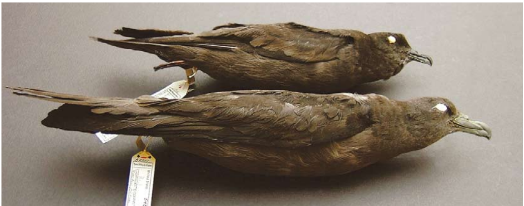
254 Comparison of Bulwer's Petrel / Bulwers Stormvogel Bulweria bulwerii (back) and Jouanin's Petrel / Jouanins Stormvogel B fallax (front) (Peter Pyle/© B P Bishop Museum, Honolulu, Hawaii, USA). Note differences in body size and bill shape.

Bulwer's Petrels belong to the few European pelagic bird species that are hardly seen at the European coasts, even after storm events. The Atlantic breeding population comprises c 11 000 breeding pairs (Ramos et al 2015) of which c 5000 breed on the Selvagens alone (Zino & Bischoit 1994). Further, breeding occurs on the Azores,