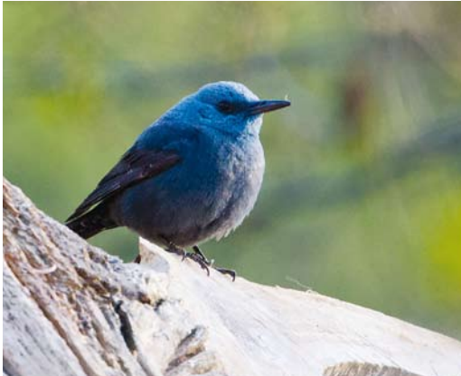
257 Blauwe Rotslijster / Blue Rock Thrush Monticola solitarius , eerste-zomer mannetje, Oude Eendenkooi, Vlieland, Friesland, 26 april 2017 (Alex Bos)