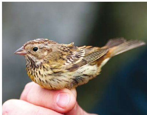
244 Chestnut Bunting / Rosse Gors Emberiza rutila , first-winter, Merkeskogen, Utsira, Rogaland, Norway, 5 October 2010

4# 31 October 2016, Corvo (Ławicki & van den Berg 2016f; Dutch Birding 38: 457, plate 696, 2016)