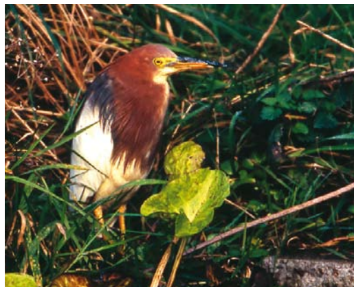
233 Chinese Pond Heron / Chinese Ralreiger Ardeola bacchus , adult, Eccles-on-Sea, Norfolk, England, 31 October 2004

4 16 January to 29 May 2011, Barragem de Poilão, Santiago, maximum of two; 22 January to 6 April 2012, Barragem de Poilão, Santiago, two; 19 April to 5 May 2012, Barragem de Poilão, Santiago; 3 March to 22 April 2013, Barragem de Poilão, Santiago; 13 January to 24 March 2014, Barragem de Poilão, Santiago; 12 April 2014, Barragem de Poilão, Santiago; 26 December 2014 to 15 March 2015, Barragem de Poilão, Santiago; 19 December 2015 to at least 4 April 2016, Barragem de Poilão, Santiago, maximum of two (Hazevoet 2012, 2014, Gantlett 2013, van den Berg & Haas 2014bc, Ławicki & van den Berg 2016abc; Kees Hazevoet in litt; Dutch Birding 33: 201, plate 232, 2011, 34: 113, plate 149, 2012, 35: 134, plate 158, 2013)