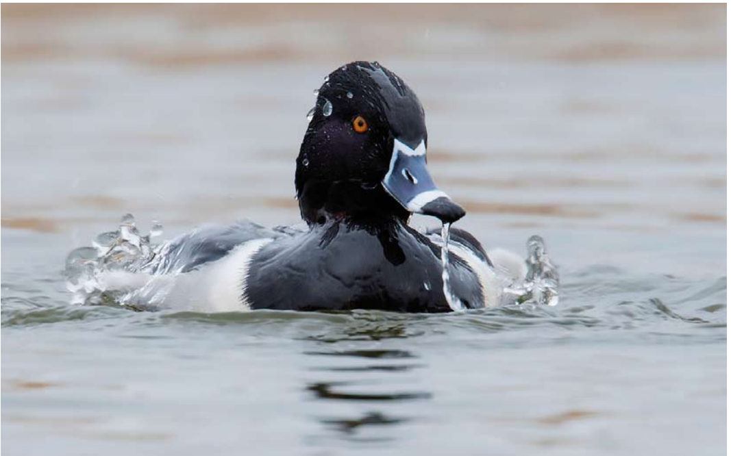
293 Ringsnaveleend / Ring-necked Duck Aythya collaris , adult mannetje, Appingedam, Groningen, 17 februari 2017