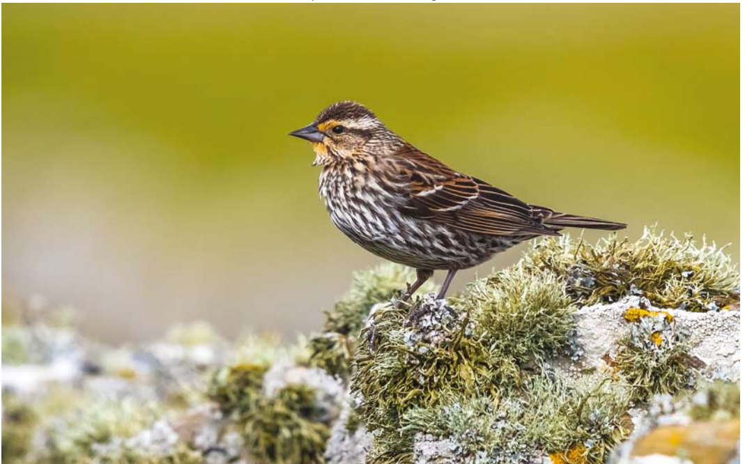
264 Red-winged Blackbird / Epauletspreeuw Agelaius phoeniceus , female, North Ronaldsay, Orkney, Scotland, 14 May 2017 ( Vincent Legrand )