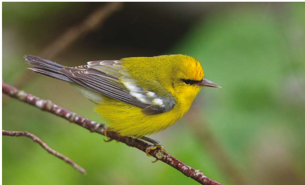
247 Blue-winged Warbler / Blauwvleugelzanger Vermivora cyanoptera , first-year, Corvo, Azores, 17 October 2015 (Mika Bruun)