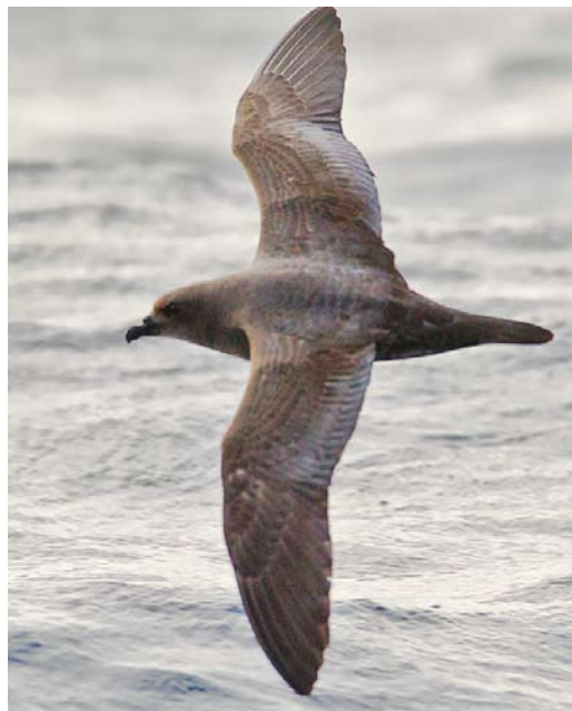
230 Trindade Petrel / Arminjons Stormvogel Pterodroma arminjoniana , dark morph, at sea c 6 km off Corvo, Azores, 11 October 2011

No additional records: one record in 1800-2016