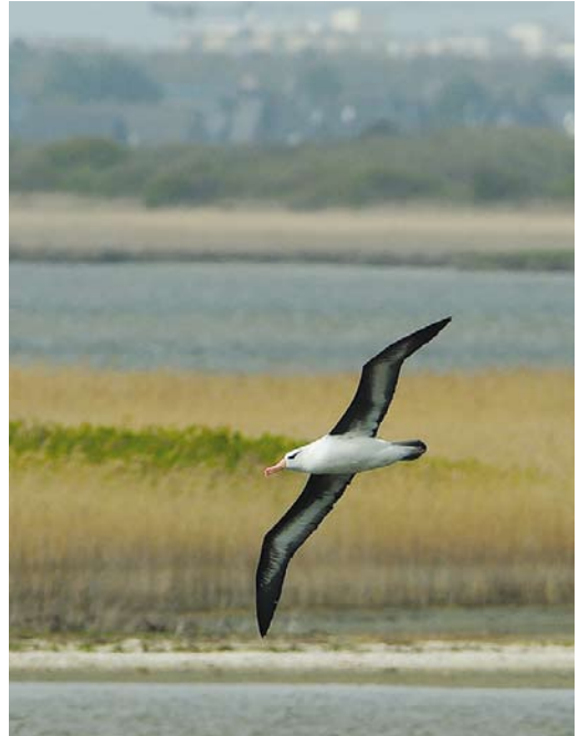
265 Three-banded Plover / Driebandplevier Charadrius tricollaris , adult, Aswan, Egypt, 4 May 2017 (Claes Wikström/ bigyearwp.com ) 266 Black-browed Albatross / Wenkbrauwalbatros Thalassarche melanophris , adult, Rantumbecken, Sylt, Schleswig-Holstein, Germany, 21 April 2017 (Martin Gottschling) 267 Black-browed Albatross / Wenkbrauwalbatros Thalassarche melanophris , adult, with Common Eiders / Eiders Somateria mollissima , Rantumbecken, Sylt, Schleswig-Holstein, Germany, 21 April 2017 (Martin Gottschling)