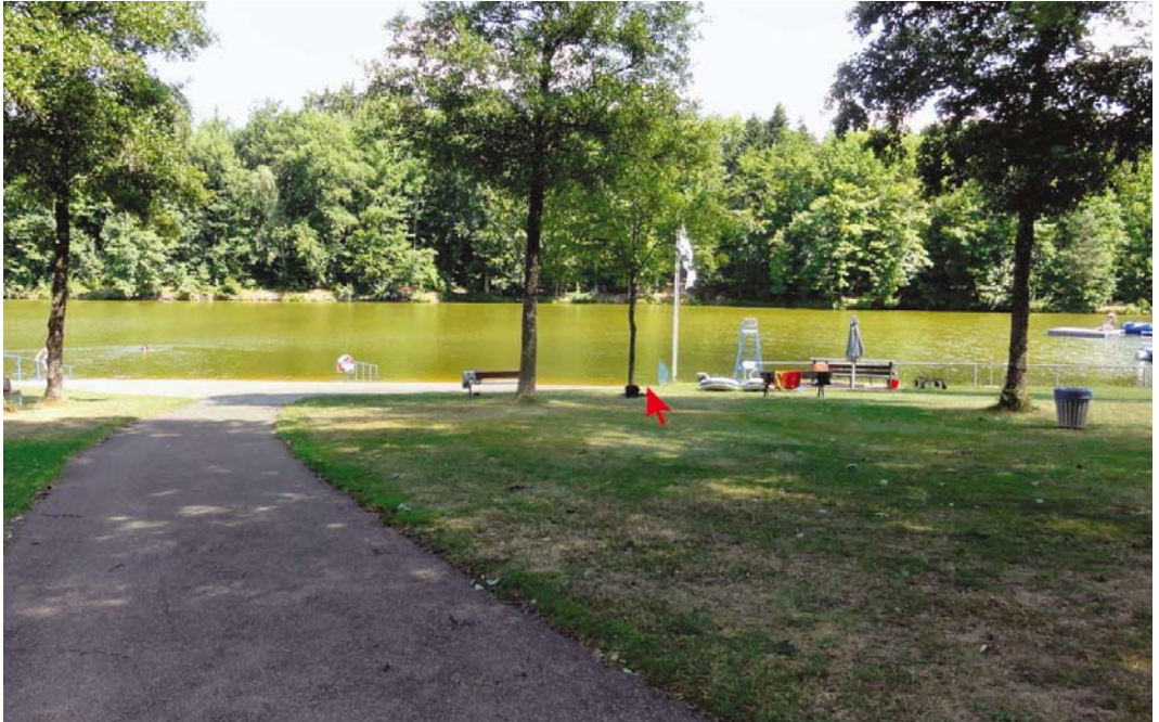
251 Kressbachsee, Baden-Württemberg, Germany (arrow marks spot where Bulwer's Petrel Bulweria bulwerii was first found on 20 July 2015), 26 July 2015 ( Helmut Vaas ) 252 Bulwer's Petrel / Bulwers Stormvogel Bulweria bulwerii (picked up alive at Kressbachsee, Baden-Württemberg, Germany, on 20 July 2015), Staatliches Museum für Naturkunde, Stuttgart, Baden-Württemberg, Germany, 8 December 2015 ( Johannes Mayer ). Spread tail-feathers. Note perforations.