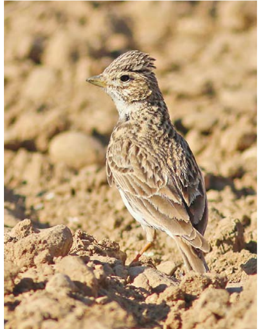
283 African Grey Woodpecker / Grijsgroene Specht Dendropicos goertae , female, north of Ouadâne, Adrar, Mauritania, 21 April 2017 284 Lesser Short-toed Lark / Kleine Kortteenleeuwerik Alaudala rufescens , Gillonay, Isère, France, 23 April 2017 285 Radde's Accentor / Steenheggenmus Prunella ocularis , Liyah reserve, Kuwait, 31 March 2017