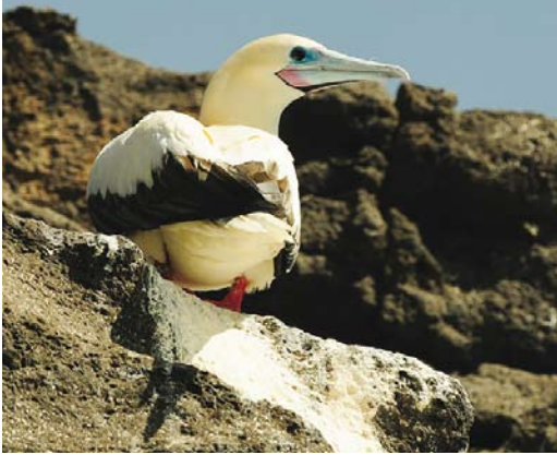
235 Red-footed Booby / Roodpootgent Sula sula , adult, Raso, Cape Verde Islands, 14 March 2013 (Martin Gottschling)