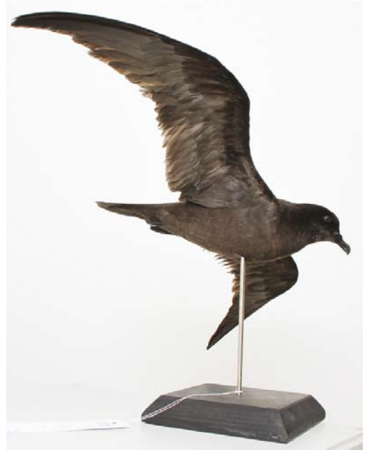
253 Bulwer's Petrel / Bulwers Stormvogel Bulweria bulwerii (picked up alive at Kressbachsee, Baden-Württemberg, Germany, on 20 July 2015), Staatliches Museum für Naturkunde, Stuttgart, Baden-Württemberg, Germany, 16 October 2016