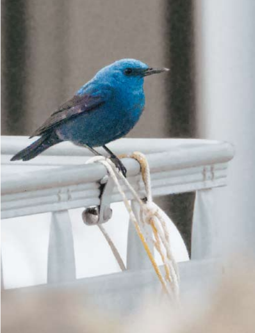
302 Blauwe Rotslijster / Blue Rock Thrush Monticola solitarius , eerste-zomer mannetje, Industrierrein, Vlieland, Friesland, 26 april 2017 (Jaap Denee)

HOPPEN TOT STAARTMEZEN Vroege Hoppen Upupa epops werden opgemerkt op 4 maart bij Aarle-Rixtel, Noord-Brabant, en op 26 maart bij Westervoort, Gelderland. In april volgden er nog ten minste 10. Op 30 april vloog een groep van acht Bijeneters Merops apiaster laag over een grote groep tellers bij Breskens. Waarnemingen later deze dag in Zuid-Holland bij onder meer Ouddorp (zeven), Oostvoorne en Katwijk hadden mogelijk betrekking op vogels uit deze groep. Vanaf half april kwamen uit in totaal 83 uurhokken meldingen van Draaihalzen Jynx torquilla . De eerste-winter Bruine Klauwier Lanius cristatus die vanaf 19 februari in Den Helder, Noord-Holland, verbleef werd voor het laatst gezien op 7 maart. Een Roodstuitwaluw Cecropis daurica liet zich van 22 tot 29 april uitgebreid bekijken in De Cocksorp op Texel, Noord-Holland; zelden was deze soort zo lang tuitchbaar op één plaats. Van c 20 plekken verspreid over het land kwamen meldingen van kleine aantallen Witkopstaartmezen Aegithalos caudatus caudatus .