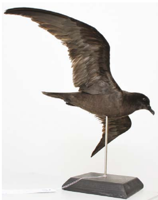
253 Bulwer's Petrel / Bulwers Stormvogel Bulweria bulwerii (picked up alive at Kressbachsee, Baden-Württemberg, Germany, on 20 July 2015), Staatliches Museum für Naturkunde, Stuttgart, Baden-Württemberg, Germany, 16 October 2016 ( Andreas Hachenberg )