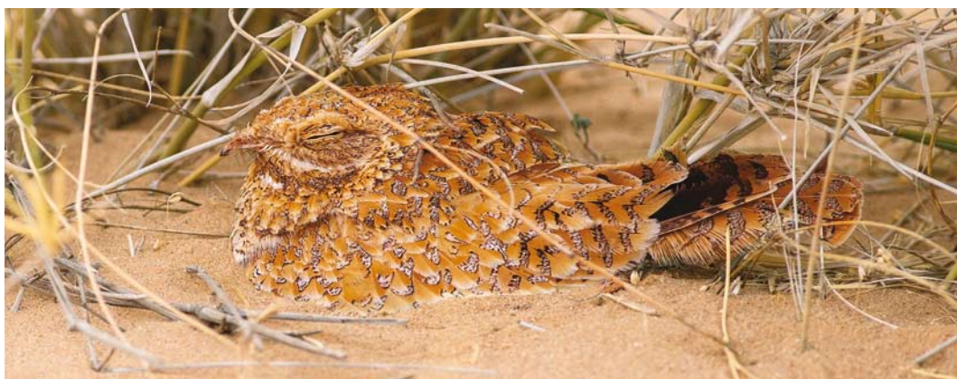
272 Blue-cheeked Bee-eater / Groene Bijeneter Merops persicus , Jandía, Fuerteventura, Canary Islands, 9 April 2017 ( Rubén Cerdeña ) 273 White-backed Vulture / Witruggier Gyps africanus , adult, Bir Shalatayn, Egypt, 25 March 2017 ( Heiko Krätzel ) 274 Pied-billed Grebe / Dikbekfuut Podilymbus podiceps , adult, Venda Nova, Codeçoso, Montalegre, Portugal, 16 March 2017 ( José Frade ) 275 Pectoral Sandpiper / Gestreepte Strandloper Calidris melanotos , Constantine, Algeria, 1 May 2017 ( Aïssa Djamel Filali ) 276 Golden Nightjar / Goudgele Nachtzwaluw Caprimulgus eximius , Oued Jenna, Aousserd, Oued Ad-Deheb, Western Sahara, Morocco, 29 April 2017 ( Sander Bot )