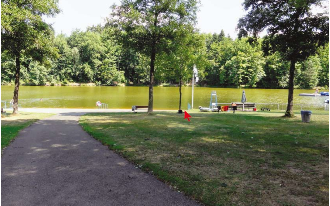
251 Kressbachsee, Baden-Württemberg, Germany (arrow marks spot where Bulwer's Petrel Bulweria bulwerii was first found on 20 July 2015), 26 July 2015 ( Helmut Vaas ) 252 Bulwer's Petrel / Bulwers Stormvogel Bulweria bulwerii (picked up alive at Kressbachsee, Baden-Württemberg, Germany, on 20 July 2015), Staatliches Museum für Naturkunde, Stuttgart, Baden-Württemberg, Germany, 8 December 2015 ( Johannes Mayer ). Spread tail-feathers. Note perforations.