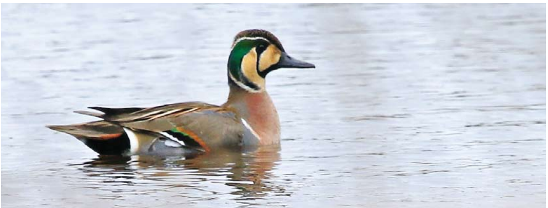
294 Grijsze Wouw / Black-winged Kite Elanus caeruleus , Robbenoordbos, Wieringermeer, Noord-Holland, 31 maart 2017 295 Vermoedelijke hybride Schreeuwarend x Bastaardarend / presumed hybrid Lesser Spotted x Greater Spotted Eagle Aquila clanga x pomarina , subadult, Losser, Overijssel, 30 maart 2017 296 Lammergier / Bearded Vulture Gypaetus barbatus , tweede-kalenderjaar, Delft, Zuid-Holland, 12 maart 2017 297 Provençaalse Grasmus / Dartford Warbler Sylvia undata , Berkheide, Zuid-Holland, 22 april 2017 298 Siberische Taling / Baikal Teal Anas formosa , mannetje, Noordwijkerhout, Zuid-Holland, 25 februari 2017