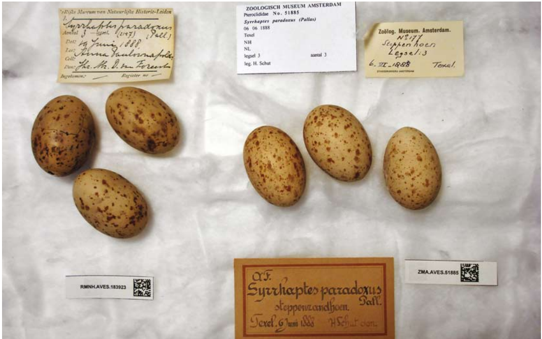
107 Legsels van Steppehoer / Pallas's Sandgrouse Syrhaptes paradoxus (verzameld op Texel, Noord-Holland, op 6 juni 1888 (rechts) en te Anna-Paulownapolder, Noord-Holland, op 19 juni 1888), Naturalis Biodiversity Center, Leiden, Zuid-Holland, 13 november 2013