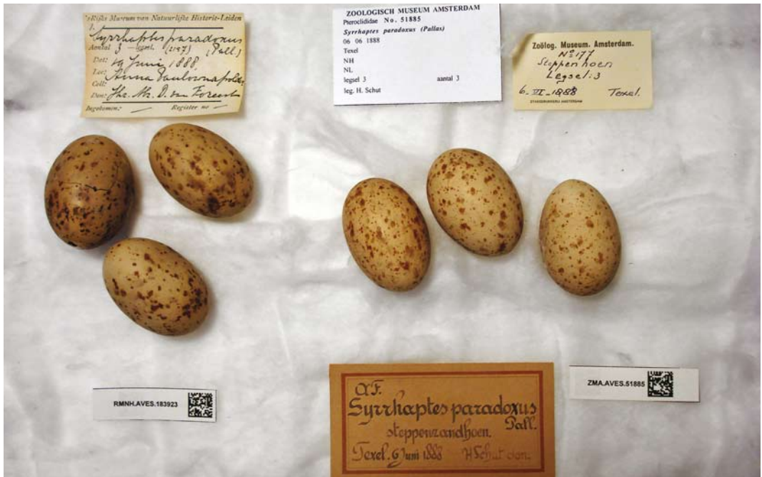
107 Legsels van Steppenhoer / Pallas's Sandgrouse Syrhaptes paradoxus (verzameld op Texel, Noord-Holland, op 6 juni 1888 (rechts) en te Anna-Paulownapolder, Noord-Holland, op 19 juni 1888), Naturalis Biodiversity Center, Leiden, Zuid-Holland, 13 november 2013