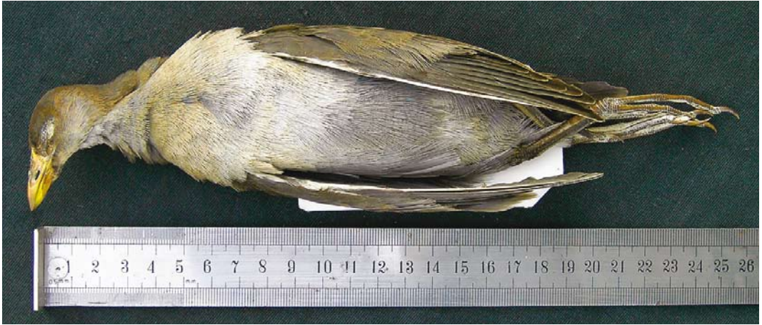
134 Lesser Moorhen / Afrikaans Waterhoen Paragallinula angulata , first-year (collected off Laxe, A Coruña, Spain, on 5 February 2000), Wildlife Recovery Center, Oleiros, A Coruña, 19 November 2006

Before making the record public, I tried to get more information about the circumstances under which the bird had been collected. The specimen had no further information on the original label than 'collected. Laxe, February 5, 2000'. I requested more information from the center and received the answer that the bird had been captured by a fisherman three nautical miles offshore from the port of Laxe, A Coruña, and had been given to the staff of the Red Cross in the harbour, who subsequently contacted the recovery centre of Oleiros.