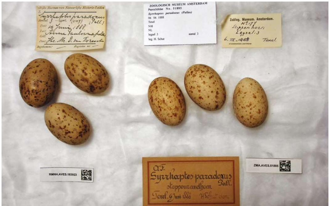
107 Legsels van Steppenhoer / Pallas's Sandgrouse Syrrhaptes paradoxus (verzameld op Texel, Noord-Holland, op 6 juni 1888 (rechts) en te Anna-Paulownapolder, Noord-Holland, op 19 juni 1888), Naturalis Biodiversity Center, Leiden, Zuid-Holland, 13 november 2013