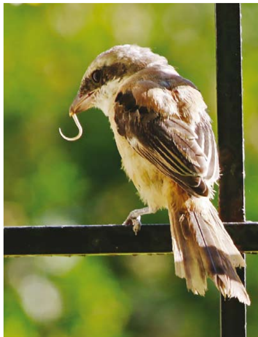
148 Long-tailed Shrike / Langstaartklauwier Lanius schach erythronotus , juvenile, Victory Park, Atyrau, Kazakhstan, 14 August 2016 (Fedor Sarayev)

forming little speculum almost hidden by the wing-covert; 10 dark brown secondaries with buff edges; and 11 tail with blackish-brown central feathers, paler two inner feathers and pale brown outermost feather, tinged buff (all tail-feathers except the inner with pale edges). The juveniles had the crown, nape and mantle brownish-grey with a brown, scaly pattern. The rump and uppertail-coverts were rusty with a brown pattern and the flight-feathers dark brown with rufous edges. The underparts were greyish with a brown, scaly pattern. The mask was pale brown.