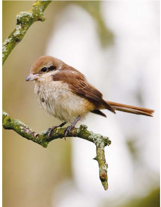
124 Bruine Klauwier / Brown Shrike Lanius cristatus , eerste-winter, Den Helder, Noord-Holland, 4 maart 2017 (Alex van der Giessen)