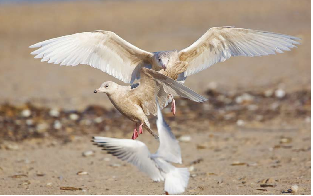
206 Grote Burgemeester / Glaucous Gull Larus hyperboreus , eerste-winter (boven), en Kleine Burgemeester / Iceland Gull L. glaucooides , eerste-winter (midden), met Kokmeeuw / Black-headed Gull Chroicocephalus ridibundus , Kijkduin, Den Haag, Zuid-Holland, 22 januari 2017 207 Grote Burgemeester / Glaucous Gull Larus hyperboreus , adult, met Buizerd / Common Buzzard Buteo buteo , Paezemerlannen, Lauwersmeer, Friesland, 17 januari 2017