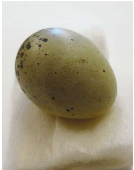
110 Legsel van Witwangstern / Whiskered Tern Chlidonias hybrida (verzameld te Nederweert, Limburg, in juni 1938), Naturalis Biodiversity Center, Leiden, Zuid-Holland, 6 november 2009