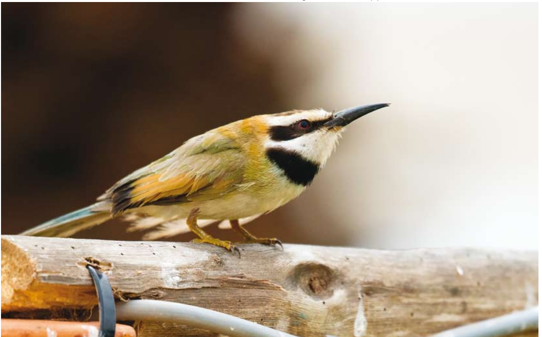
203 White-throated Bee-eater / Witkeelbijeneter Merops albicollis , Dakhla bay, Western Sahara, Morocco, 2 March 2017