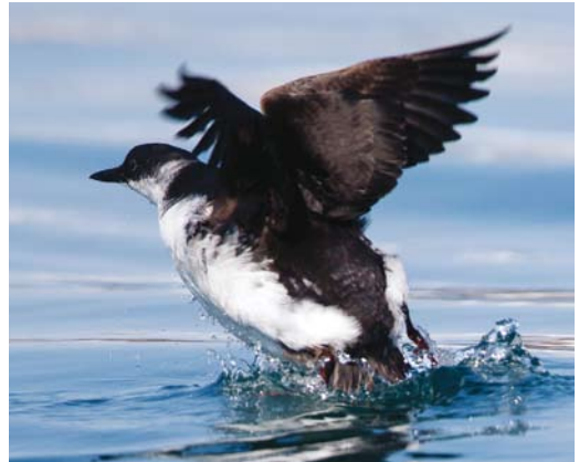
129-130 Pigeon Guillemot / Duifzeekoet Cepphus columba , off Hokkaido, Japan, 19 February 2016 ( Beatrice Henricot ). Presumably subspecies Kuril Guillemot (Snow's Guillemot) C c snowi . 131 Pigeon Guillemots / Duifzeekoeten Cepphus columba , off Hokkaido, Japan, 19 February 2016 ( Beatrice Henricot ). Right bird presumably Kuril Guillemot (Snow's Guillemot) C c snowi . 132-133 Pigeon Guillemot / Duifzeekoet Cepphus columba , adult, moulting into breeding plumage, Ochiishi, Hokkaido, Japan, 27 February 2016 ( Yann Muzika ). Presumably subspecies Kuril Guillemot (Snow's Guillemot) C c snowi .