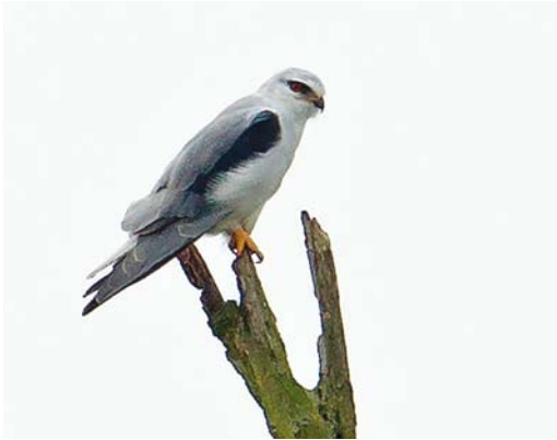
8 Black-winged Kite / Grijsze Wouw Elanus caeruleus caeruleus , Geel-Mosselgoren, Antwerpen, Belgium, 7 June 2016