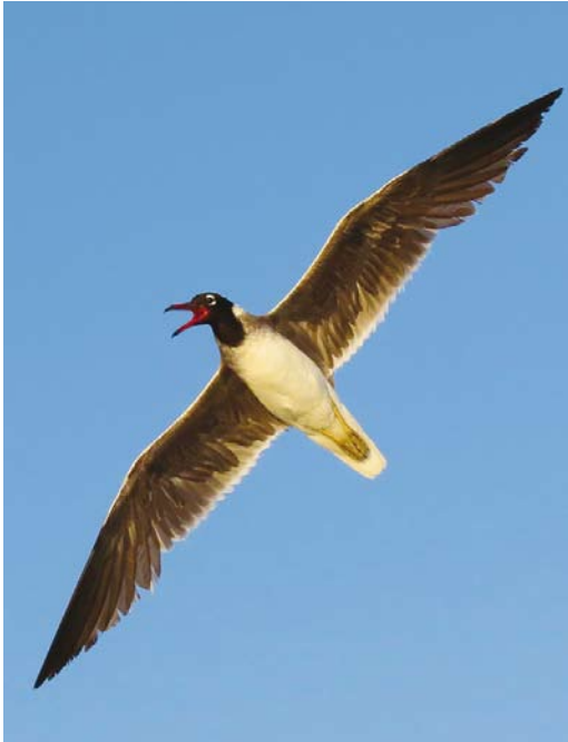
12 White-eyed Gull / Witoogmeeuw Larus leucophthalmus , adult summer, off Hurghada, Egypt, 12 August 2014 (Mohamed I Habib). Protecting breeding area.

(Cramp & Simmons 1977) and 1500-2000 pairs on islands off Hurghada and at the mouth of the Gulf of Suez, as estimated in 1983 and 1984 (Jennings et al 1985). Quantitative information is lacking on the number of individuals breeding on islands further south (Goodman & Meininger 1989). Jennings et al (1985) estimated that 30% of the world's population breeds on islands at the mouth of the Gulf of Suez. Baha El Din (1999) estimated the population in the Egyptian Red Sea at 10 000 indi-