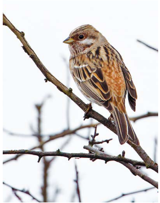
93 Blauwstaart / Red-flanked Bluetail Tarsiger cyanurus , eerstejaars, Berkheide, Zuid-Holland, 6 december 2016 94 Witkopgors / Pine Bunting Emberiza leucocephalos , mannetje, Camping Loodmansduin, Texel, Noord-Holland, 8 januari 2017 95 Woestijntapuit / Desert Wheatear Oenanthe deserti , eerste-winter mannetje, Paal 29, Texel, Noord-Holland, 6 november 2016