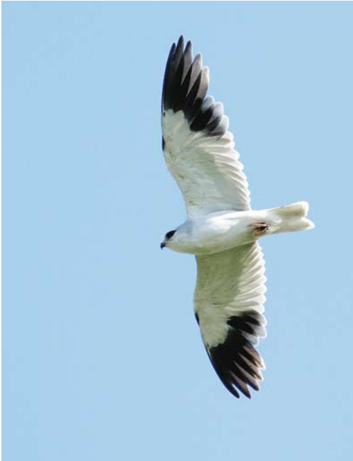
6 Black-winged Kite / Grijze Wouw Elanus caeruleus caeruleus , Zichow, Brandenburg, Germany, 29 June 2016 (Zbigniew Kajzer)