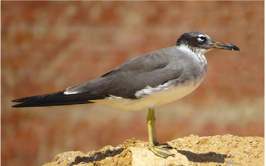
28 White-eyed Gull / Witoogmeeuw Larus leucophthalmus , second-summer type, Hurghada, Egypt, 10 June 2014 (Mohamed I Habib)