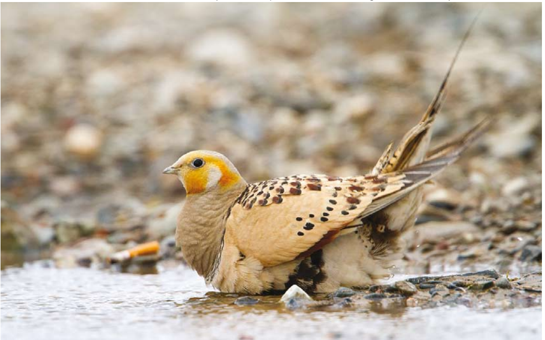
49 Pallas's Sandgrouse / Steppehoen Syrrhaptes paradoxus , male, between Zaysan lake and Tarbagatai mountains, East Kazakhstan, Kazakhstan, 25 May 2014. Collecting water with belly-feathers.