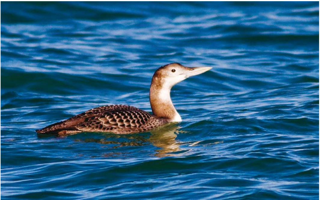
55 Yellow-billed Loon / Geelsnavelduiker Gavia adamsii , first-winter, Balatonföldvár, Balaton lake, Hungary, 3 December 2016 (József Mészáros)