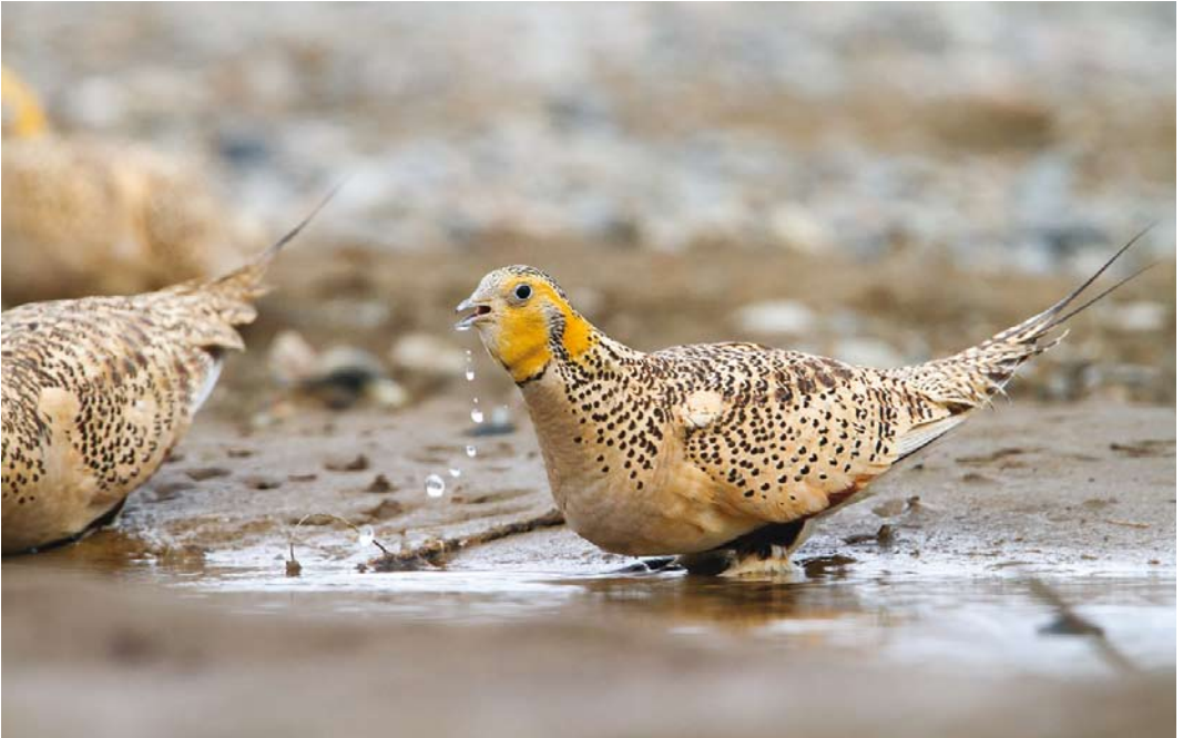
48 Pallas's Sandgrouse / Steppehoen Syrrhaptes paradoxus , female, between Zaysan lake and Tarbagatai mountains, East Kazakhstan, Kazakhstan, 25 May 2014