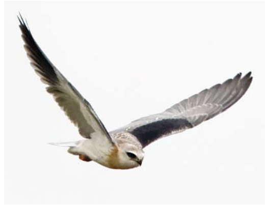
9 Black-winged Kite / Grijsze Wouw Elanus caeruleus caeruleus , juvenile, Maashorst, Noord-Brabant, Netherlands, 4 August 2015 ( Michel Veldt )

Africa is caeruleus , although records of vociferus in Egypt cannot be ruled out.