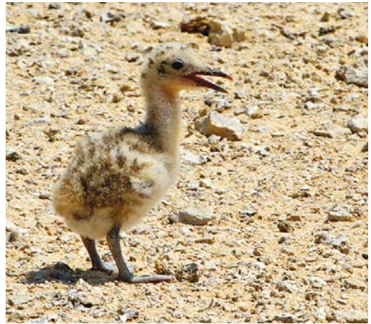
14 Eggs and pullus of White-eyed Gull / Witoogmeeuw Larus leucophthalmus , off Hurghada, Egypt, 18 June 2013 (Mohamed I Habib). Typical nest with three eggs; note asynchronous hatching. 15 Clutch of White-eyed Gull / Witoogmeeuw Larus leucophthalmus , off Hurghada, Egypt, 8 June 2014 (Mohamed I Habib). Nest containing high number of five eggs, presumably laid by two females in same nest. 16 White-eyed Gulls / Witoogmeeuwen Larus leucophthalmus , off Hurghada, Egypt, 21 June 2012 (Mohamed I Habib). Chicks at sea shore during hot day. 17 White-eyed Gull / Witoogmeeuw Larus leucophthalmus , off Hurghada, Egypt, 26 August 2015 (Mohamed I Habib). Two-week old chick.

At Umm Gawish, the distance between individual nests was 0.5-5 m, while at Gysom individual nests were much further, 50-100 m, apart. On all eight islands, White-eyed Gulls defended the eggs or young by aggressively attacking any intruders and flying around nervously (plate 12). This behaviour was also noticed during Arabian surveys of breeding seabirds (Jennings 2010). Both male and female built the nest, while the female occupied the nest before laying eggs. Clutch size was one to three eggs on most islands; most commonly, the clutch consisted of three eggs (plate 14). A nest containing five eggs on Umm Gawish was exceptional and may have been the result of two females laying in the same nest (plate 15). Eggs were detected from the second week of May. Nests were