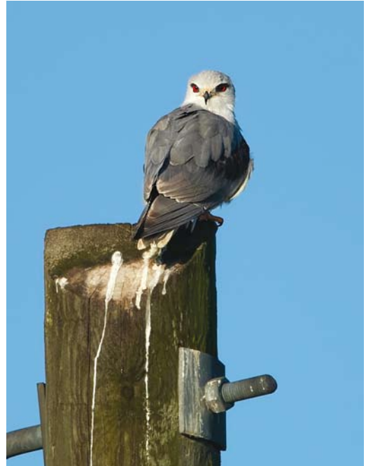
7 Black-winged Kite / Grijze Wouw Elanus caeruleus caeruleus , Zichow, Brandenburg, Germany, 3 July 2016

August and November (Neil Morris in litt). From the photographs available it is clear that, as expected, they were all vociferus .