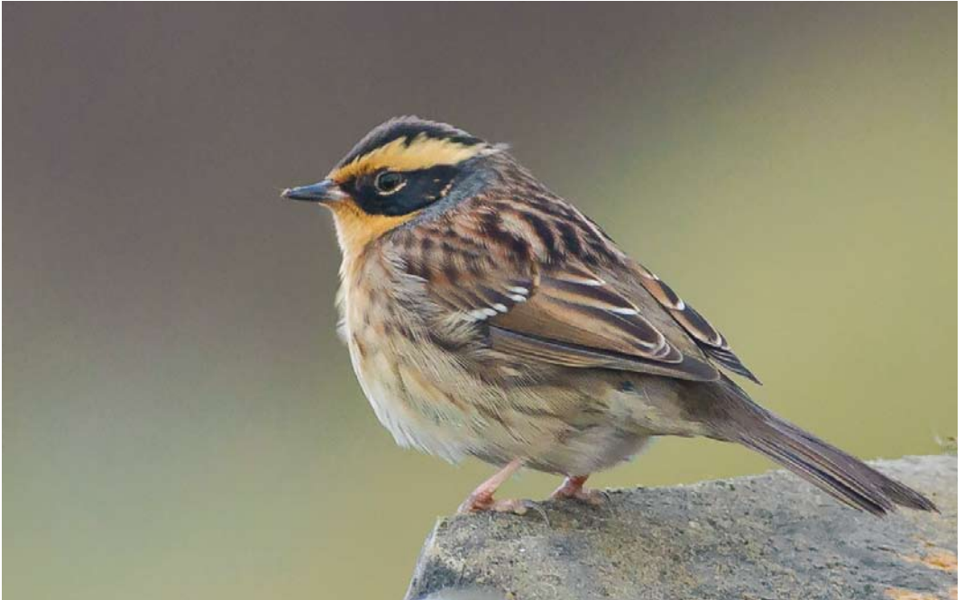
78 Siberian Accentor / Bergheggenmus Prunella montanella , Hirtshals havn, Nordjylland, Denmark, 7 January 2017 ( Sander Bot )