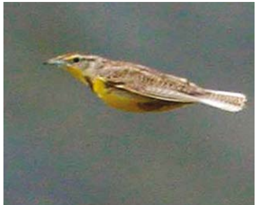
38-43 Western Meadowlark / Geelkaakweidespreeuw Sturnella neglecta , Provideniya, Chukotka, Russia, 2 July 2004