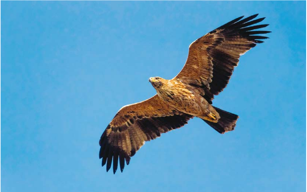
54 Spanish Imperial Eagle / Spaanse Keizerarend Aquila adalberti , immature, Lago di Massaciuccoli, Toscana, Italy, 9 January 2017 (Daniele Occhiato)