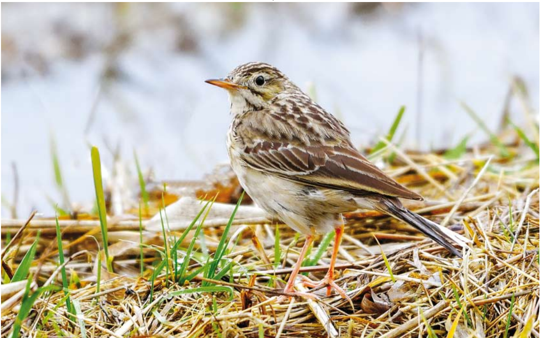
79 Blyth's Pipit / Mongoolse Pieper Anthus godlewskii , first-winter, Brabantse Biesbosch, Noord-Brabant, Netherlands, 15 January 2017