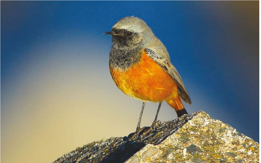
76 Eastern Black Redstart / Oosterse Zwarte Roodstaart Phoenicurus ochruros phoenicuroides , first-winter male, Torness, East Lothian, Scotland, 4 December 2016 (Sam Northwood)