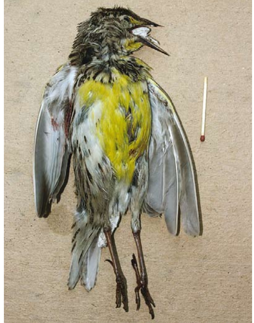
44-45 Western Meadowlark / Geelkaakweidespreeuw Sturnella neglecta , Provideniya, Chukotka, Russia, 2 July 2004 (Phil Palmer)

swapped it for a nice red Spoon-billed Sandpiper on that trip.