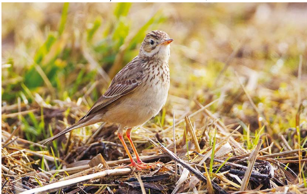
214 Mongoolse Pieper / Blyth's Pipt Anthus godlewskii , eerste-winter, Brabantse Biesbosch, Noord-Brabant, 20 januari 2017 (Martin van der Schalk)