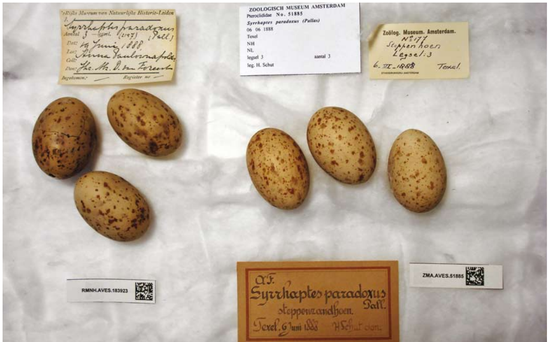
107 Legsels van Steppehoer / Pallas's Sandgrouse Syrrhaptes paradoxus (verzameld op Texel, Noord-Holland, op 6 juni 1888 (rechts) en te Anna-Paulownapolder, Noord-Holland, op 19 juni 1888), Naturalis Biodiversity Center, Leiden, Zuid-Holland, 13 november 2013