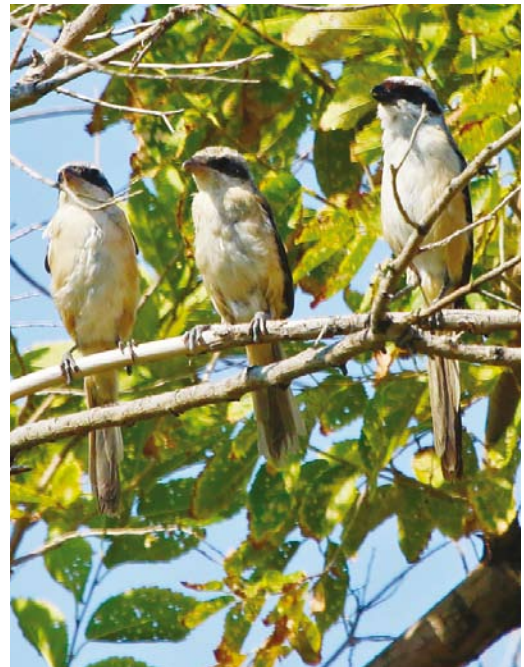
146 Long-tailed Shrikes / Langstaartklauwieren Lanius schach erythronotus , adult with juveniles, Victory Park, Atyrau, Kazakhstan, 6 August 2016

The adults were easily distinguished from other shrike species by the bright, contrasting colours and the very long tail (cf Lefranc & Worfolk 1997, del Hoyo et al 2008). The photographs show all plumage characters typical for this species: 1 grey crown and nape; 2 grey buff-tinged mantle; 3 bright buff back, rump and uppertail-coverts; 4 black forehead, lore and ear-coverts forming black mask; 5 faint off-white supercilium; 6 off-white throat, breast and belly with buff tinge (most prominent on flank and undertail-coverts); 7 brownish-black wing; 8 almost black wing-coverts; 9 dark brown primaries with white base,