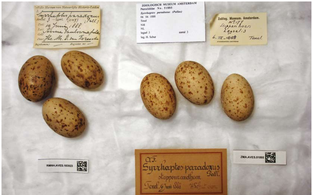
107 Legsels van Steppenhoen / Pallas's Sandgrouse Syrnhaptes paradoxus (verzameld op Texel, Noord-Holland, op 6 juni 1888 (rechts) en te Anna-Paulownapolder, Noord-Holland, op 19 juni 1888), Naturalis Biodiversity Center, Leiden, Zuid-Holland, 13 november 2013