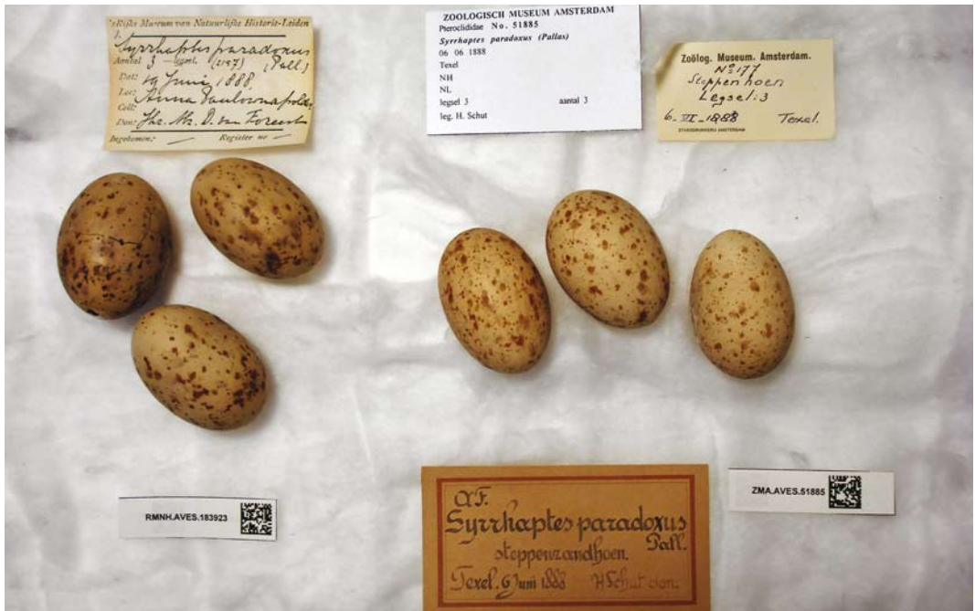
107 Legsels van Steppenhoen / Pallas's Sandgrouse Syrnhaptes paradoxus (verzameld op Texel, Noord-Holland, op 6 juni 1888 (rechts) en te Anna-Paulownapolder, Noord-Holland, op 19 juni 1888), Naturalis Biodiversity Center, Leiden, Zuid-Holland, 13 november 2013