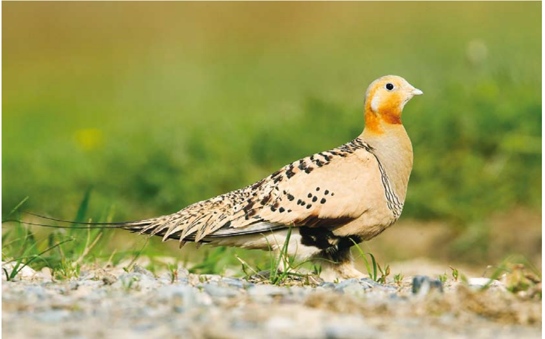
46 Pallas's Sandgrouse / Steppehoen Syrhaptes paradoxus , male, between Zaysan lake and Tarbagatai mountains, East Kazakhstan, Kazakhstan, 25 May 2014