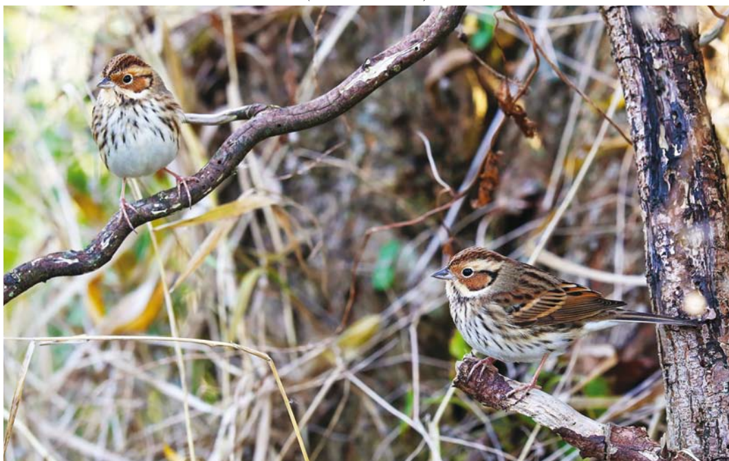
100 Dwerggorzen / Little Buntings Emberiza pusilla , Noordwijk, Zuid-Holland, 30 november 2016