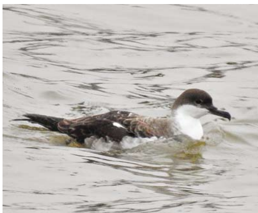
65 Harlequin Duck / Harlekijnneend Histrionicus histrionicus , first-winter, Irtysk river, Öskemen, East Kazakhstan, Kazakhstan, 18 December 2016 66 Asian White-winged Scoter / Aziatische Grote Zee-eend Melanitta deglandi stejnegeri , adult male, Santa Pola, Alicante, Valencia, Spain, 9 December 2016 67 Yellow-billed Loon / Geelsnavelduiker Gavia adamsii , first-winter, Diemelsee, Hessen, Germany, 20 December 2016 68 Great Shearwater / Grote Pijlstormvogel Puffinus gravis , Hamburg-Altona, Hamburg, Germany, 18 December 2016

The fourth for Belgium was photographed at Mur de Lixhe, Liège, on 27-31 December and 4 January. If accepted, a first-winter flying past Asserbo Strand and Kikhavn, Sjælland, on 30 December will be the second for Denmark. Apparently, an Audouin's Gull L. audouinii at Bel Air on 28 October was the first for Guinea. A first-year at Brickfields, Trinidad, Trinidad & Tobago, on 10-12 December was the first for the New World. The number of breeding pairs on Vendicari, Sicily, increased from the first in 2010 to 130 in 2016 ( Avocetta 40: 71-76, 2016). Up to four first-winter Relict Gulls L. relictus on the ice at Gulpo on 26-27 November constituted the second record for North Korea (the first concerned five individuals in the same area in late March 2014). An adult Ring-billed Gull L. delawarensis photographed at the eastern Caspian coast of Aktau, Mangystau, on 7 January 2015 and again on 5 November 2015 and 3 and 29 December