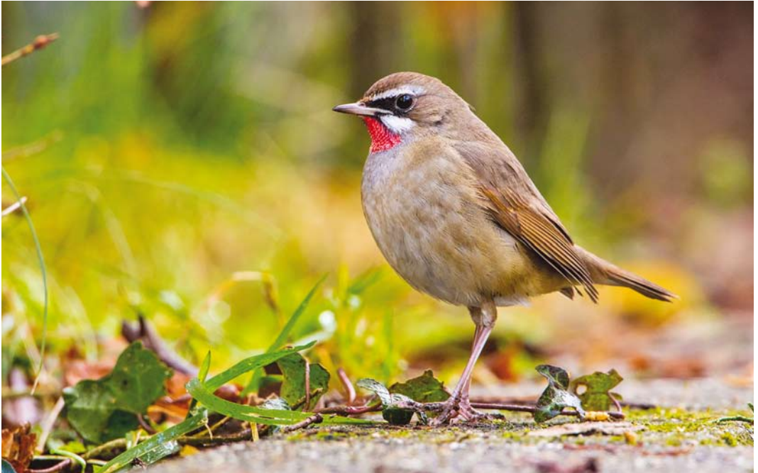
30 Roodkeelnachtegal / Siberian Rubythroat Calliope calliope , eerste-winter mannetje, Hoogwoud, Noord-Holland, 20 januari 2016 ( Alex Bos )