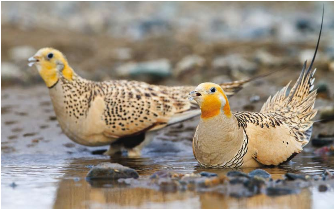
47 Pallas's Sandgrouse / Steppehoenders Syrhaptes paradoxus , male (right) and female, between Zaysan lake and Tarbagatai mountains, East Kazakhstan, Kazakhstan, 25 May 2014 ( Ralph Martin )