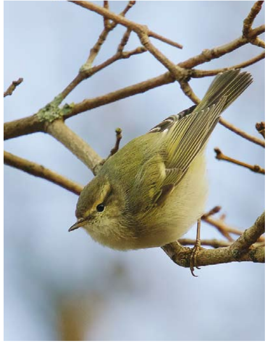
96 Vermoedelijke Siberische Braamsluiper / presumed Siberian Lesser Whitethroat Sylvia althaea blythi , Katwijk aan Zee, Zuid-Holland, 1 december 2016 ( René van Rossum ) 97 Humes Bladkoning / Hume's Leaf Warbler Phylloscopus humei , Noordwijkerhout, Zuid-Holland, 6 januari 2017 ( Martin van der Schalk ) 98 Veldrietzanger / Paddyfield Warbler Acrocephalus agricola , eerste-winter, Zwanenwater, Noord-Holland, 5 november 2016 ( Arnoud B van den Berg )