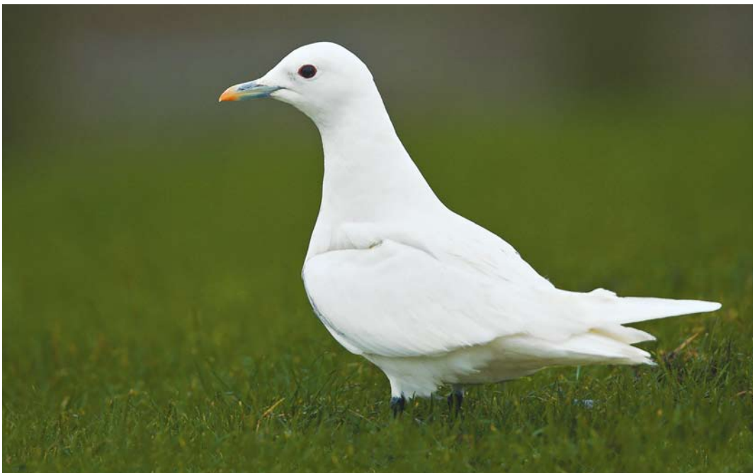
53 Ivory Gull / Ivoormeeuw Pagophila eburnea , adult, Hallig Hooge, Schleswig Holstein, Germany, 31 December 2016

ably the first for Korea. An adult male was seen c 120 km inland east of Le Mans, Sarthe, France, on 16 January. The second Asian White-winged Scoter M deglandi stepnegeri for Spain was an adult photographed at Santa Pola, Alicante, Valencia, on 6-20 December (the first was in December 2011). The previous winter's American White-winged Scoter M d deglandi was back at Keilavík, Iceland, on 11 January. An adult male Black Scoter M americana stayed off Goswick, Northumberland, England, from 29 December through mid-January. For the third consecutive winter, the male off Rossbeigh, Kerry, Ireland, returned on 25 October and remained into January. The fifth Bufflehead Bucephala albeola for Iceland at Sandgerði from 9 November stayed into January. In Scotland, the male Hooded Merganser Lophodytes cucullatus from Kilbirnie Loch, Ayrshire, in October-November was relocated at Lochwinnoch, Clyde, where it stayed from December through mid-January. Another was seen on Terceira, Azores, on 16 December. A Red-breasted Merganser Mergus serrator at Rajaveli lake, Vasai, Palghar, Maharashtra, on 23 December was the first for India. A first-winter Harlequin Duck Histrionicus histrionicus photographed on Irtysh river at Öskemen, East Kazakhstan, on 13-20 December was the first for Kazakhstan and Central Asia. In China, a record