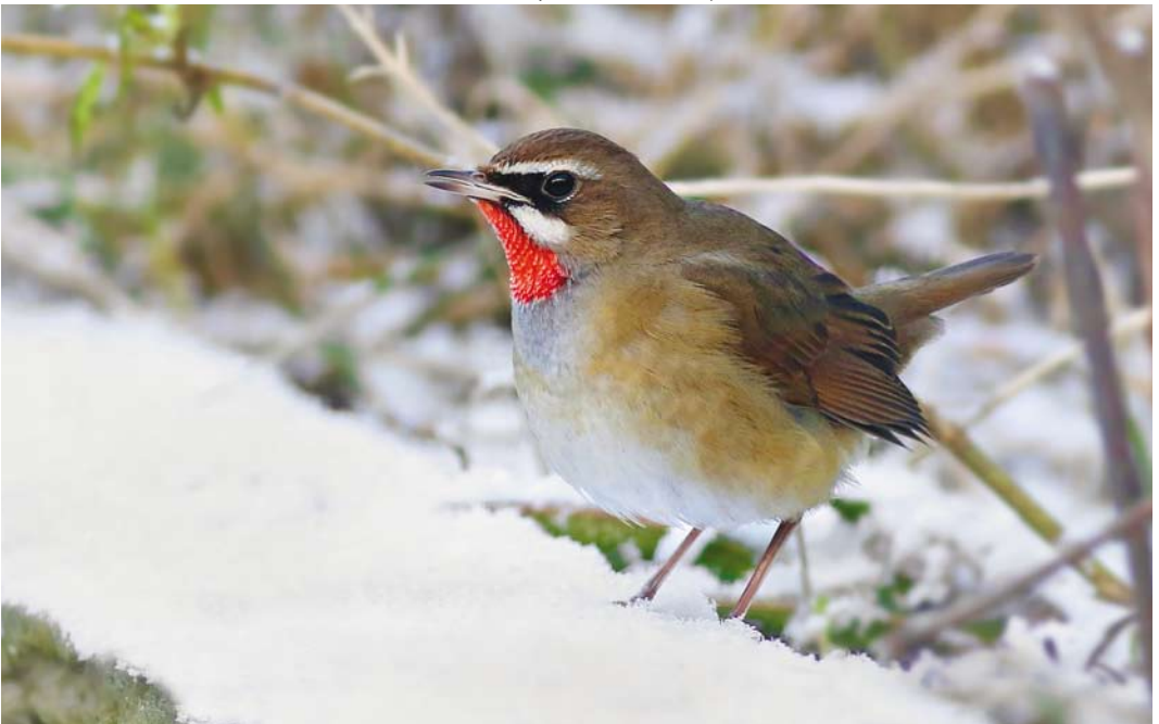
31 Roodkeelnachtegal / Siberian Rubythroat Calliope calliope , eerste-winter mannetje, Hoogwoud, Noord-Holland, 17 januari 2016 ( Thijs Glastra )