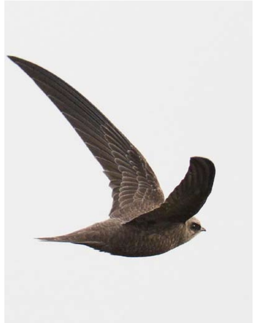
185 Grijsze Wouw / Black-winged Kite Elanus caeruleus , Kootwijkse Veld, Gelderland, 14 november 2015 ( Martin van der Schalk ) 186 Vale Gierzwaluw / Pallid Swift Apus pallidus , eerstejaars, Ijmuiden, Noord-Holland, 8 november 2015 ( Edial Dekker ) 187 Zwartbuikwaterspreeuw / Black-bellied Dipper Cinclus cinclus cinclus , Zutphen, Gelderland, 4 december 2015 ( Martin van der Schalk )