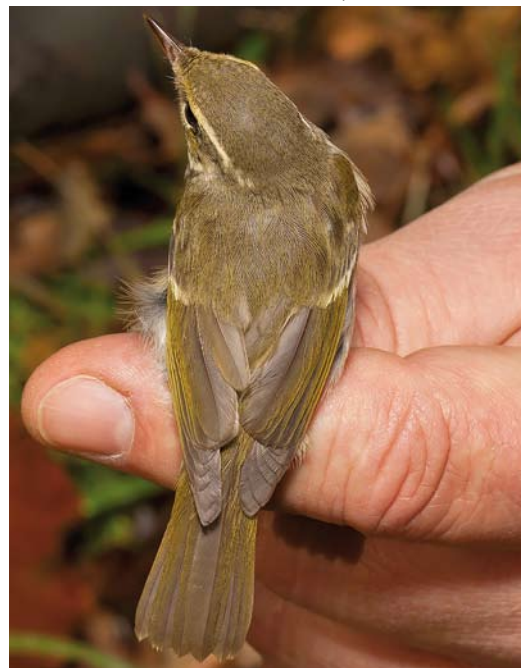
148 Swinhoes Boszanger / Two-barred Warbler Phylloscopus plumbeitarus , Kamperhoek, Flevoland, 23 november 2013

STAART Staartpennen bruin. Top van t4-6 (van binnen naar buiten genummerd) op binnenvlag met smalle lich-