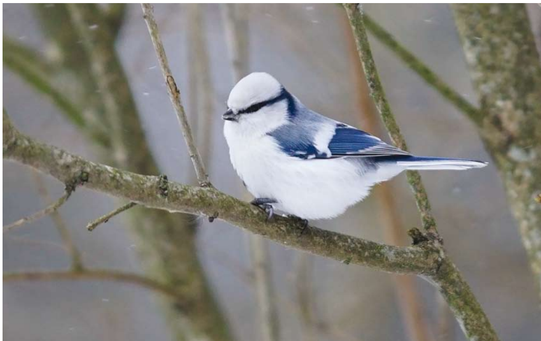
174 Azure Tit / Azuurmees Cyanistes cyanus , Helsinki, Finland, 9 January 2016 (Jan den Hertog)