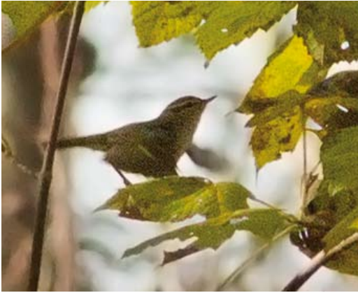
149 Swinhoes Boszanger / Two-barred Warbler Phylloscopus plumbeitarus , Kamperhoek, Flevoland, 30 november 2013 (Herman Bouman)