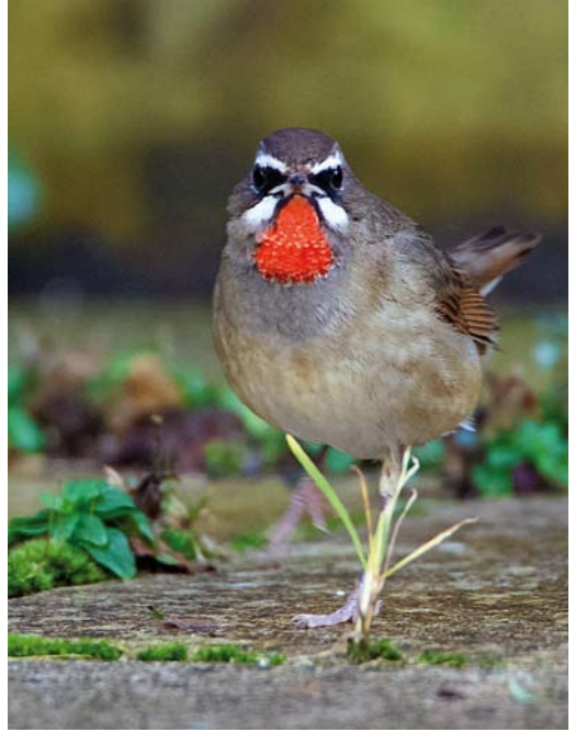
176 Arabian Golden-winged Grosbeak / Arabische Goudvleugelvink Rhynchostruthus percivali , male, Dhofar mountains, Oman, 17 November 2015 177 Siberian Rubythroat / Roodkeelnachtegaal Calliope calliope , second calendar-year male, Hoogwoud, Noord-Holland, Netherlands, 16 January 2016 178 Black-throated Accentor / Zwartkeelheggenmus Prunella atrogularis , Ventės Ragas, Šilutė, Lithuania, 24 December 2015