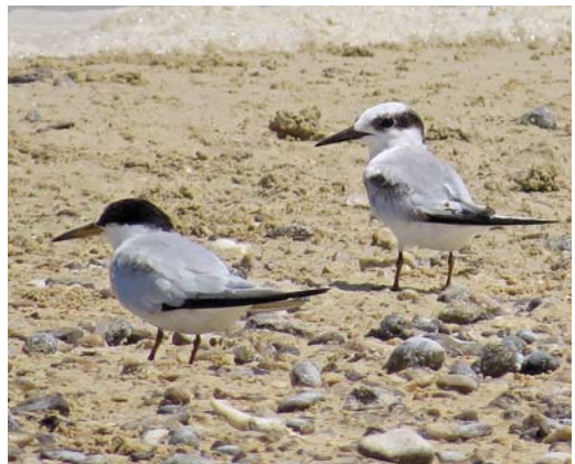
122 Saunders's Tern / Saunders' Dwergstern Sternula saundersi , Ras Sudr, South Sinai Governorate, Egypt, 22 June 2014 ( Mohamed I Habib ). Newly hatched young. 123 Saunders's Tern / Saunders' Dwergstern Sternula saundersi , Ras Sudr, South Sinai Governorate, Egypt, 5 July 2014 ( Mohamed I Habib ). Three week old juvenile. 124 Saunders's Terns / Saunders' Dwergsterns Sternula saundersi , Ras Sudr, South Sinai Governorate, Egypt, 6 July 2014 ( Mohamed I Habib ). Parent (front) with c three week old juvenile. 125 Saunders's Terns / Saunders' Dwergsterns Sternula saundersi , Ras Sudr, South Sinai Governorate, Egypt, 23 August 2014 ( Mohamed I Habib ). Parent (left) with five week old juvenile.

In 2015, on 11 June (11:00), only three pairs were found; one pair was displaying with small fish and one pair attended a nest with two eggs. On 26 June (07:30), c 35 adults were found, as well as one fledgling and four nests. Finally, on 8 August (11:30), at least c 140 and possibly more than c 60 adults and fledglings were counted, including c 50 fledglings, the highest count to date at Ras Sudr.