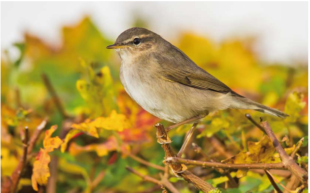
189 Bruine Boszanger / Dusky Warbler Phylloscopus fuscatus , Stavoren, Friesland, 9 november 2015 (Norbert Uhlhaas)