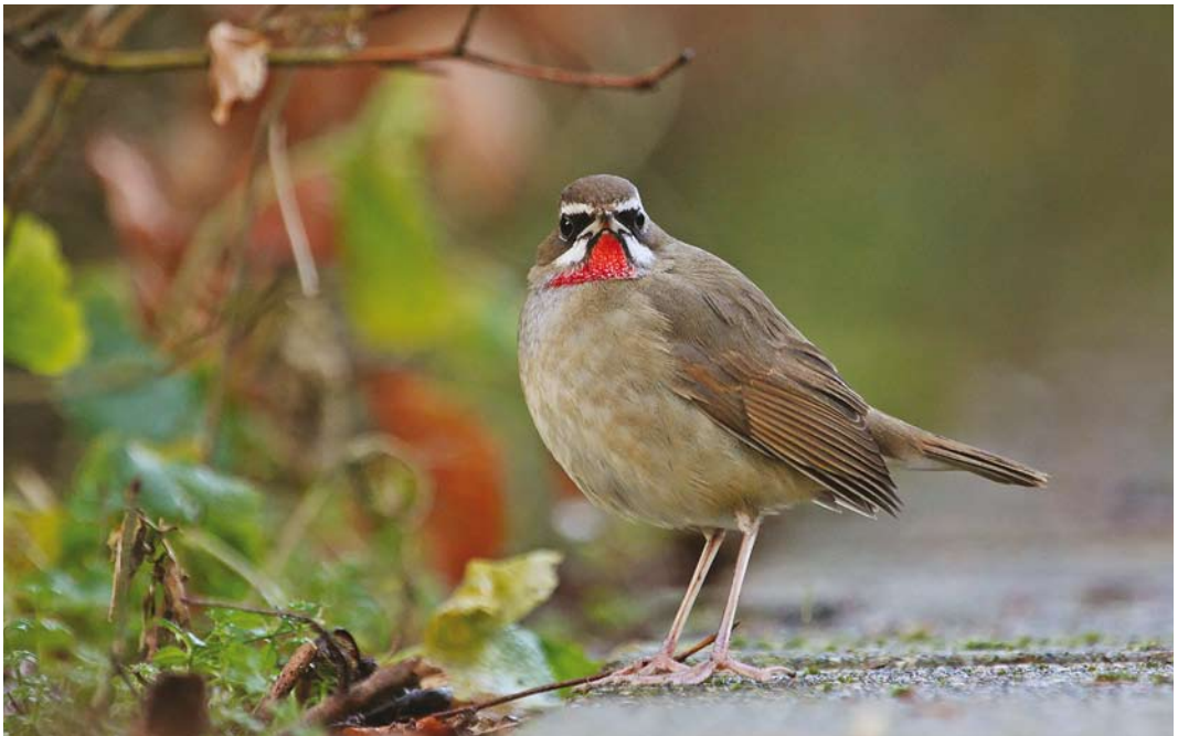
199 Roodkeelnachtegaal / Siberian Rubythroat Calliope calliope , tweede-kalenderjaar mannetje, Hoogwoud, Noord-Holland, 20 januari 2016 (Alex van der Giessen)

ne' in gang zetten. In groepen van 10 mochten de vogelaars (na betaling van hun donatie) vanuit de huiskamer kijken en zo snel mogelijk rouleren met de volgende groep; hiervoor was al het meubilair aan de kant geschoven. In de eerste twee uren konden zo enkele 100en vogelaars de vogel zien, vaak met een tweede of derde ronde als toegift. Rond 10:00 joeg een kat de Roodkeelnachtegaal de tuin uit. Vervolgens werd hij in enkele tuinen in de directe omgeving gezien alvorens terug te keren naar dé tuin. Dit patroon herhaalde zich enkele malen gedurende de dag, hoewel hij naarmate de dag vorderde vaak langer uit beeld was. In totaal zagen c 400 vogelaars hem vanuit het huis en een flink aantal in de tuinen in de omgeving. Natuurlijk trok de oploop met lange rijen vogelaars voor de deur veel bekijks van buurtbewoners en later cameraploegen van bijvoorbeeld NOS, RTL4 en RTV Noord-Holland. Kinderen uit de buurt verdienden een extra zakcent met de verkoop van chocolademelk en koffie. Van een ringetje bleek trouwens gelukkig al snel geen sprake... Op zondag 17 januari was de woning wederom opengesteld voor bezoek en herhaalde het scenario zich. Sommige bezoekers kwamen van ver, zoals uit Denemarken, Engeland of Frankrijk. De opbrengsten van beide dagen werden grotendeels bestemd voor een goed (ornithologisch) doel. De vogel is in ieder geval gemeld tot en met 23 januari en kon regelmatig worden bekeken vanaf het balkon van de bovenbuurman of in aangrenzende tuinen.