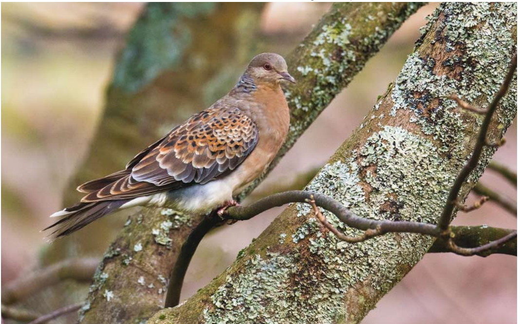
161 Rufous Turtle Dove / Meenatortel Streptopelia orientalis meena , first-winter, Scalloway, Mainland, Shetland, Scotland, 30 November 2015