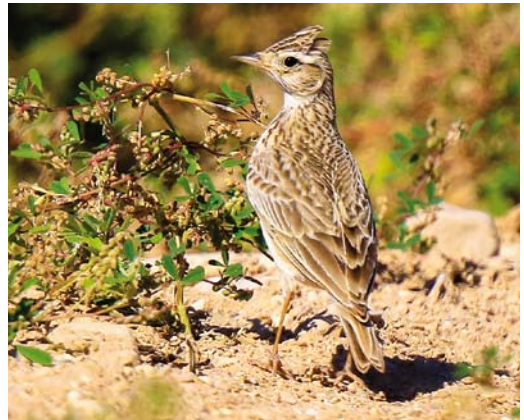
141-144 Oriental Skylark / Kleine Veldleeuwerik Alauda gulgula , Eilat, Israel, March 2015. Note overall greyish plumage with limited rufous on ear-coverts and fringes of visible primaries.

the distinctive supercilium, creating a unique front view. Another character is the rufous trailing edge to the wing, visible in flight. In Eurasian, this edge is white and, in Crested, it is not distinguishable from the colour of the rest of the wing but this character is not visible in the photographs. The rufous ear-coverts and fringes to the secondaries and inner primaries are generally also distinctive characteristics for Oriental but on the pale and worn El Gouna bird this was not very obvious. The bird flew up a few times but I did not register a sound (a buzzing call described as bzruu or bazterr is unique to Oriental ( Shirihai 1986 )).