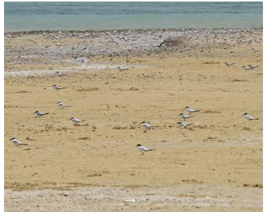
126 Saunders's Terns / Saunders' Dwergsterns Sternula saundersi , adult (left) with two juveniles, Ras Sudr, South Sinai Governorate, Egypt, 23 August 2014 (Mohamed I Habib) 127 Saunders's Terns / Saunders' Dwergsterns Sternula saundersi , adult (right) and first-winter, Ras Sudr, South Sinai Governorate, Egypt, 22 June 2014 (Mohamed I Habib) 128 Saunders's Tern / Saunders' Dwergstern Sternula saundersi , first-winter, Ras Sudr, South Sinai Governorate, Egypt, 5 July 2014 (Mohamed I Habib) 129 Saunders's Terns / Saunders' Dwergsterns Sternula saundersi , Ras Sudr, South Sinai Governorate, Egypt, 23 August 2014 (Mohamed I Habib). Roosting adults and fledglings at northern lagoon.

from the wind. Males start to display by moving the head from side to side while holding a small fish and offering the fish to the female. Aerial display is performed at the beginning of the breeding season. The nest is a scrape or a little deeper cup-shaped depression, sometimes lined and ornamented with a small amount of shells for perfect camouflage. During the surveys, chicks stayed with the parents after hatching for the first few days for protection, feeding and shading. After hatching, especially during the first few days, parents covered chicks with sea water for cooling and shaded them from the sun. After five days, the nest was left and the chicks independently sought shade and hid from predators. On the sandbar, the