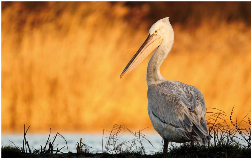
158 Dalmatian Pelican / Kroeskoppelikaan Pelecanus crispus , second calendar-year, Wierzbiczany, Kujawsko-Pomorskie, Poland, 22 December 2015