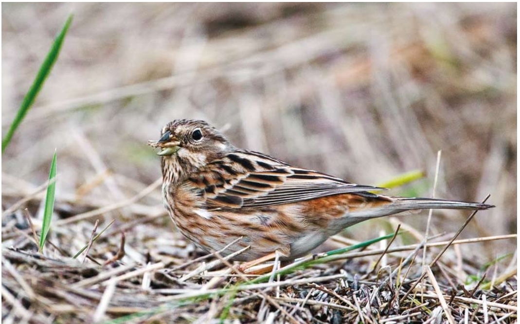
180 Pine Bunting / Witkopgors Emberiza leucocephalos , first-year female, Wilhelminadorp, Zeeland, Netherlands, 17 December 2015 ( Co van der Wardt )