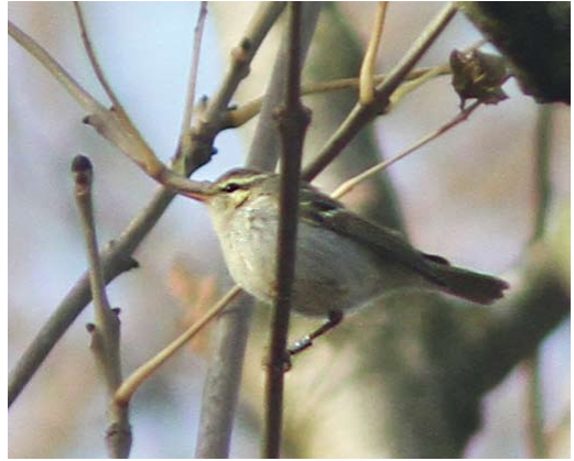
150 Swinhoes Boszanger / Two-barred Warbler Phylloscopus plumbeitarus , Kamperhoek, Flevoland, 2 december 2013

te zoom. Top van staartpennen spits, met name t3-6. NAAKTE DELEN Iris zeer donker. Bovensnavel hoornkleurig, ondersnavel heldergeel. Poot grijsbruin, tenen geelbruin met roze tinten, nagels geelachtig grijsbruin. SLEET Geheel verenkleed vers en ongesleten, inclusief hand-, arm- en staartpennen. BIOMETRIE Vleugellengte 54.5 mm. Staartlengte 37 mm. P7 (van binnen naar buiten genummerd) 43 mm, p8 41 mm. Buitenvlag van p5-8 versmald. Handpenprojectie 60% van zichtbaar deel tertials. Tarsusdikte 1.5 mm. Gewicht 7.3 g. Vetgraad 3 (Busse & Kania 1970). GELUID Twee roepjes: scherp oplopend enkellettergrepig tsiek en tweelettergrepig tju-liep , met dalende eerste lettergreep en stijgende tweede lettergreep.