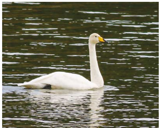
168 Naumann's Thrush / Naumanns Lijster Turdus naumanni , Budapest, Hungary, 31 December 2015 169 Eurasian Blue Tit / Pimpelmees Cyanistes caeruleus , Buskett, Malta, 11 December 2015 170 Asian Dowitcher / Aziatische Grijze Snip Limnodromus semipalmatus , with Ruffs / Kemphanen Calidris pugnax , Al Ansab lagoons, Muscat, Oman, 3 November 2015 171 Black Drongo / Koningsdrongo Dicrurus macrocercus , Salmi, Kuwait, 21 November 2015 172 American Coot / Amerikaanse Meerkoet Fulica americana , adult, Lambhagi, Reykjavík, Iceland, 5 January 2016 173 Whooper Swan / Wilde Zwaan Cygnus cygnus , adult, São Miguel, Azores, 5 December 2015