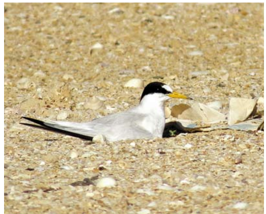
118 Saunders's Terns / Saunders' Dwergsterns Sternula saundersi , Ras Sudr, South Sinai Governorate, Egypt, 1 June 2014 (Mohamed I Habib). Male offering fish to female before mating. 119 Saunders's Terns / Saunders' Dwergsterns Sternula saundersi , Ras Sudr, South Sinai Governorate, Egypt, 1 June 2014 (Mohamed I Habib). Adults encircling each other during display. 120 Nest of Saunders's Tern Sternula saundersi , Ras Sudr, South Sinai Governorate, Egypt, 22 June 2014 (Mohamed I Habib) 121 Saunders's Tern / Saunders' Dwergstern Sternula saundersi , Ras Sudr, South Sinai Governorate, Egypt, 23 June 2014 (Mohamed I Habib). Adult on nest.