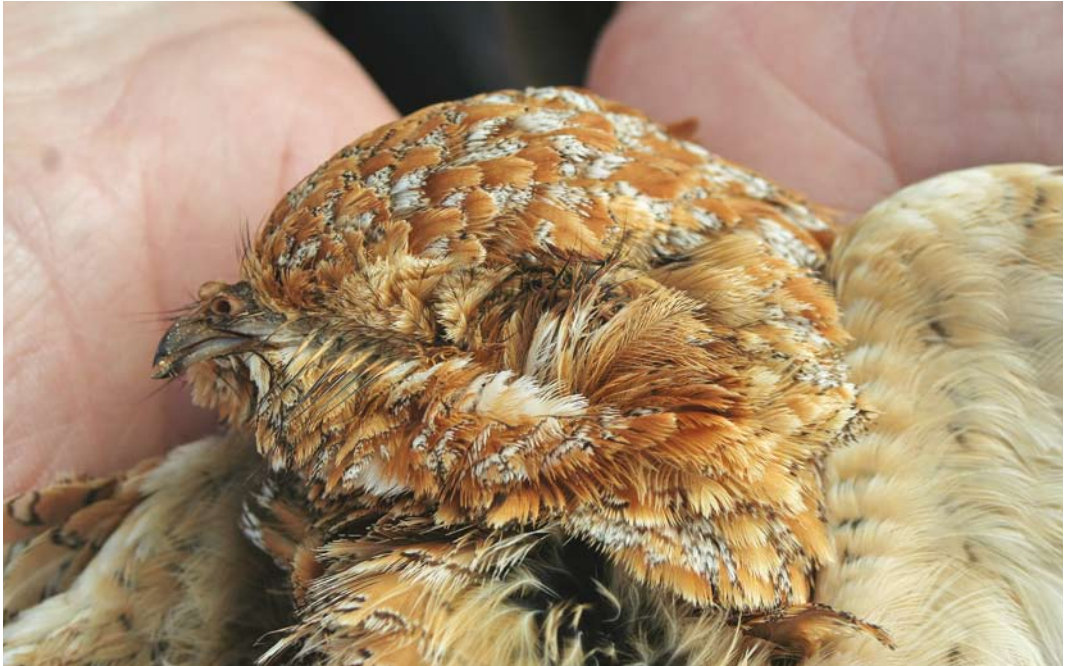
133 Golden Nightjar / Goudgele Nachtzwaluw Caprimulgus eximius , between Dakhla and Aousserd, Western Sahara, Morocco, 3 May 2015

UPPERPARTS Orange-buff, all feathers with few dull-white bands speckled with black, giving appearance of pale pearl-grey spots.