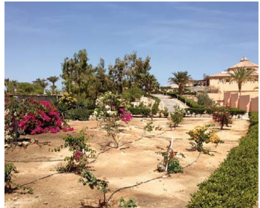
137 Oriental Skylark / Kleine Veldleeuwerik Alauda gulgula , El Gouna, Al Bahr al Ahmar, Egypt, 28 March 2012 (Edwin Winkel). Short primary projection, short tail, large unmarked loreal patch and long and slender bill typical for this species. 138 Oriental Skylark / Kleine Veldleeuwerik Alauda gulgula , El Gouna, Al Bahr al Ahmar, Egypt, 28 March 2012 (Edwin Winkel). Rufous ear-coverts and fringes of secondaries and inner primaries are normally good indications for Oriental but not very distinctive on this pale and worn bird. 139 Oriental Skylark / Kleine Veldleeuwerik Alauda gulgula , El Gouna, Al Bahr al Ahmar, Egypt, 27 March 2012 (Edwin Winkel). Nearly unmarked throat and broad supercilium fit Oriental. White belly and whitish outer tail-feathers could refer to subspecies A g ihamarum or A g inopinata . 140 Mövenpick Hotel, El Gouna, Al Bahr al Ahmar, Egypt, 22 March 2012 (Edwin Winkel). This sandy and rocky patch with flowers was exclusive habitat of Oriental Skylark Alauda gulgula in March 2012.

ish base to lower mandible. Leg fleshy-pink to yellow. MOULT & WEAR Tertiaries rather worn. SOUND Not registered.