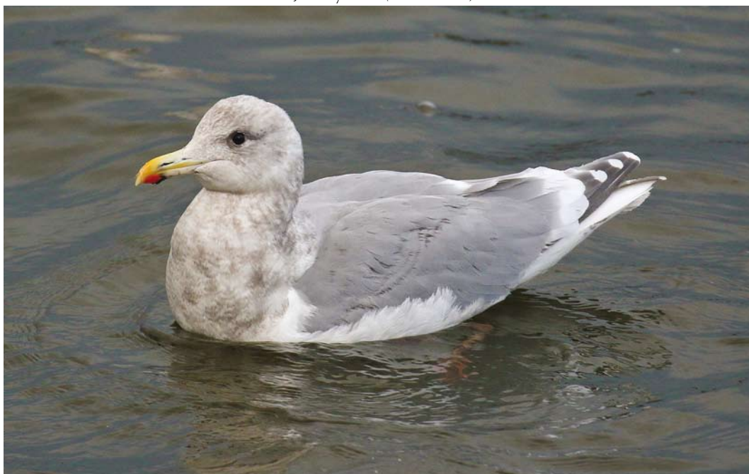
155 Glaucous-winged Gull / Beringmeeuw Larus glaucescens , adult, Castletownbere, Cork, Ireland, 3 January 2016 (Tom Shevlin)