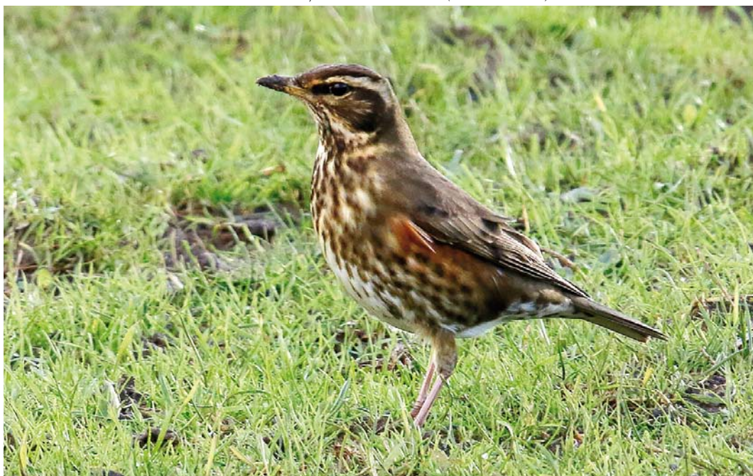
191 IJslandse Koperwiek / Icelandic Redwing Turdus iliacus coburni , eerstejaars, Westergeest, Texel, Noord-Holland, 22 november 2015 ( Eric Menkveld )