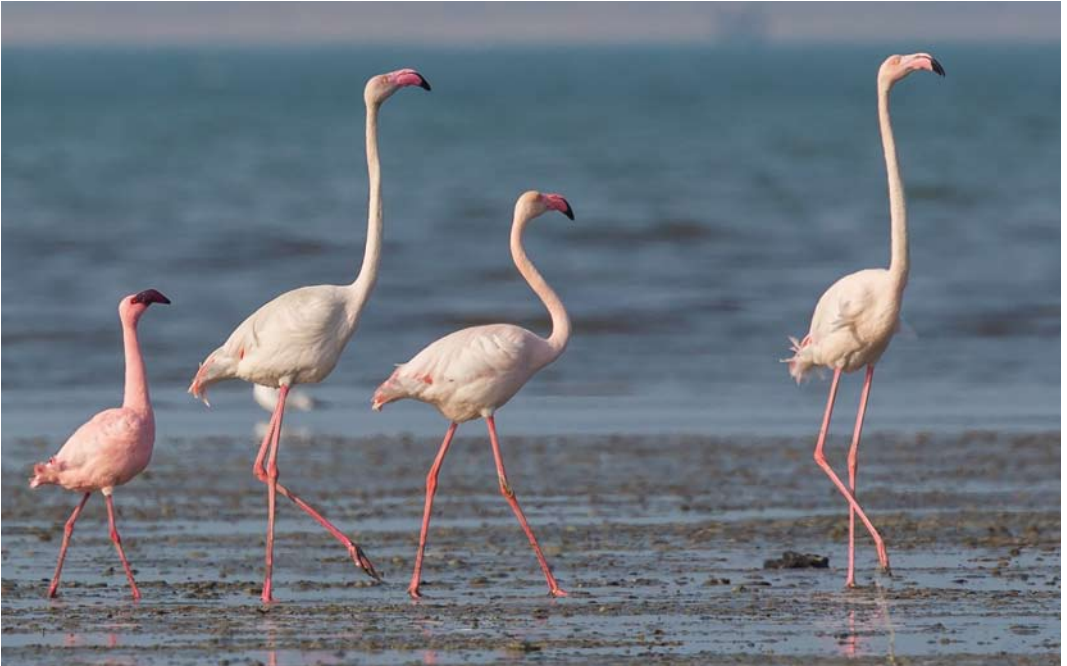
156 Lesser Flamingo / Kleine Flamingo Phoenicopterus minor , adult, with Greater Flamingos / Flamingo's P roseus , adults, Sulaibikhat bay, Kuwait, 25 December 2015 ( AbdulRahman Al-Sirhan )