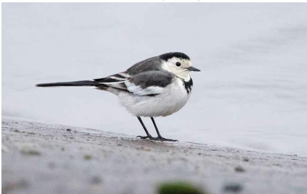
175 Amur Wagtail / Amoerkwikstaart Motacilla leucopsis , first-winter male, Kujala, Päijät-Häme, Finland, 27 November 2015 (Petri Koivisto)