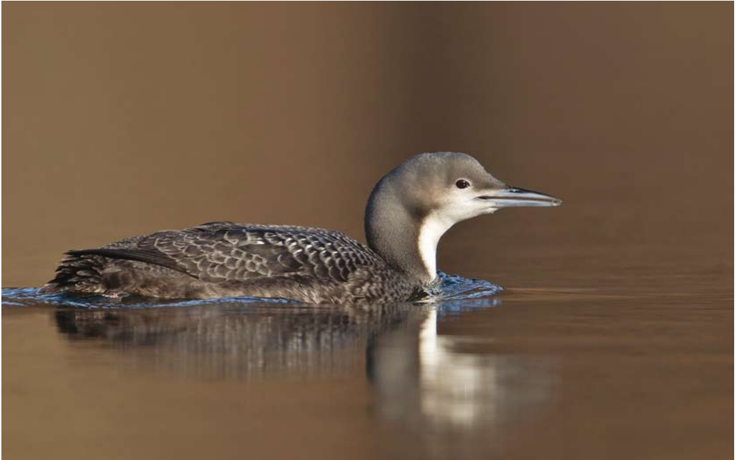
152 Pacific Loon / Pacifische Parelduiker Gavia pacifica , first-winter, Silvaplannersee, Graubünden, Switzerland, 22 December 2015 (Stefan Wassmer)