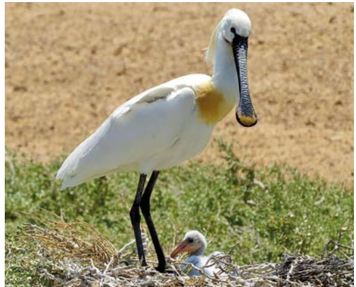
109 Nest of Red Sea Spoonbill Platalea leucorodia archeri , Big Magawish, Red Sea Governorate, Egypt, 8 June 2014 (Mohamed I Habib). Nest used in successive years. 110 Red Sea Spoonbills / Rode-Zeelepelaars Platalea leucorodia archeri , Big Magawish, Red Sea Governorate, Egypt, 8 June 2014 (Mohamed I Habib). Birds near two different types of nests, one on top of bush and one on sandy dune. 111 Nest of Red Sea Spoonbill Platalea leucorodia archeri , Ashrafi, Red Sea Governorate, Egypt, 12 June 2014 (Mohamed I Habib) 112 Red Sea Spoonbills / Rode-Zeelepelaars Platalea leucorodia archeri , adult and chick, Ashrafi, Red Sea Governorate, Egypt, 12 June 2014 (Mohamed I Habib). Parent standing over chick to protect it from summer heat.

pelago with a sandy beach at the southern part. Spoonbills were breeding at the western part of the island, where some Nitrarea ritosa bushes were growing within a small lagoon. This lagoon fills with water during high tide and empties during low tide. Big Magawish (27°09'42.32"N, 33°52'14.38"E) is one of the main islands for diving and tourism situated in front of Hurghada and is protected by law. It has a sandy beach at the south-eastern part. The small colony of spoonbills was located in the north-eastern part where some small N. ritosa shrubs are growing. Shawareet (24°21'29.1"N, 35°23'46.3"E) is part of the Hamata archipelago and has a small sandy beach