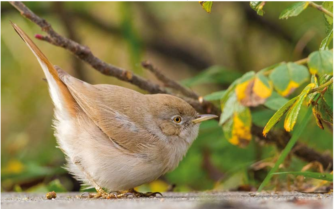
182 Woestijngasmus / Asian Desert Warbler Sylvia nana , West-Terschelling, Terschelling, Friesland, 14 november 2015 (Jaap Denee)