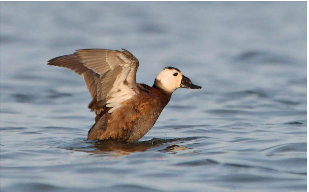
157 White-headed Duck / Witkopeend Oxyura leucocephala , adult male, Skrunda, Latvia, 13 October 2015 ( Ainars Mankus ) cf Dutch Birding 37: 403, 2015