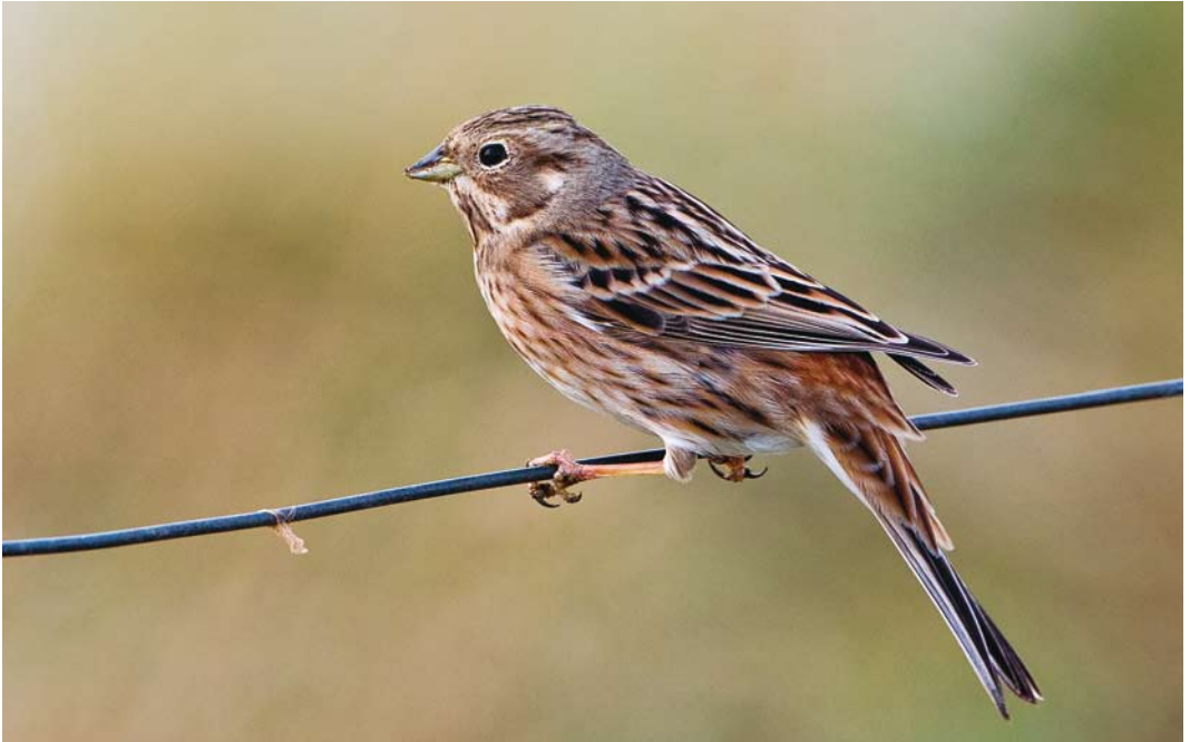
181 Witkopgors / Pine Bunting Emberiza leucocephalos , eerstejaars vrouwtje, Wilhelminadorp, Zeeland, 17 januari 2016 (Co van der wardt)