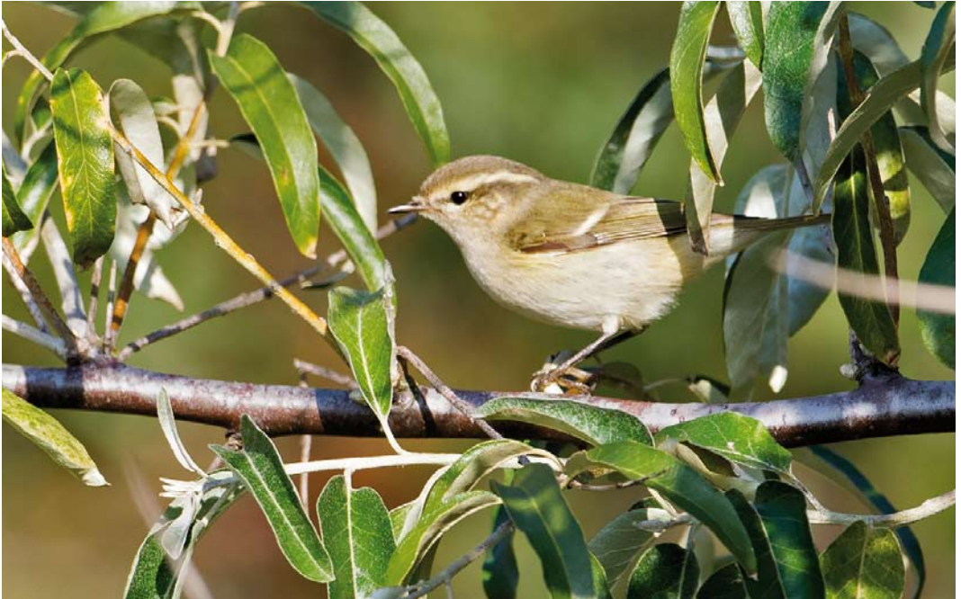
188 Humes Bladkoning / Hume's Leaf Warbler Phylloscopus humei , Stuifdijk, Maasvlakte, Zuid-Holland, 1 november 2015 (Alex Bos)