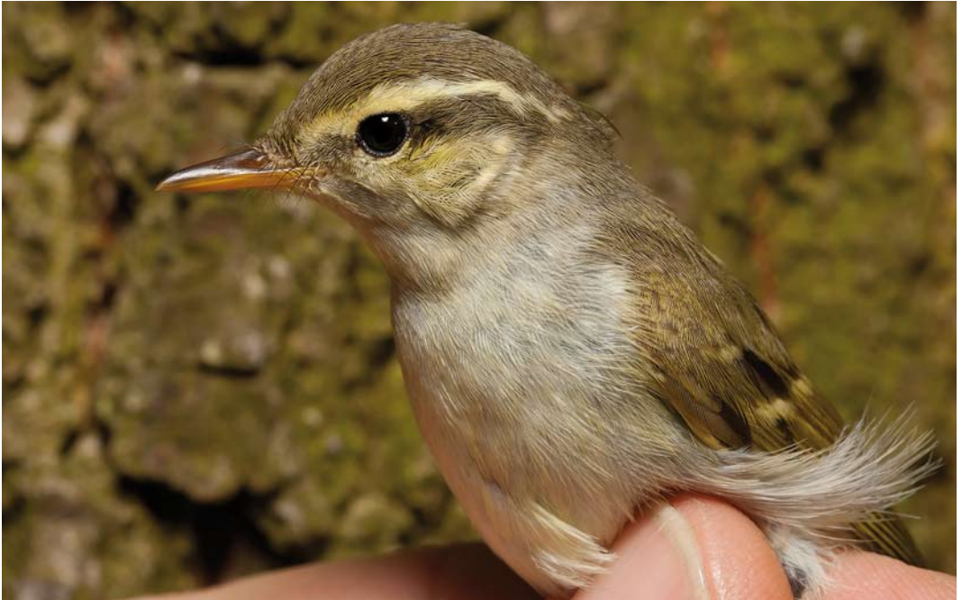
146-147 Swinhoes Boszanger / Two-barred Warbler Phylloscopus plumbeitarsus , Kamperhoek, Flevoland, 23 november 2013 (Mervyn Roos)