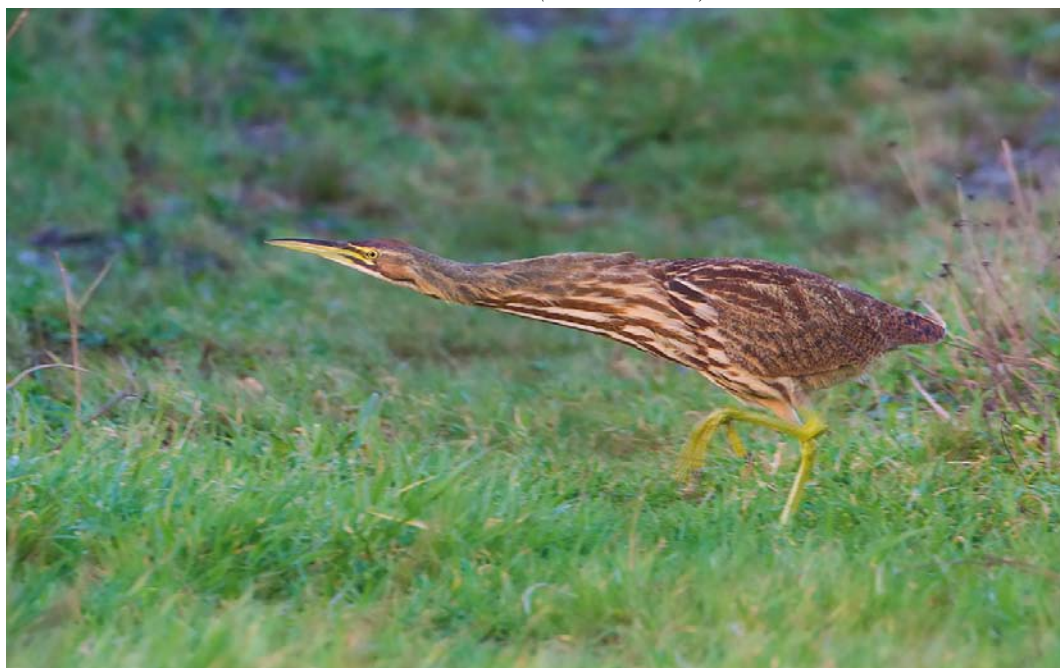
159 American Bittern / Noord-Amerikaanse Roerdomp Botaurus lentiginosus , first-year, Castlefreke, Cork, Ireland, 8 December 2015 ( David Monticelli )