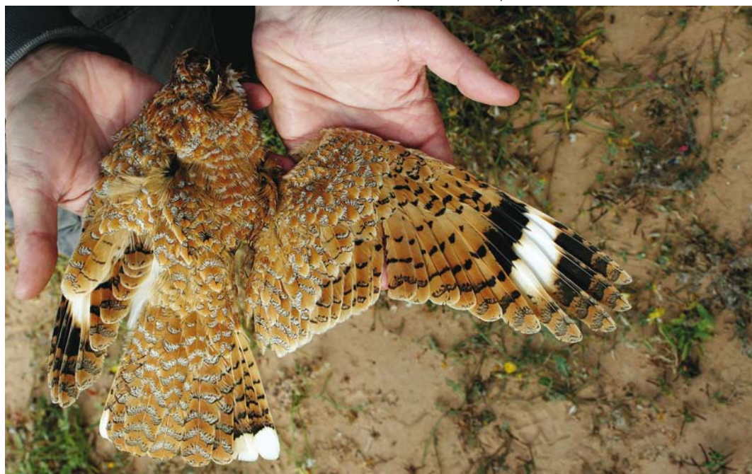
130 Golden Nightjar / Goudgele Nachtzwaluw Caprimulgus eximius , between Dakhla and Aousserd, Western Sahara, Morocco, 3 May 2015

HEAD White patch on throat and throat side, poorly to prominently visible depending on position of feathers; with ruffled feathers, shape of patch not well visible. White patch divided into central patch and two side patches.