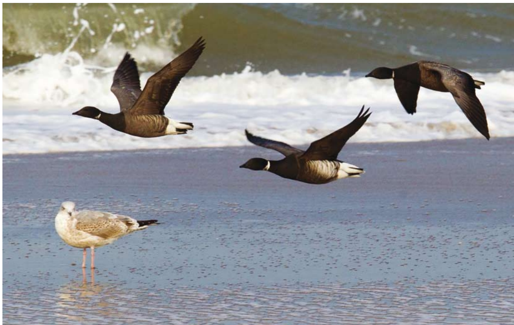
183 Zwarte Rotgans / Black Brant Branta nigricans , adult, met Rotganzen / Black-bellied Brent Geese B. bernicla , Katwijk aan Zee, Zuid-Holland, 18 november 2015