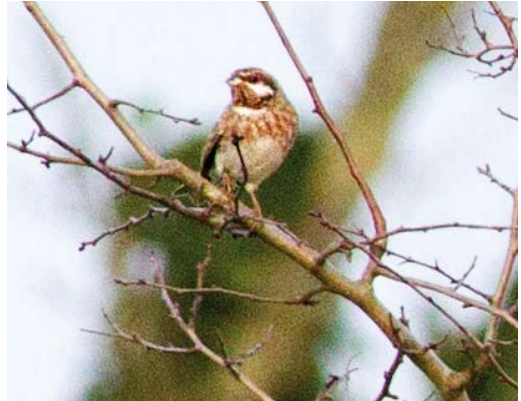
193 Witkopgors / Pine Bunting Emberiza leucocephalos , mannetje, Broekhuizen, Limburg, 2 december 2015

22 november tot in januari in en rond Amsterdam, Noord-Holland. Ook werden ten minste 10 Grote Burge-meesters L hyperboreus gemeld; een vogel vanaf 15 december in Scheveningen, Zuid-Holland, trok de meeste bekijks. Een eerstejaars Witwangstern Chlidonias hybrida werd tussen 30 november en 14 december af en toe opgemerkt langs de IJmeerdijk bij Almere, Flevoland.