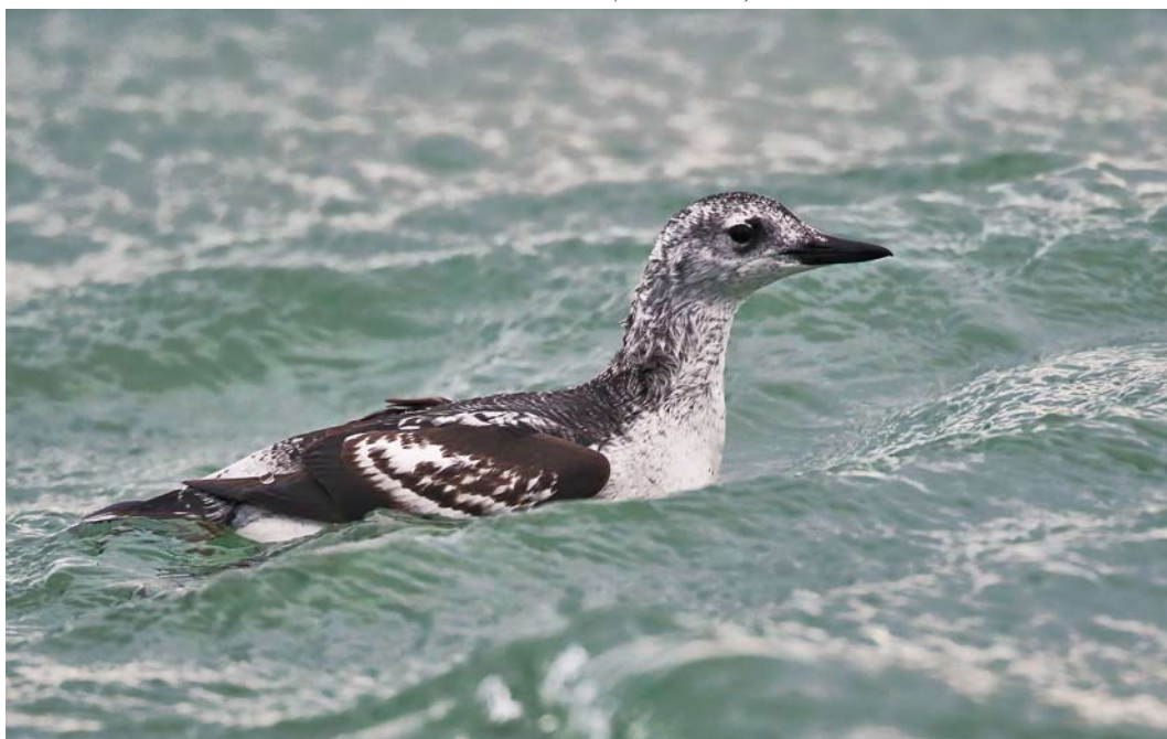
184 Zwarte Zeekoet / Black Guillemot Cephus grylle , eerstejaars, Vluchthaven Neeltje Jans, Zeeland, 6 december 2015