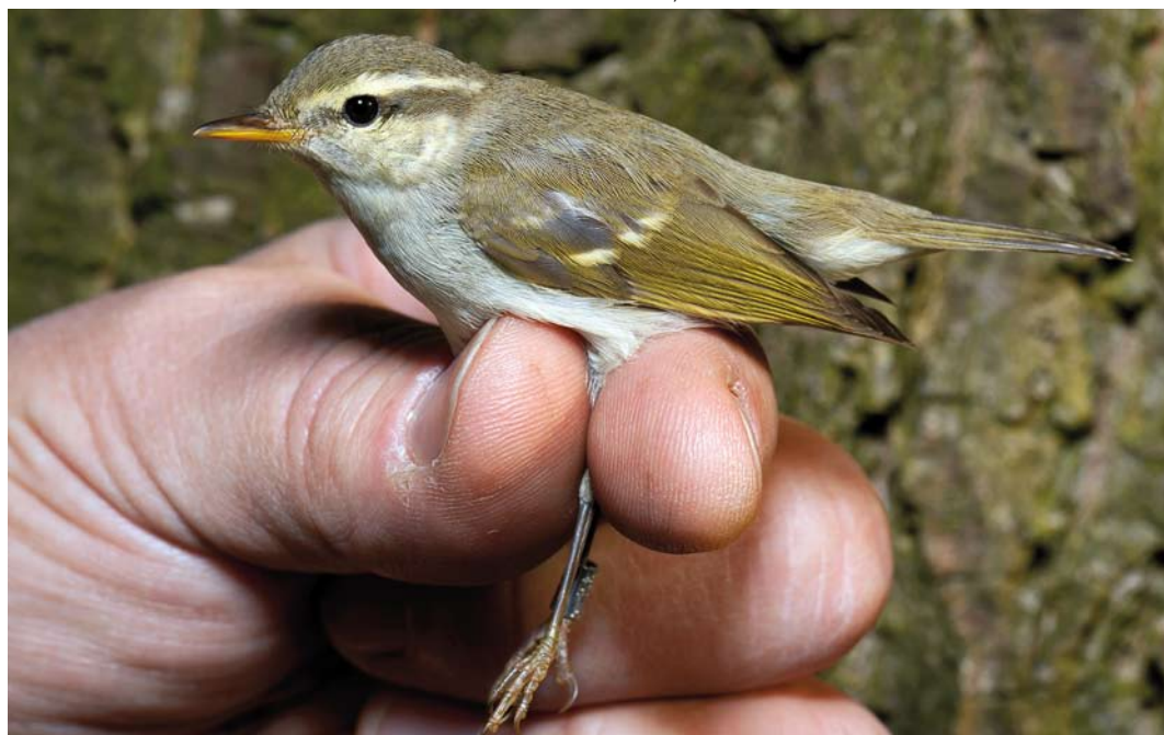
145 Swinhoes Boszanger / Two-barred Warbler Phylloscopus plumbeitarsus , Kamperhoek, Flevoland, 23 november 2013

Thuisgekomen wierp MR een snelle blik in Svensson et al (2012); het eerste wat hem opviel waren de bij de gevangen vogel ontbrekende wit-