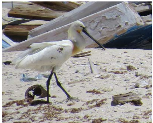
113 Red Sea Spoonbills / Rode-Zeelepelaars Platalea leucorodia archeri and Indian Reef Herons / Rode-Zeerifreigers Egretta gularis schistacea , Ashrafi, Red Sea Governate, Egypt, 12 June 2014 (Mohamed I Habib). Mixed colony. 114 Red Sea Spoonbill / Rode-Zeelepelaar Platalea leucorodia archeri , adult, Ashrafi, Red Sea Governate, Egypt, 19 June 2013 (Mohamed I Habib). Bird trying to remove oil contamination during preening. 115 Red Sea Spoonbill / Rode-Zeelepelaar Platalea leucorodia archeri , adult, Big Magawish Island, Red Sea Governate, Egypt, 18 June 2013 (Mohamed I Habib). Note garbage on island and oil staining on bird.

In 2013, we (re)visited three islands (Abu Mingar, Ashrafi and Big Magawish). On 18 June, one pair with a nest and a nestling of three weeks old was seen on Big Magawish. On 19 June, four pairs incubating four nests were found on Ashrafi.