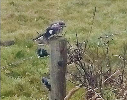
192 Maskerklauwier / Masked Shrike Lanius nubicus , first-winter, Hoorn, Terschelling, Friesland, 2 november 2015