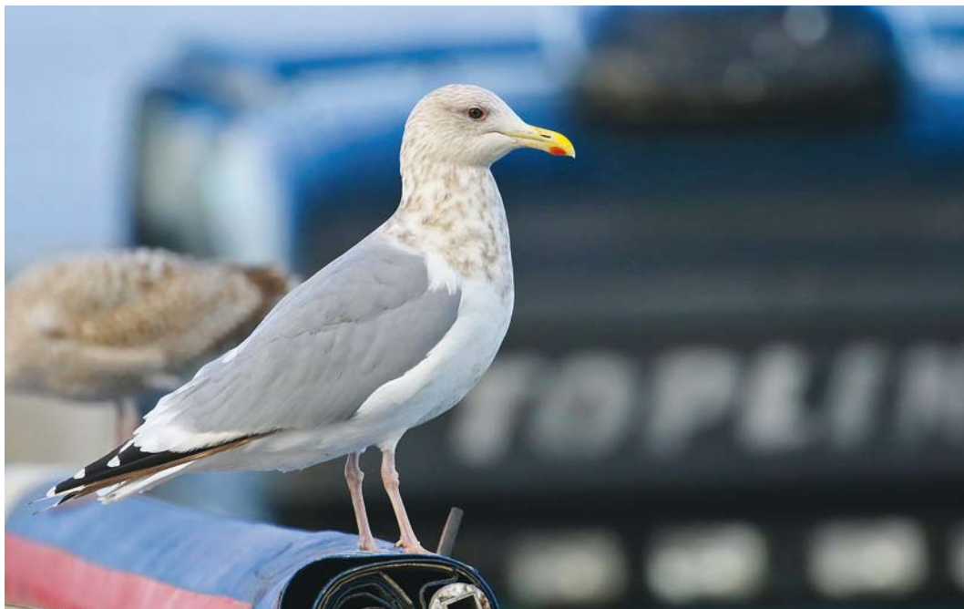
154 Vega Gull / Oost-Siberische Meeuw Larus vegae , adult, Duncannon, Wexford, Ireland, 10 January 2016