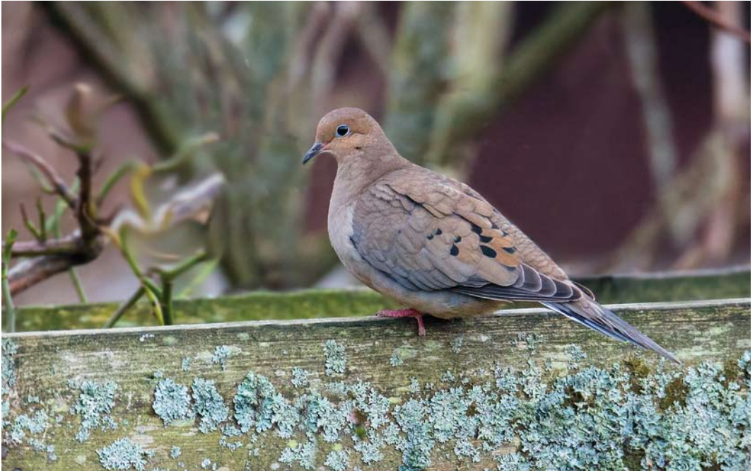
160 Mourning Dove / Treurduif Zenaida macroura , Lerwick, Mainland, Shetland, Scotland, 29 December 2015 (Hugh Harrop)