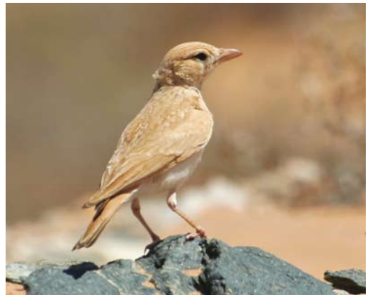
134 Desert Sparrows / Woestijnmussen Passer simplex , Oued Gtta Dwiyaite, Western Sahara, Morocco, May 2015 (Jurek Dyczkowski) 135 Cricket Warbler / Krekelprinia Spiloptila clamans , c 70 km west of Oued Jenna, Western Sahara, Morocco, May 2015 (Jurek Dyczkowski) 136 African Dunn's Lark / Afrikaanse Dunns Leeuwerik Eremophila dunnii dunnii , between Dakhla and Aousserd, Western Sahara, Morocco, May 2015 (Jurek Dyczkowski)

is also the area where the first White-throated Bee-eater Merops albicollis for the WP ('sensu BWP') was recorded in December 2013 (Bergier et al 2015). It is likely that more discoveries will follow; the Sahara desert is not a barrier of lifeless dunes but is dotted with vegetated wadis. Birds move between these patches of habitat, and it is possible that other sub-Saharan species appear