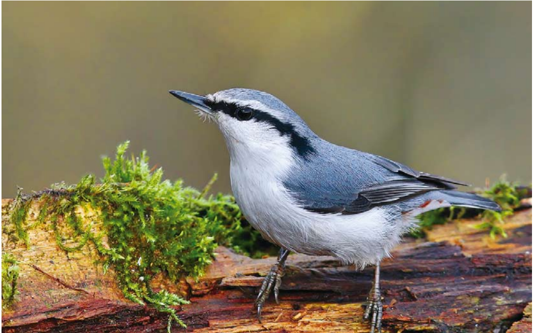
179 Asian Nuthatch / Aziatische Boomklever Sitta europaea asiatica , male, Augustów, Podlaskie, Poland, 18 November 2015