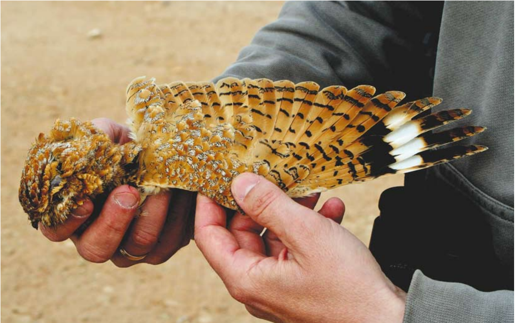
131-132 Golden Nightjar / Goudgele Nachtzwaluw Caprimulgus eximius , between Dakhla and Aousserd, Western Sahara, Morocco, 3 May 2015 (Jurek Dyczkowski)