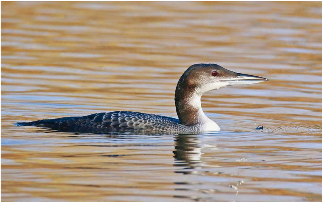
153 Great Northern Loon / Ijsduiker Gavia immer , first-winter, Drava river, Otok, Croatia, 28 November 2015 (Maciej Szymański)