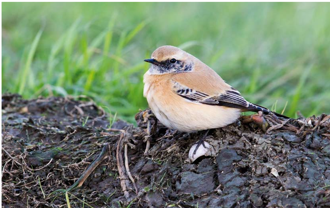
190 Woestijntapuit / Desert Wheatear Oenanthe deserti , eerstejaars mannetje, Elsgeestepolder, Voorhout, Zuid-Holland, 20 november 2015 ( René van Rossum )