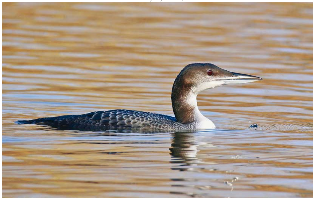
153 Great Northern Loon / IJsduiker Gavia immer , first-winter, Drava river, Otok, Croatia, 28 November 2015 (Maciej Szymański)