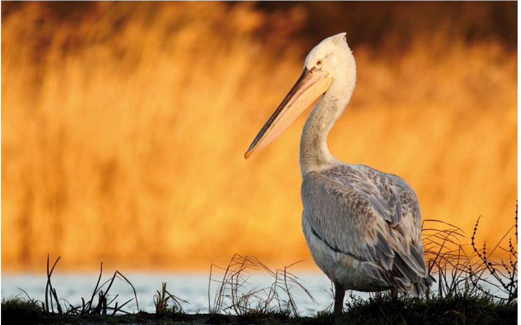
158 Dalmatian Pelican / Kroeskoppelikaan Pelecanus crispus , second calendar-year, Wierzbiczany, Kujawsko-Pomorskie, Poland, 22 December 2015