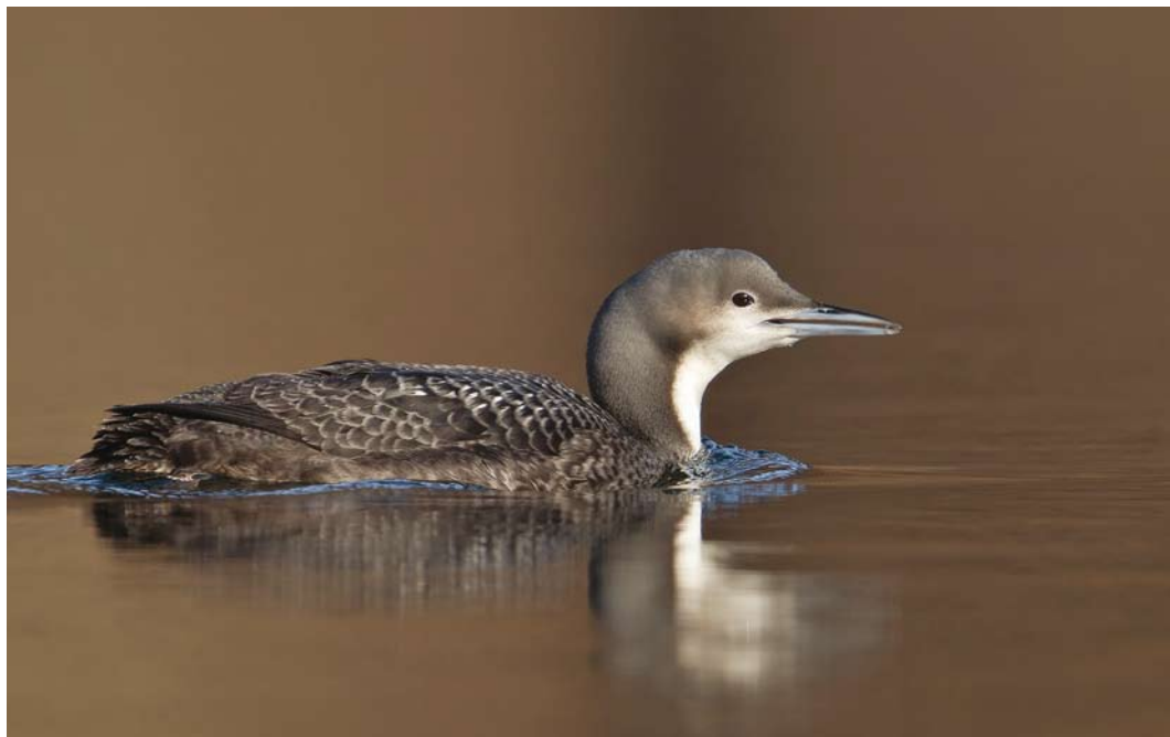
152 Pacific Loon / Pacifische Parelduiker Gavia pacifica , first-winter, Silvaplannersee, Graubünden, Switzerland, 22 December 2015