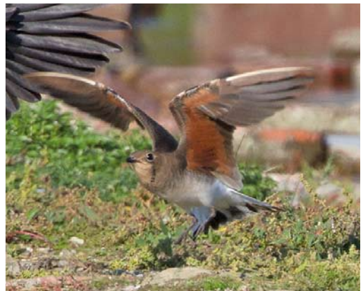
103 Oosterse Vorkstaartplevier / Oriental Pratincole Glaucophaea maldivarum , adult, Stinkgat, Sint Philipsland, Zeeland, 8 september 2014 ( Jaap Denee ) 104-105 Oosterse Vorkstaartplevier / Oriental Pratincole Glaucophaea maldivarum , adult, Stinkgat, Sint Philipsland, Zeeland, 7 september 2014 ( André Strootman ) 106 Oosterse Vorkstaartplevier / Oriental Pratincole Glaucophaea maldivarum , adult, Stinkgat, Sint Philipsland, Zeeland, 8 september 2014 ( Alex Bos )

plaat 488-489, 2014; www.dutchbirding.nl , www.waarneming.nl ) en geluidsopnamen van Dick Groenendijk, Thomas Luiten en George Tanis ( www.waarneming.nl ).