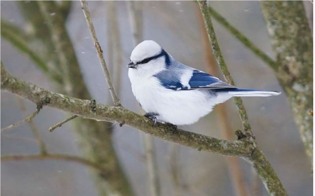
174 Azure Tit / Azuurmees Cyanistes cyanus , Helsinki, Finland, 9 January 2016 (Jan den Hertog)