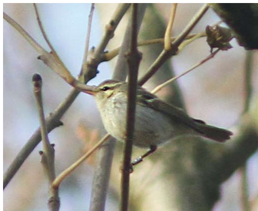
150 Swinhoes Boszanger / Two-barred Warbler Phylloscopus plumbeitarus , Kamperhoek, Flevoland, 2 december 2013 (Marten Miske)

De combinatie van groene bovendelen, witachtige onderdelen, dubbele lichte vleugelstreep en scherp afgetekende lichte wenkbrauwstreep duidt op een Phylloscopus uit de groep 'boszangers met vleugelstrepen', zoals Groene Fitis P nitidus , Swinhoes Boszanger, Grauwe Fitis P trochiloides en Noordse Boszanger P borealis en enkele verwante taxa uit Oost-Azië. Bladkoning en Humes Bladkoning hebben ook een duidelijke dubbele vleugelstreep maar vallen buiten deze groep en kunnen worden uitgesloten omdat beide soorten lichte toppen aan de tertials hebben en compacter zijn gebouwd met een kortere staart; daarnaast heeft Humes Bladkoning overwegend donkere naakte delen en een meer grijsgroen verenkleed. Swinhoes Boszanger verschilt van Grauwe Fitis door de bredere en langere vleugelstreep op de grote dekveren en de koptekening (bij Grauwe Fitis is de wenkbrauw verbonden boven de snavel). Grauwe Fitis vertoont daarnaast in tegenstelling tot Swinhoes Boszanger